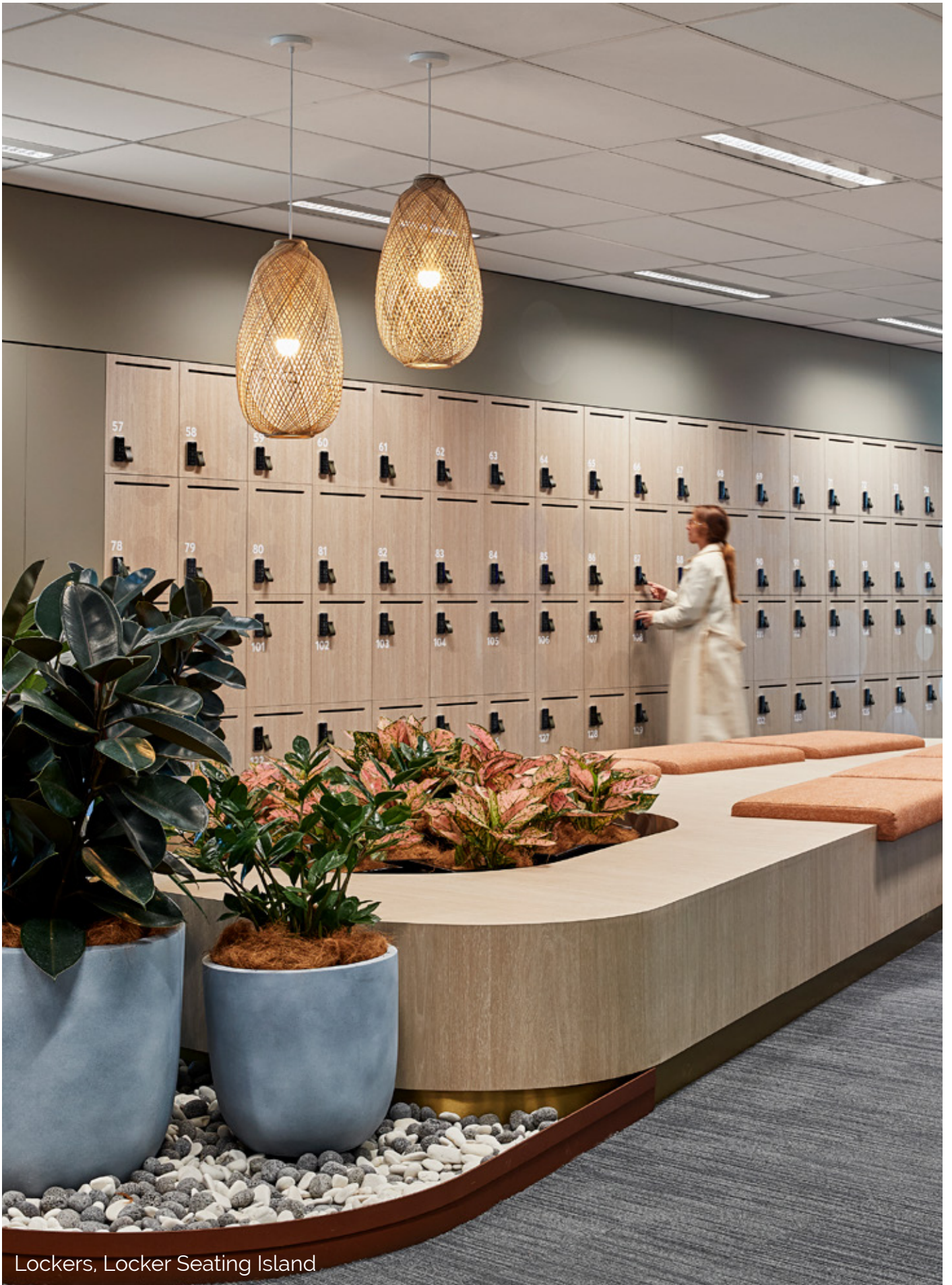
Lockers, Locker Seating Island