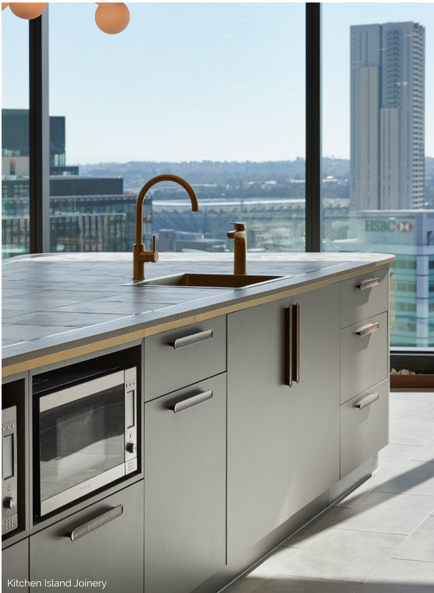
Kitchen Island Joinery