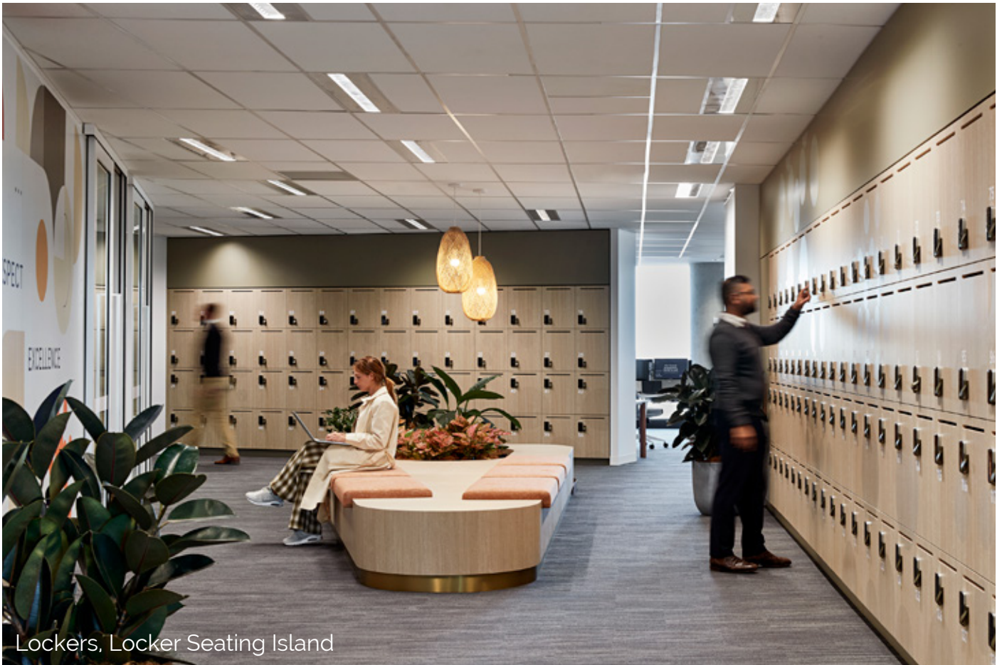
Lockers, Locker Seating Island