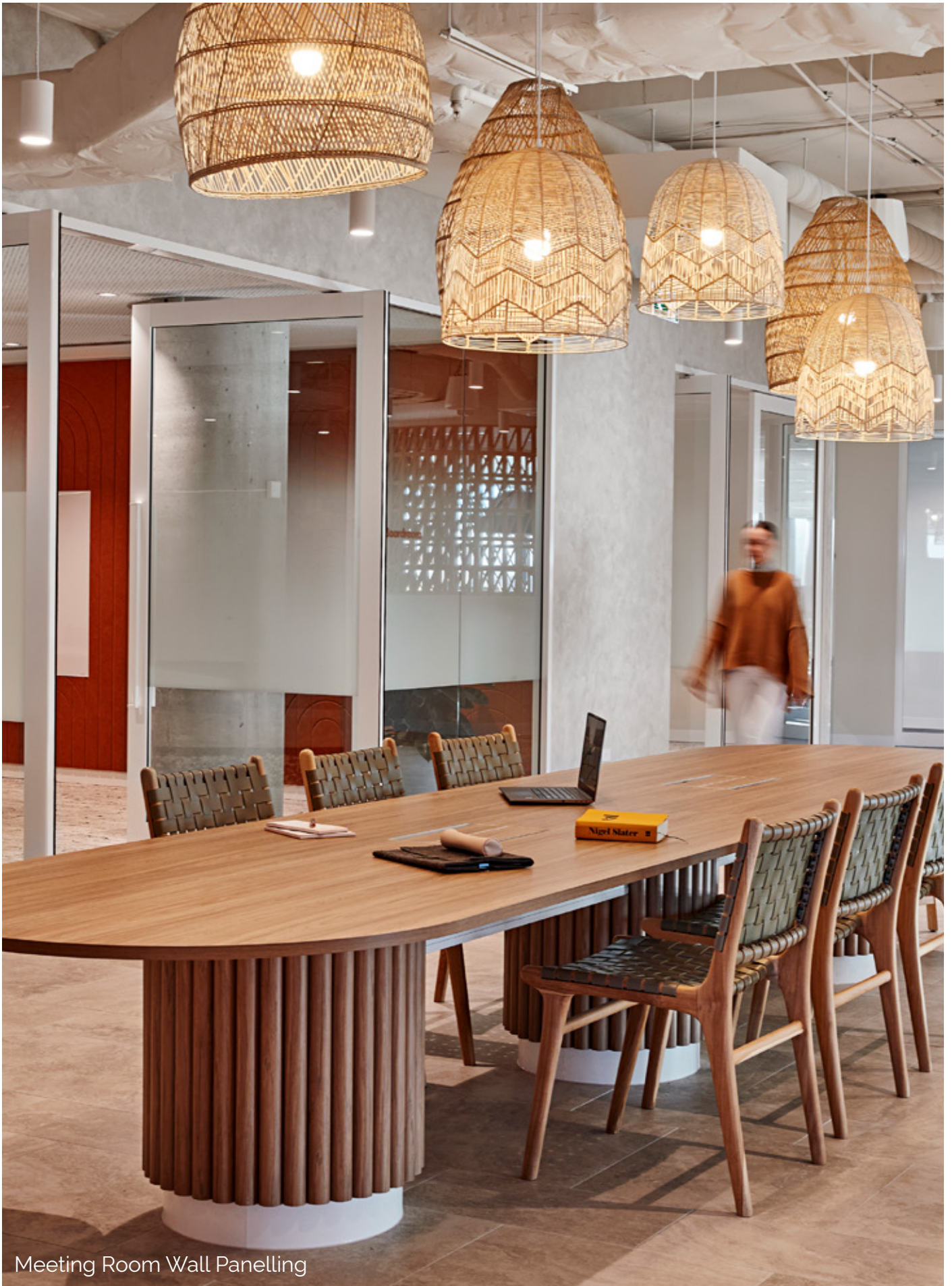
Meeting Room Wall Panelling