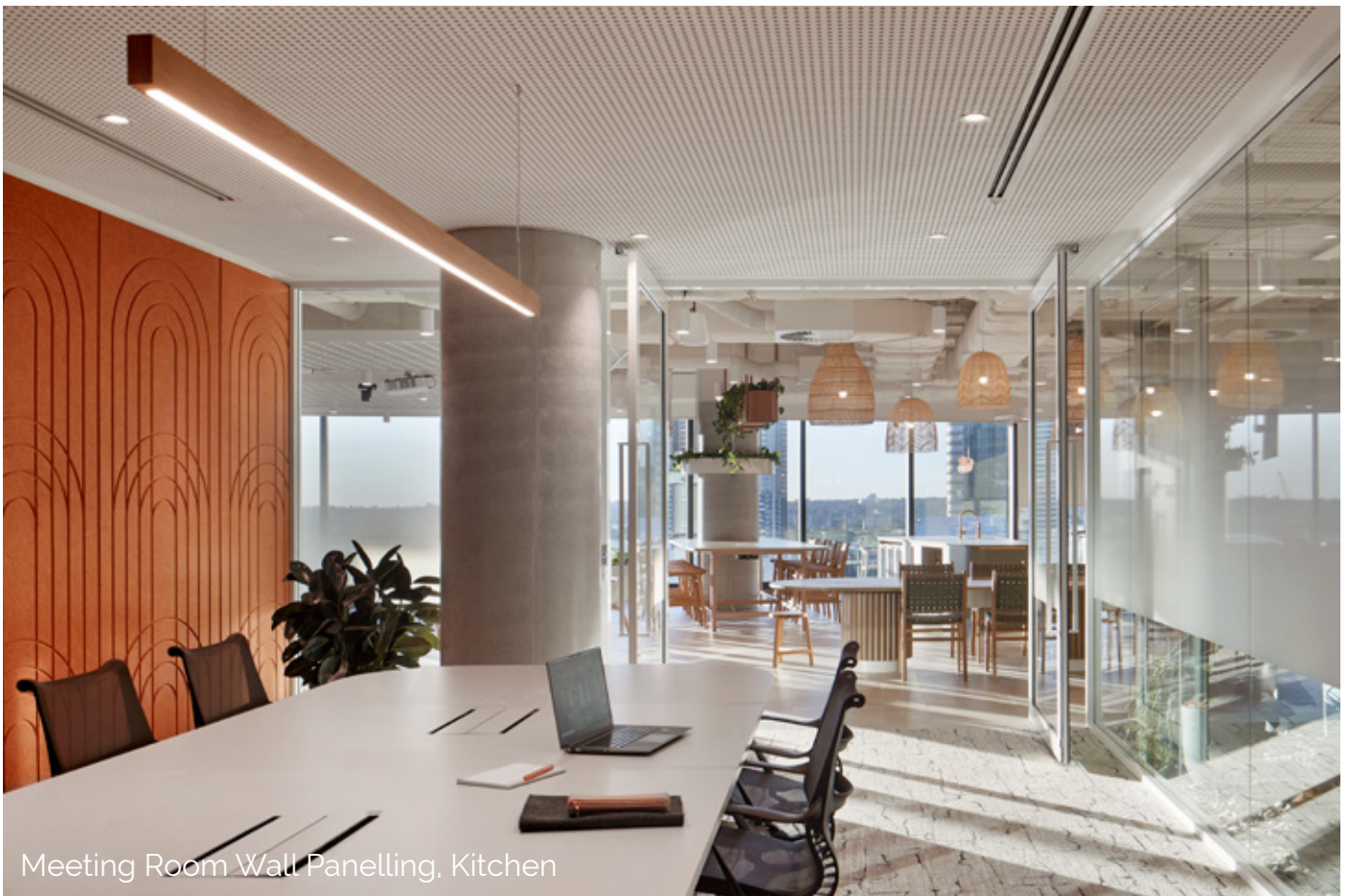
Meeting Room Wall Panelling, Kitchen