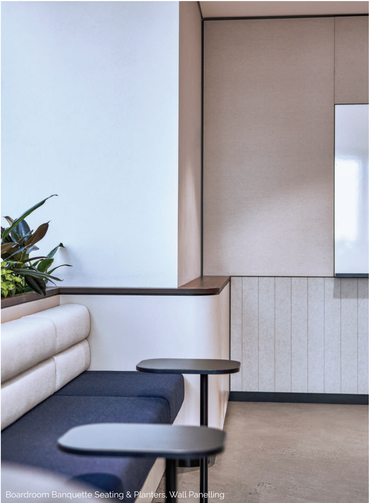
Boardroom Banquette Seating & Planters, Wall Panelling