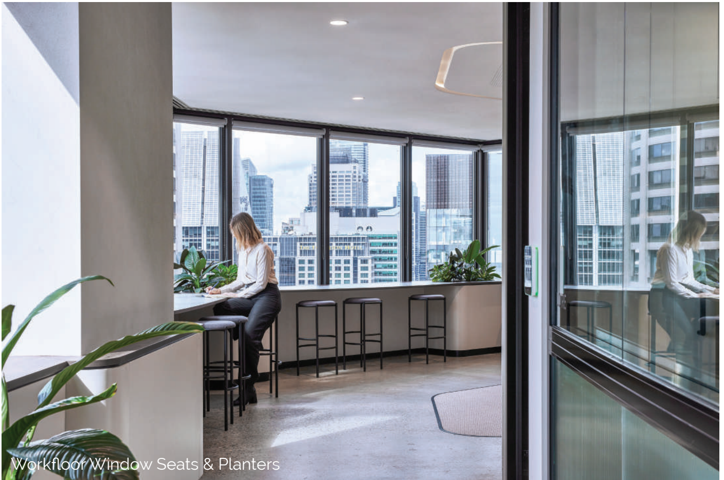
Workfloor Window Seats & Planters