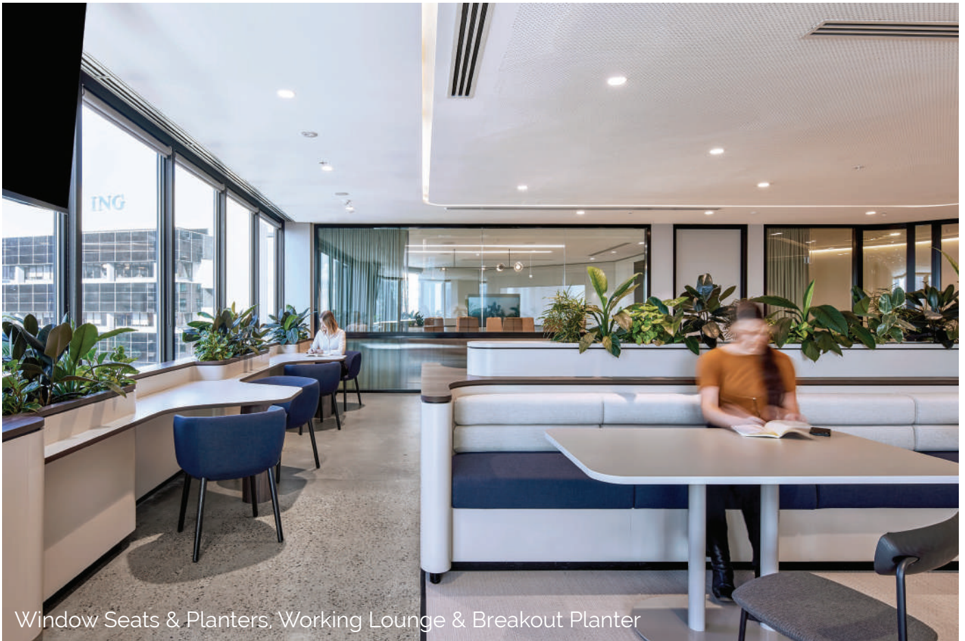
Window Seats & Planters, Working Lounge & Breakout Planter