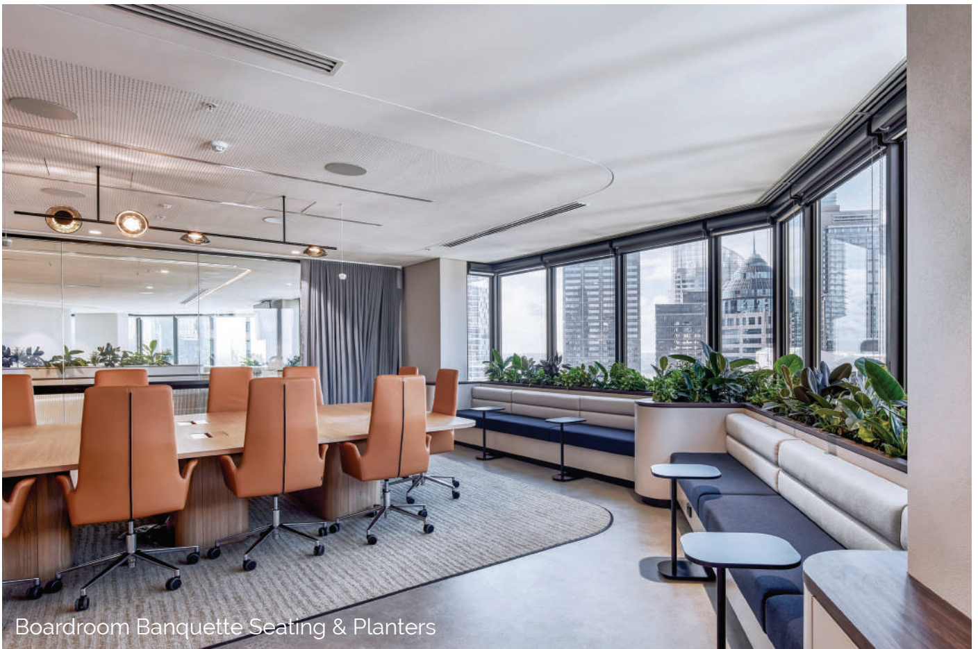
Boardroom Banquette Seating & Planters