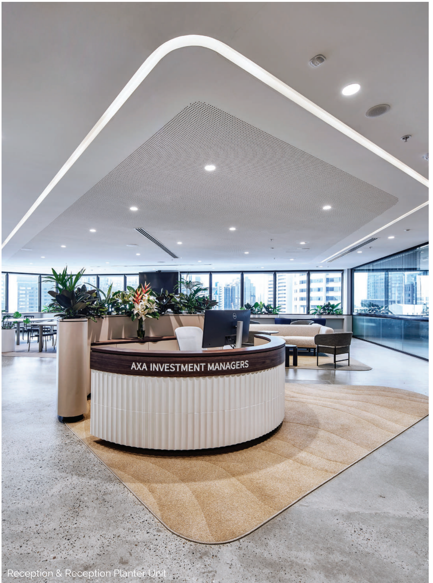
Reception & Reception Planter Unit