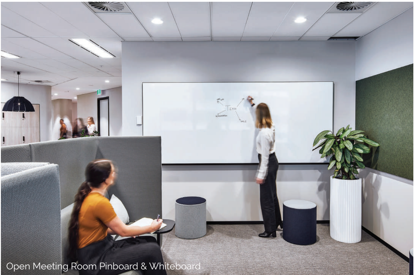
Open Meeting Room Pinboard & Whiteboard