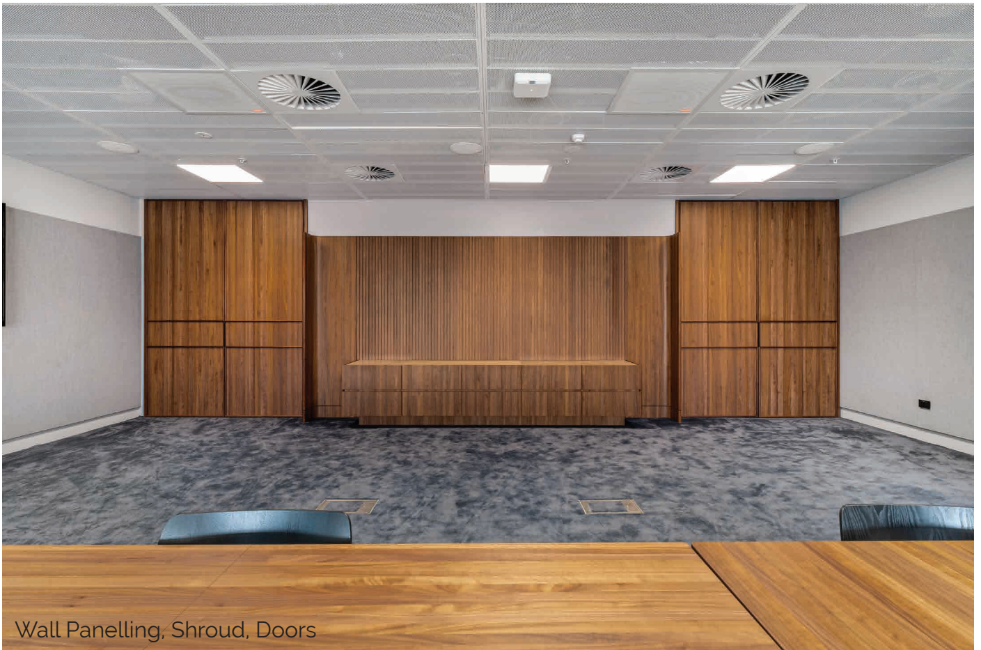
Wall Panelling, Shroud, Doors