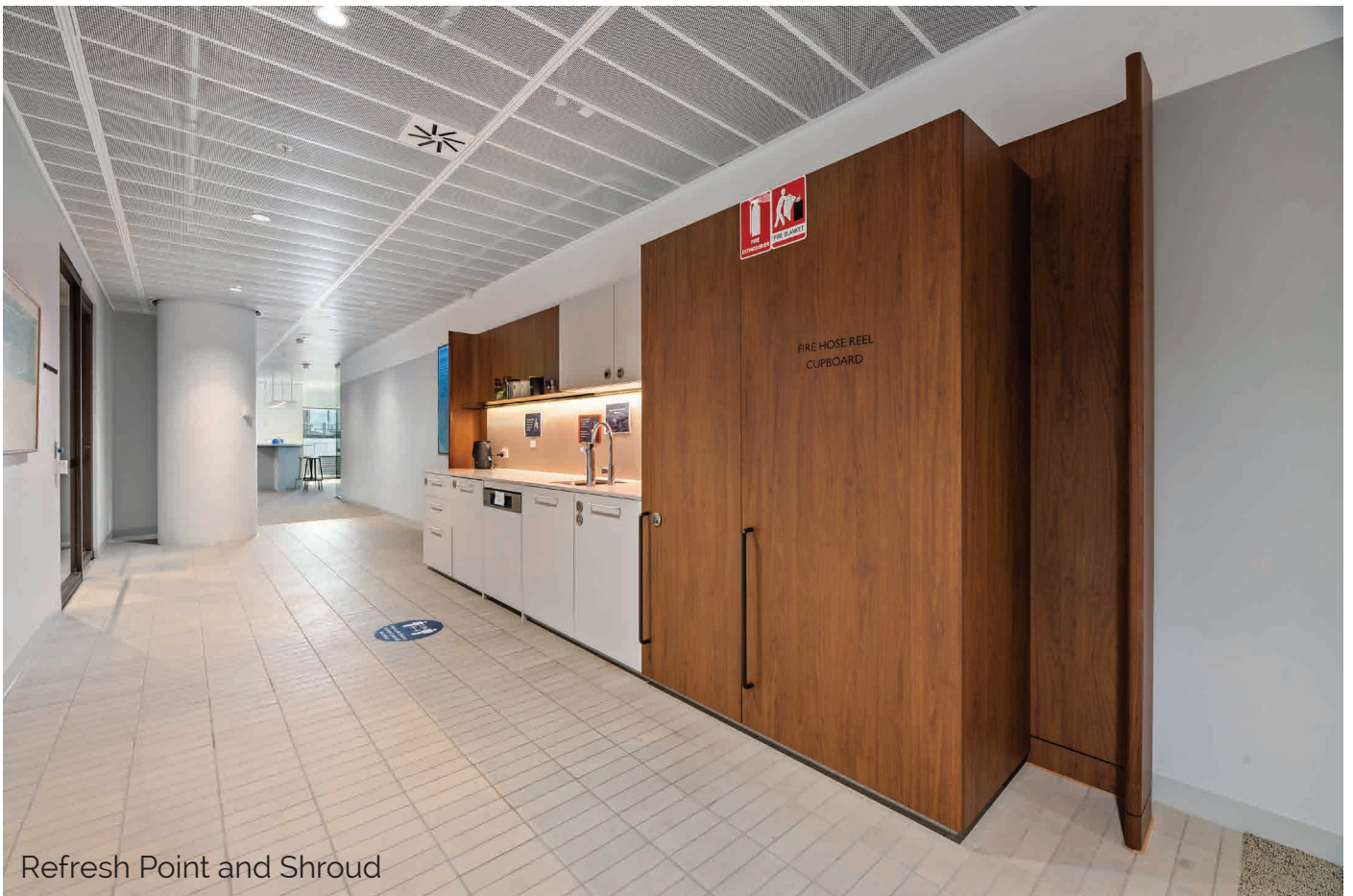
Refresh Point and Shroud