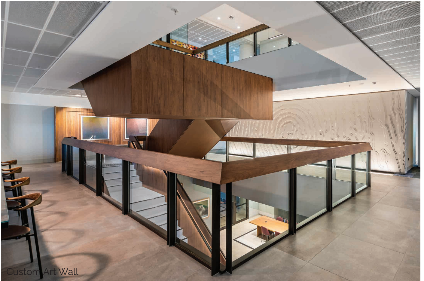
Custom Art Wall