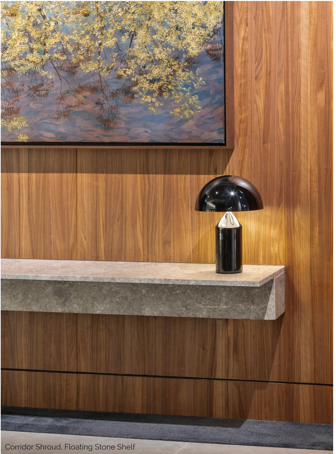
Corridor Shroud, Floating Stone Shelf