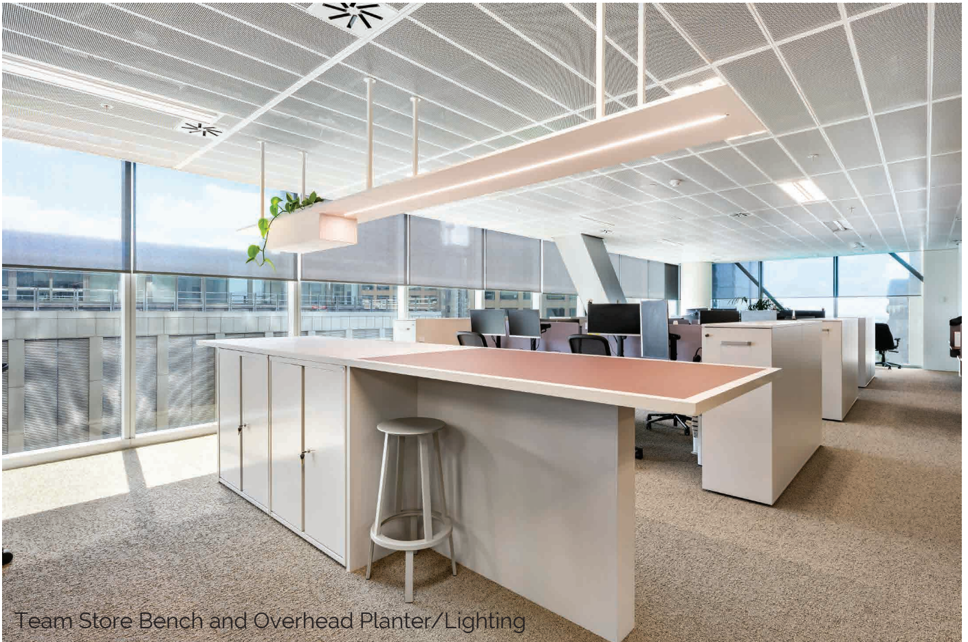
Team Store Bench and Overhead Planter/Lighting