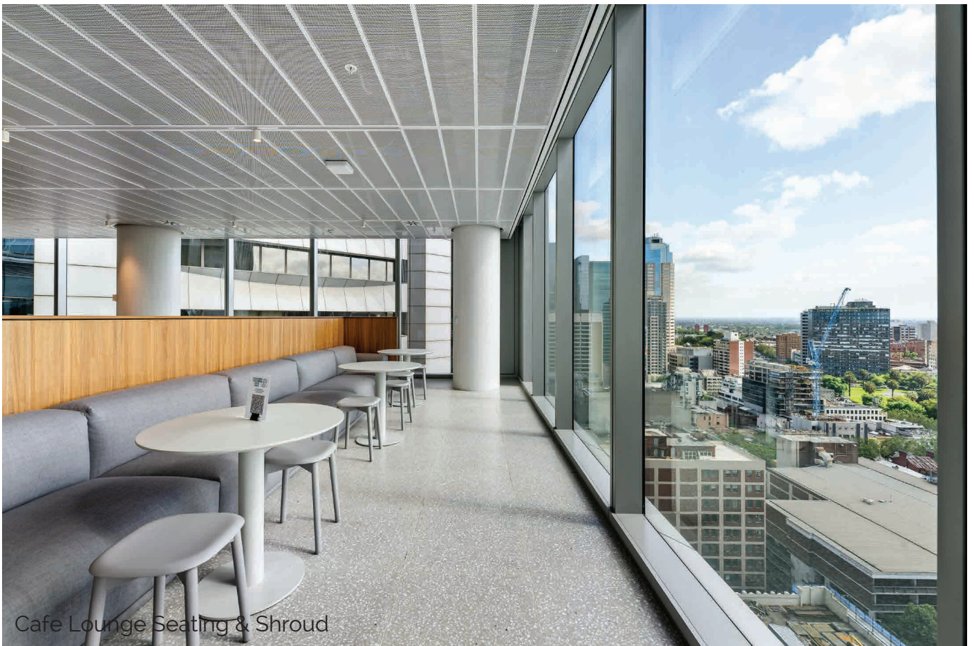
Cafe Lounge Seating & Shroud