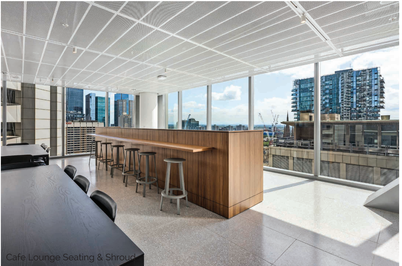
Cafe Lounge Seating & Shroud