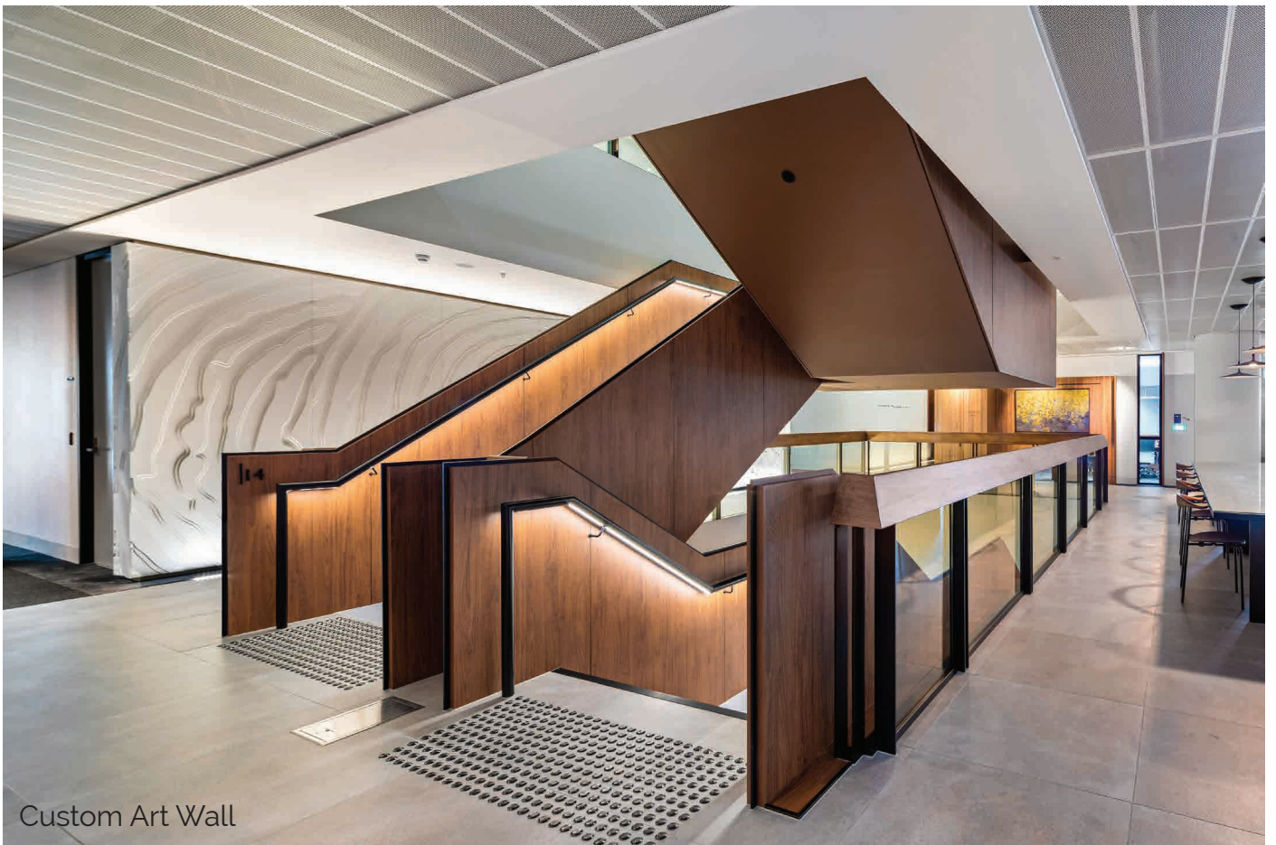
Custom Art Wall