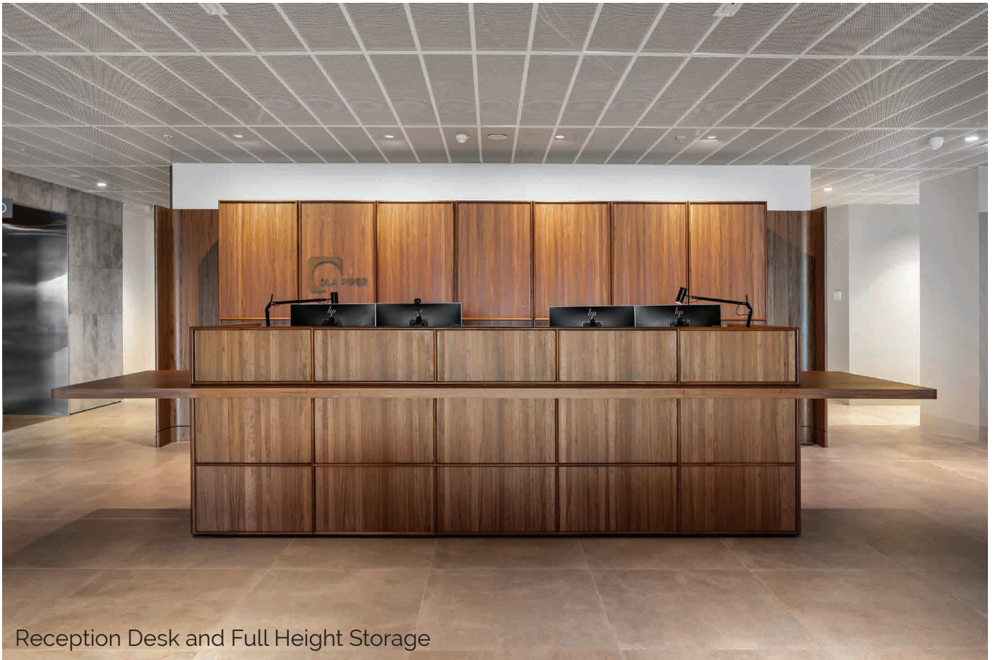
Reception Desk and Full Height Storage