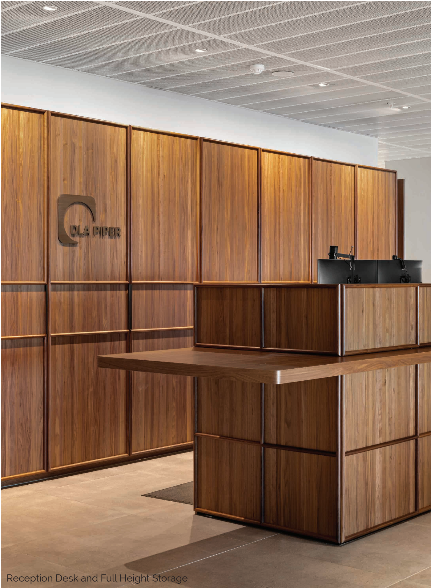
Reception Desk and Full Height Storage