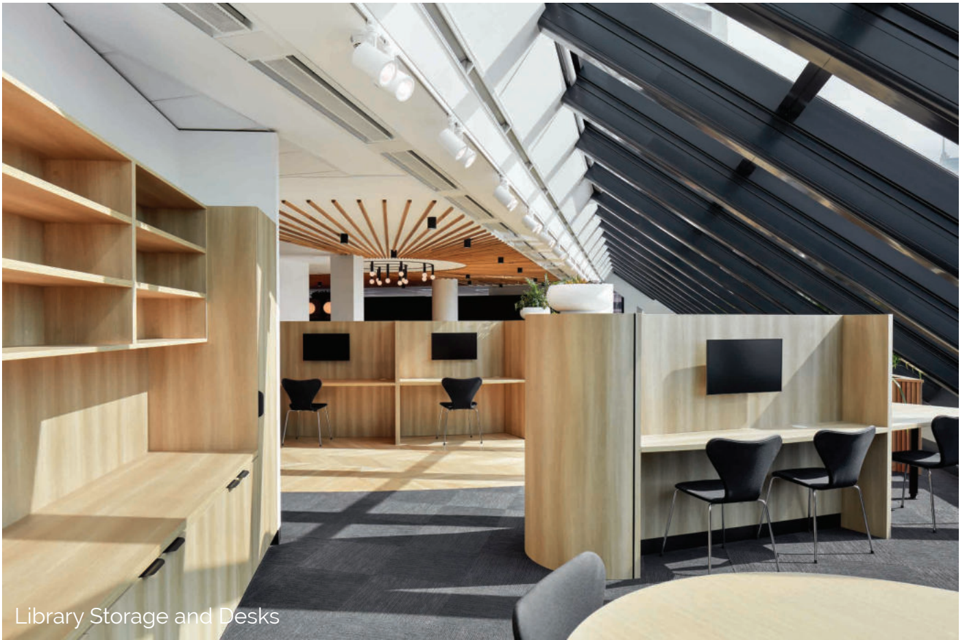
Library Storage and Desks