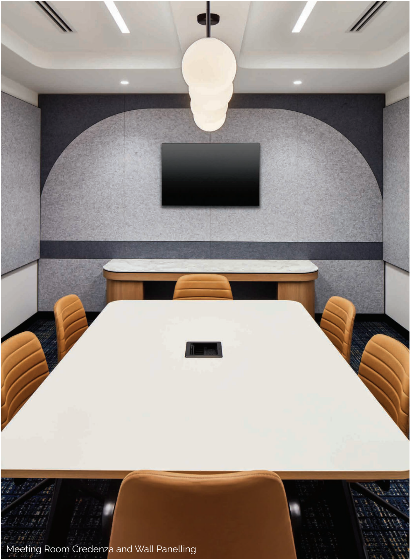
Meeting Room Credenza and Wall Panelling