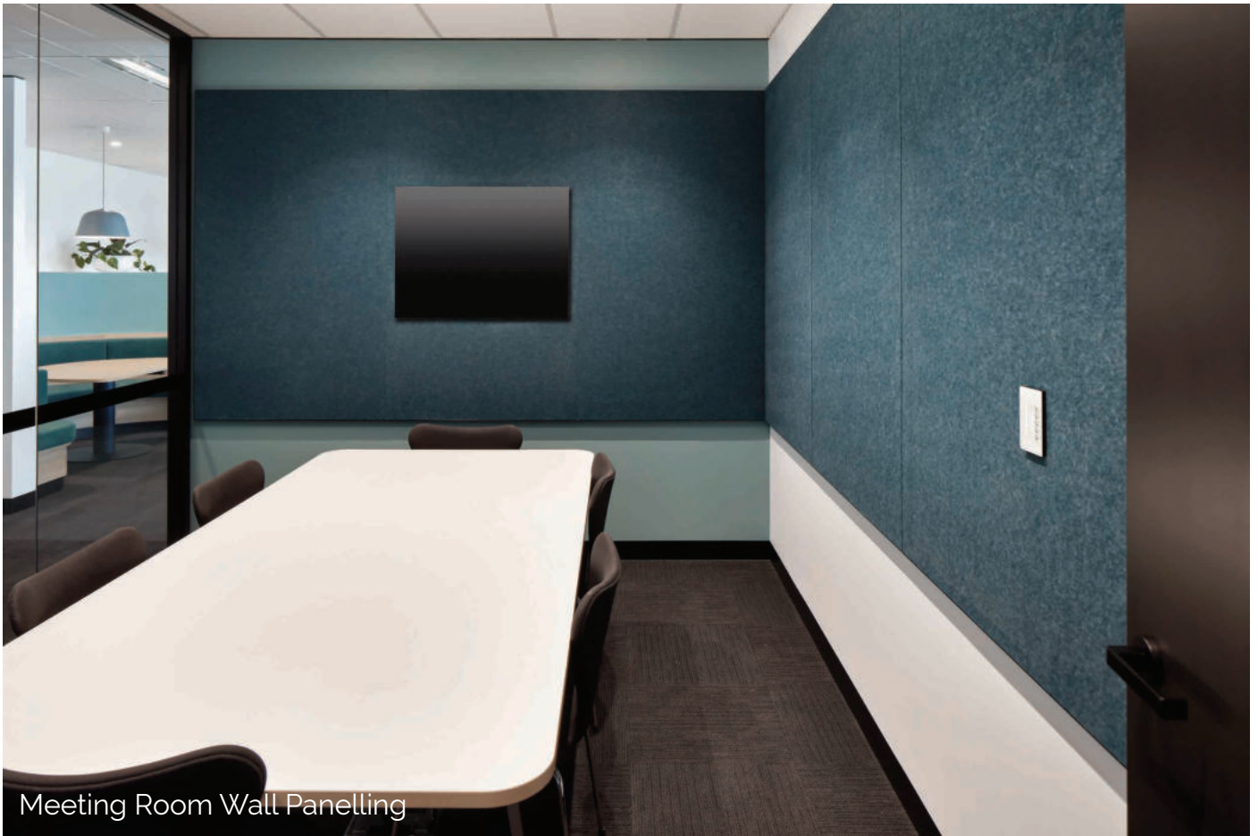
Meeting Room Wall Panelling