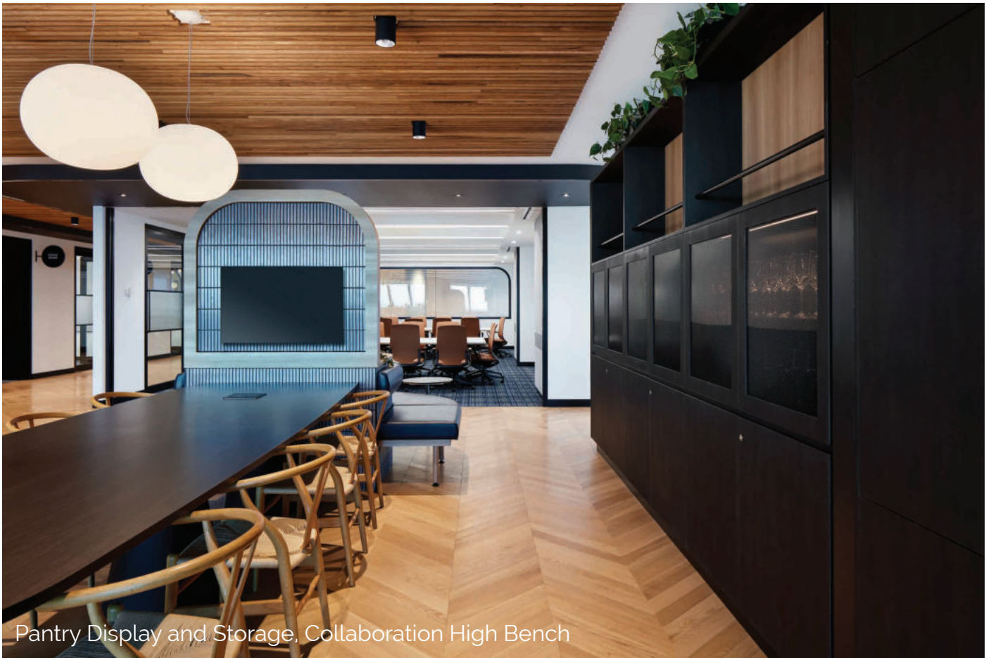
Pantry Display and Storage, Collaboration High Bench