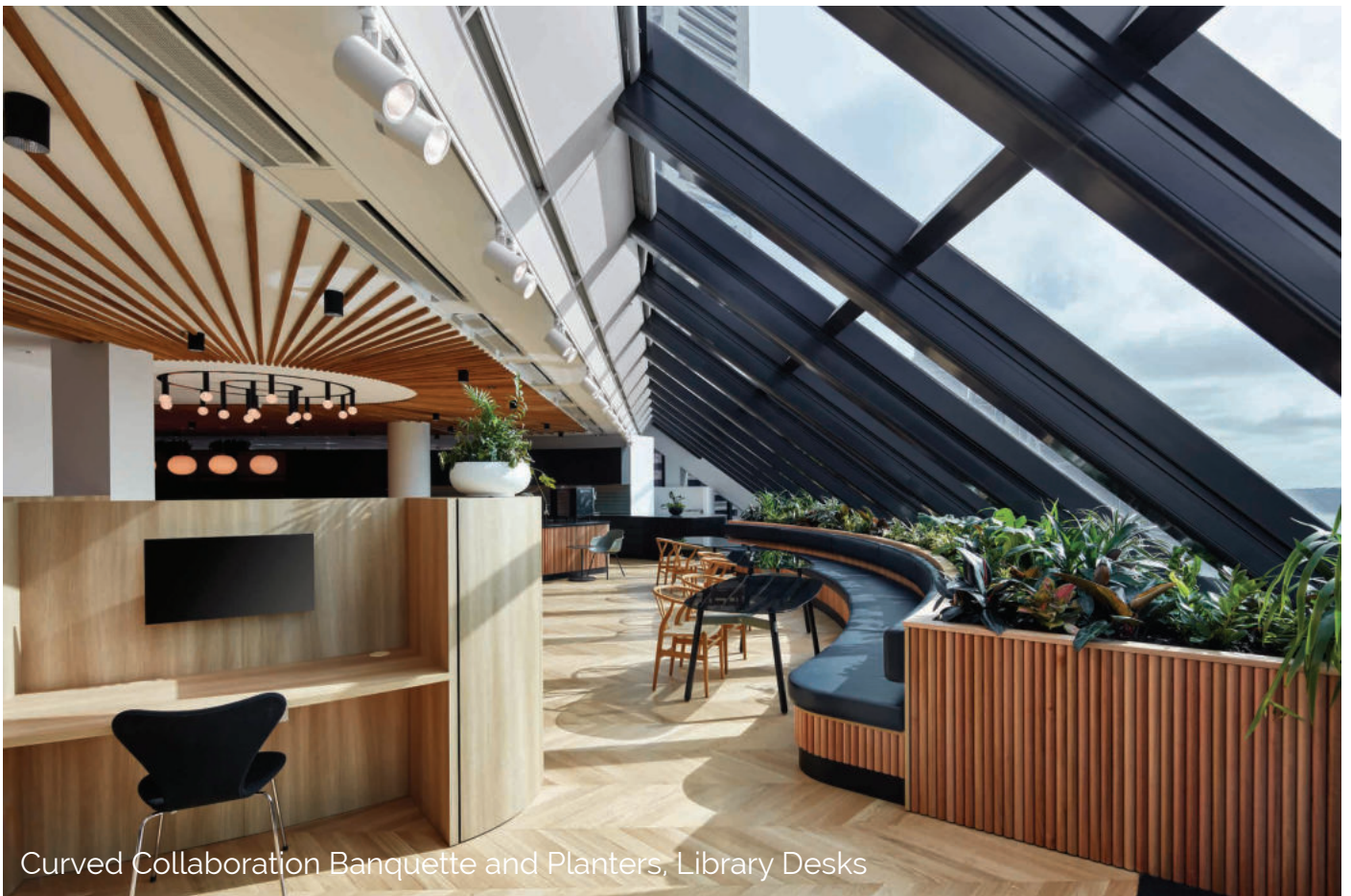
Curved Collaboration Banquette and Planters, Library Desks