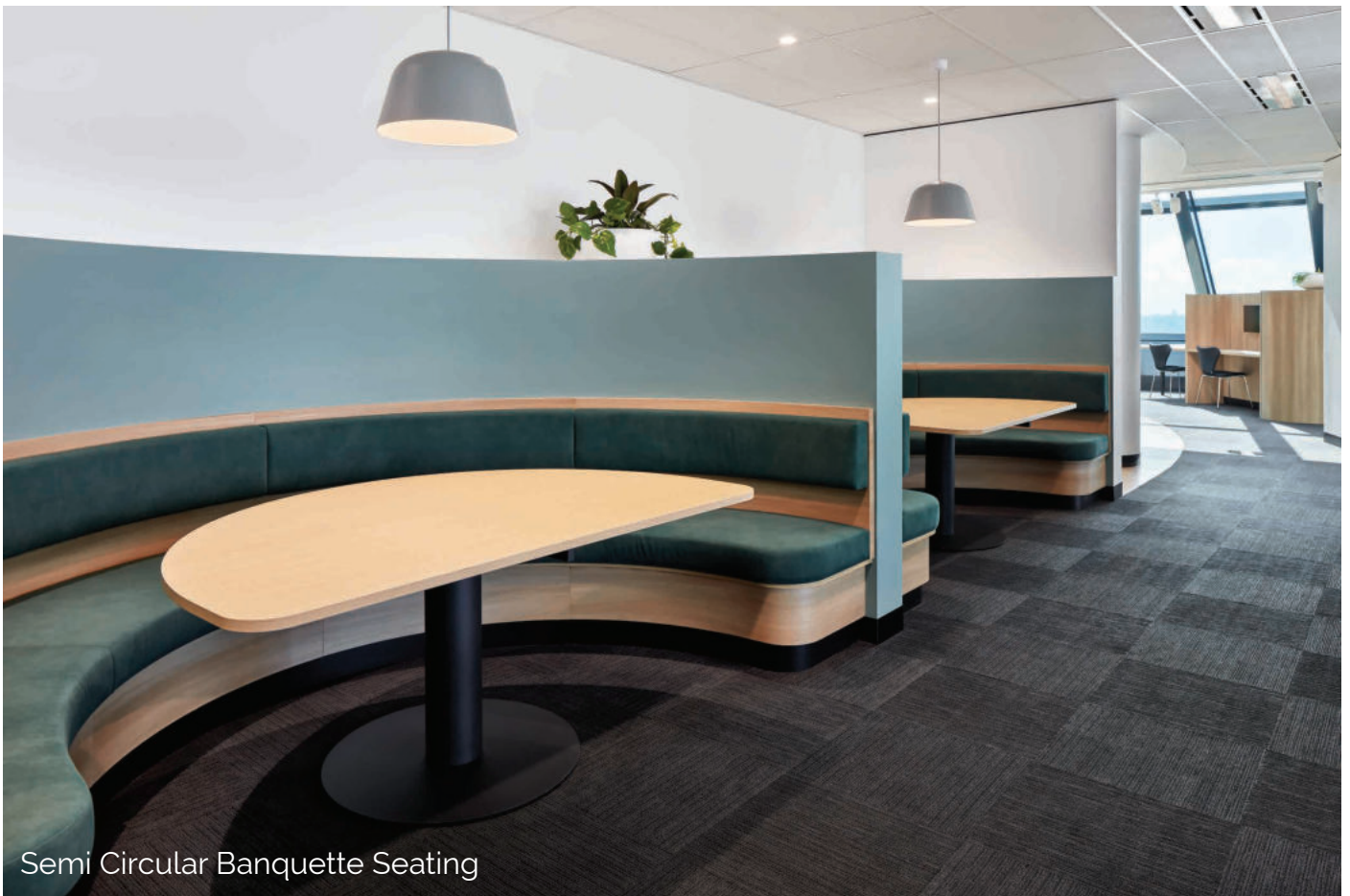
Semi Circular Banquette Seating