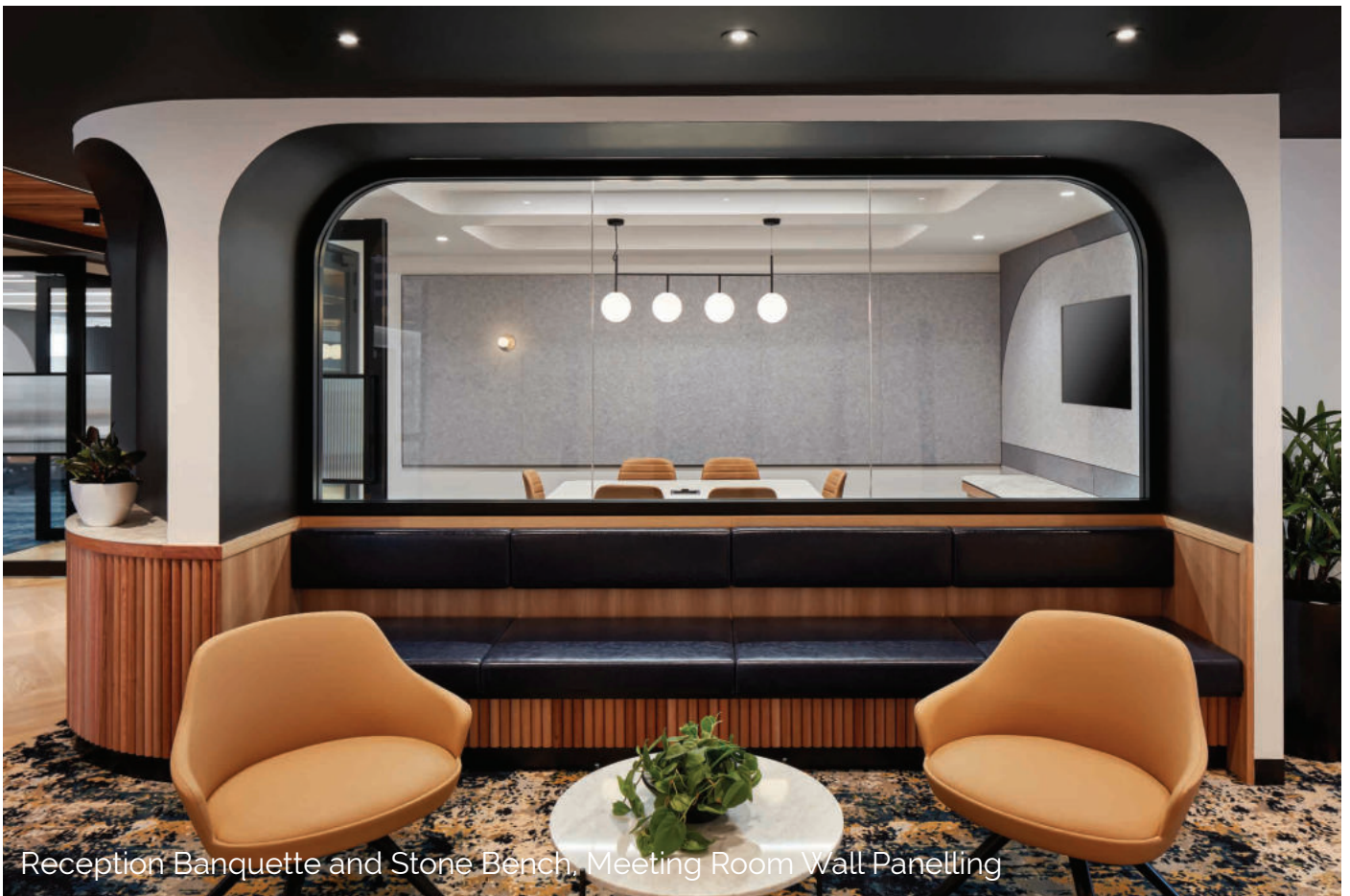
Reception Banquette and Stone Bench, Meeting Room Wall Panelling