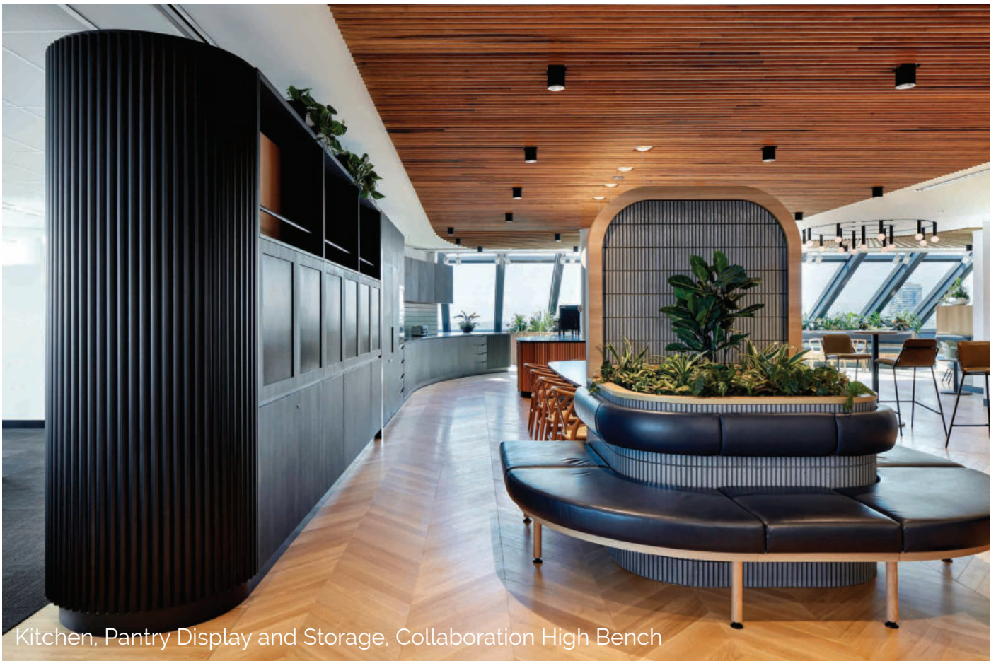
Kitchen, Pantry Display and Storage, Collaboration High Bench