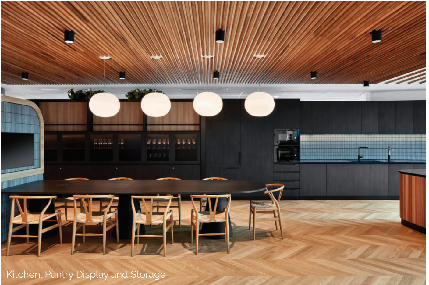
Kitchen, Pantry Display and Storage