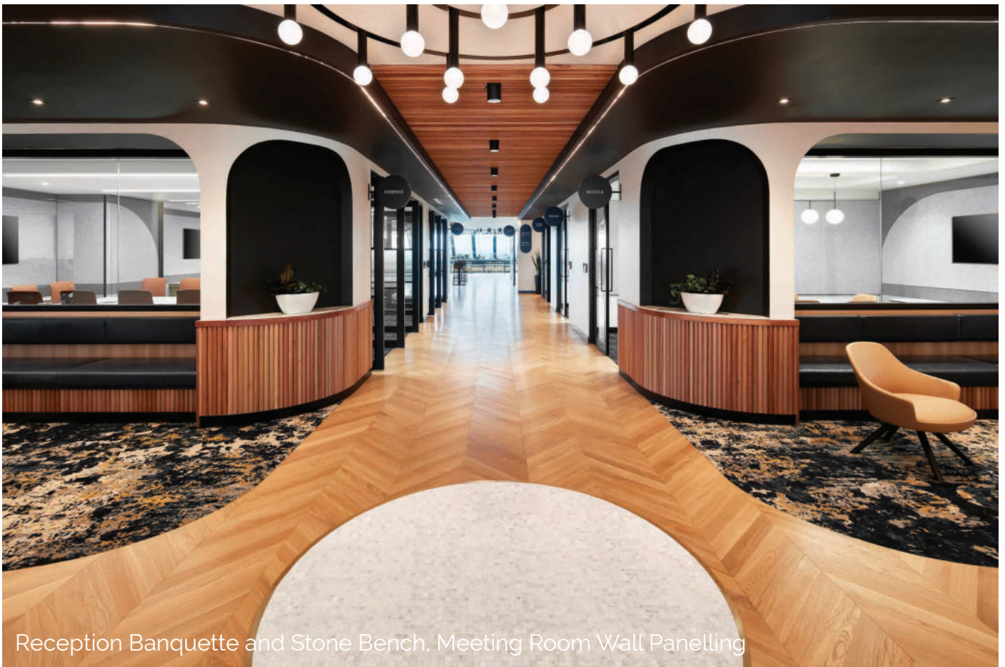
Reception Banquette and Stone Bench, Meeting Room Wall Panelling