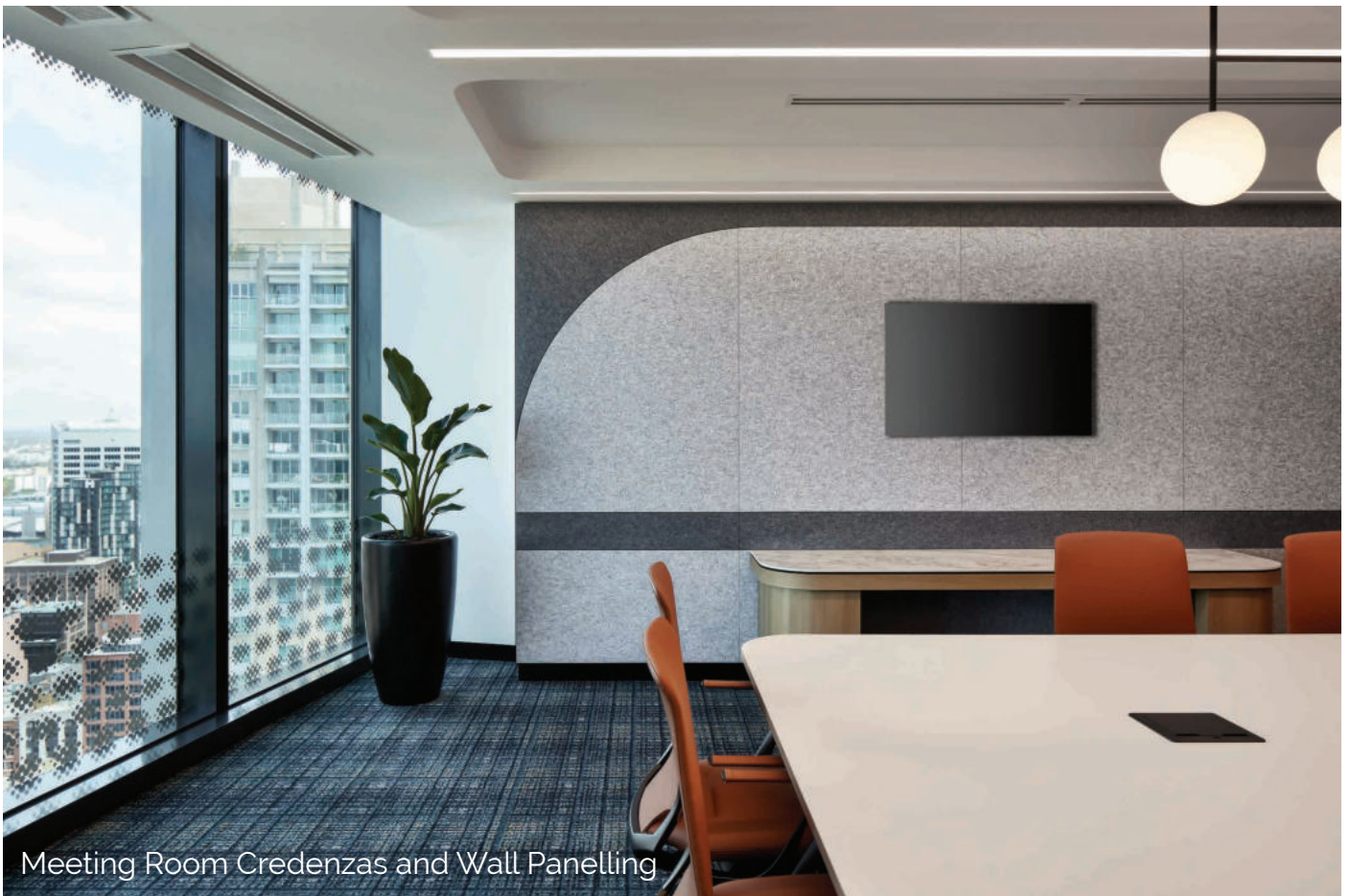
Meeting Room Credenzas and Wall Panelling