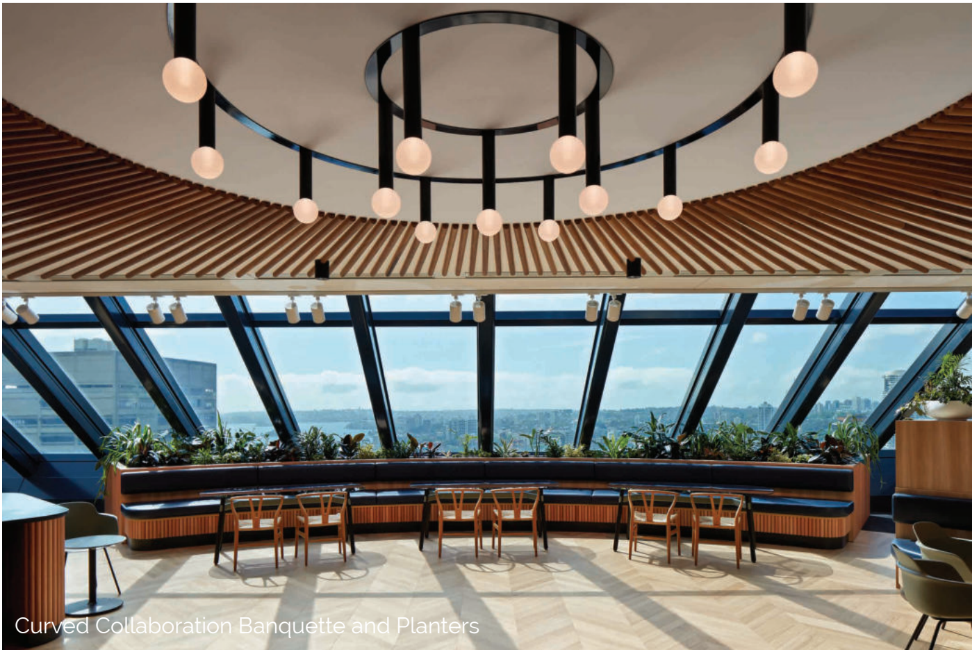
Curved Collaboration Banquette and Planters