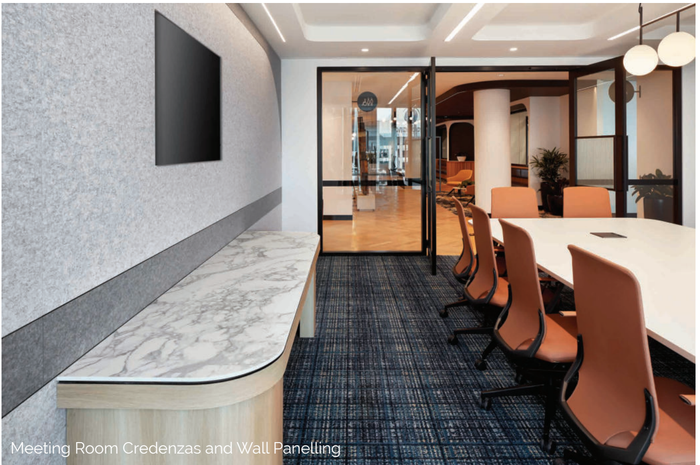
Meeting Room Credenzas and Wall Panelling