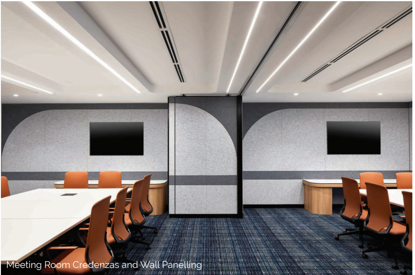
Meeting Room Credenzas and Wall Panelling