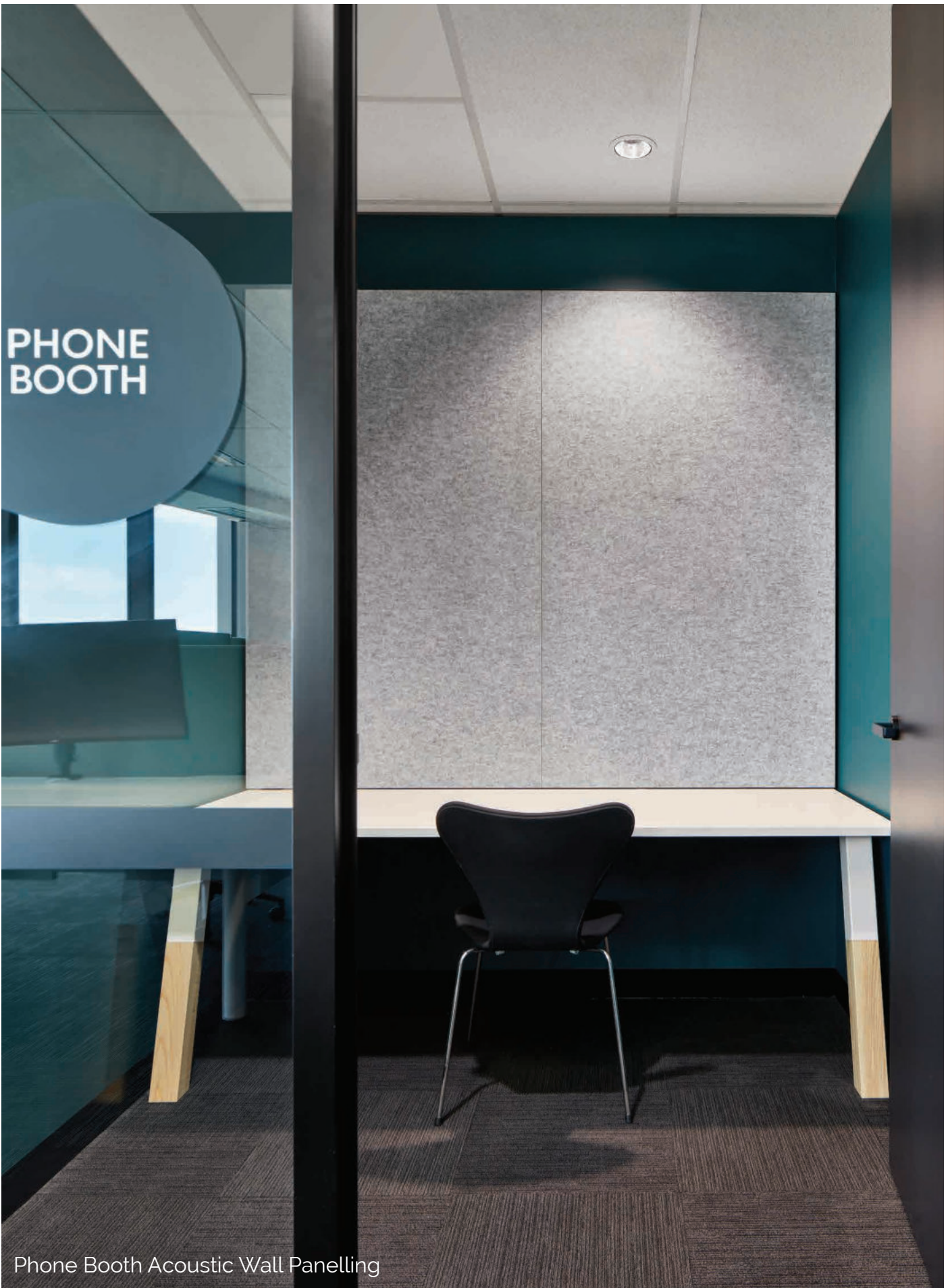
Phone Booth Acoustic Wall Panelling