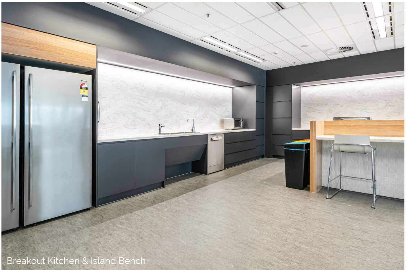
Breakout Kitchen & Island Bench