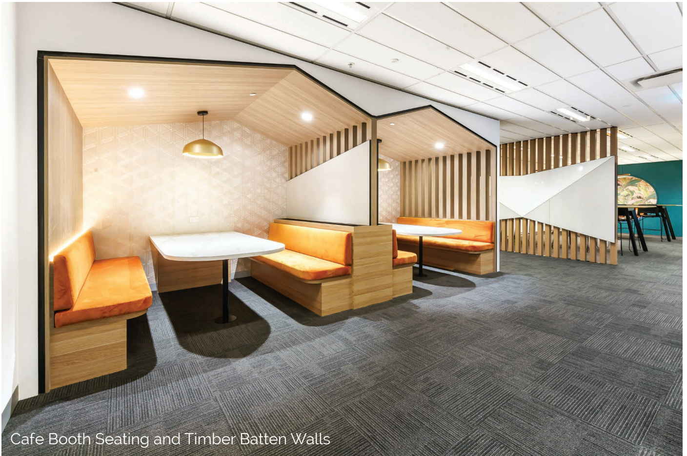
Cafe Booth Seating and Timber Batten Walls