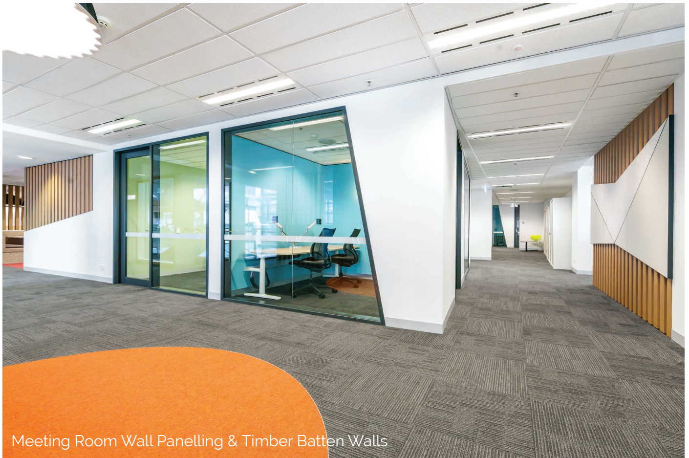
Meeting Room Wall Panelling & Timber Batten Walls