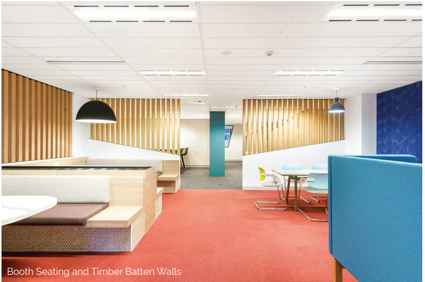
Booth Seating and Timber Batten Walls