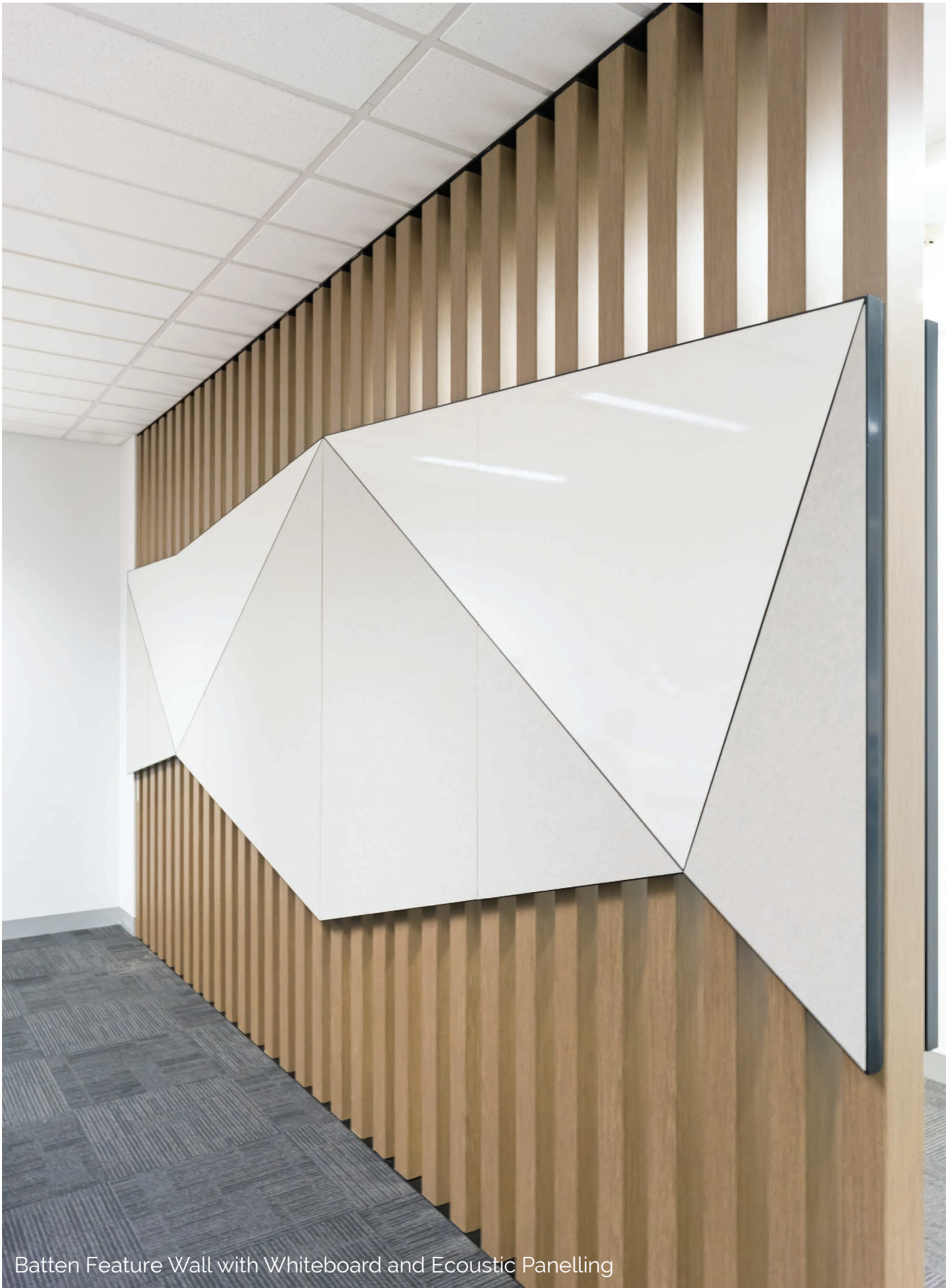
Batten Feature Wall with Whiteboard and Ecooustic Panelling