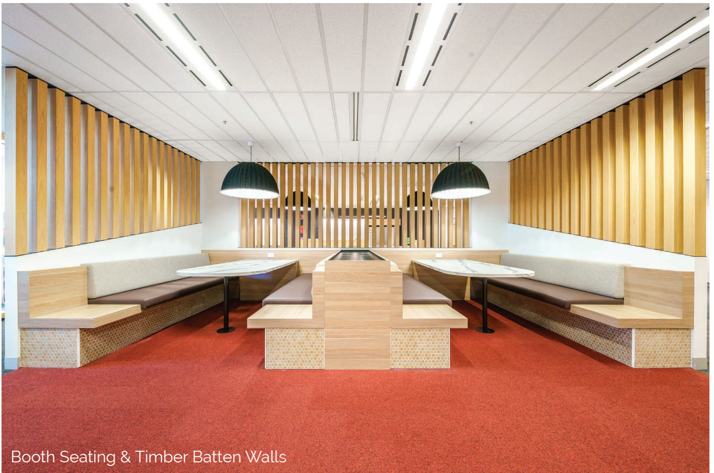
Booth Seating & Timber Batten Walls