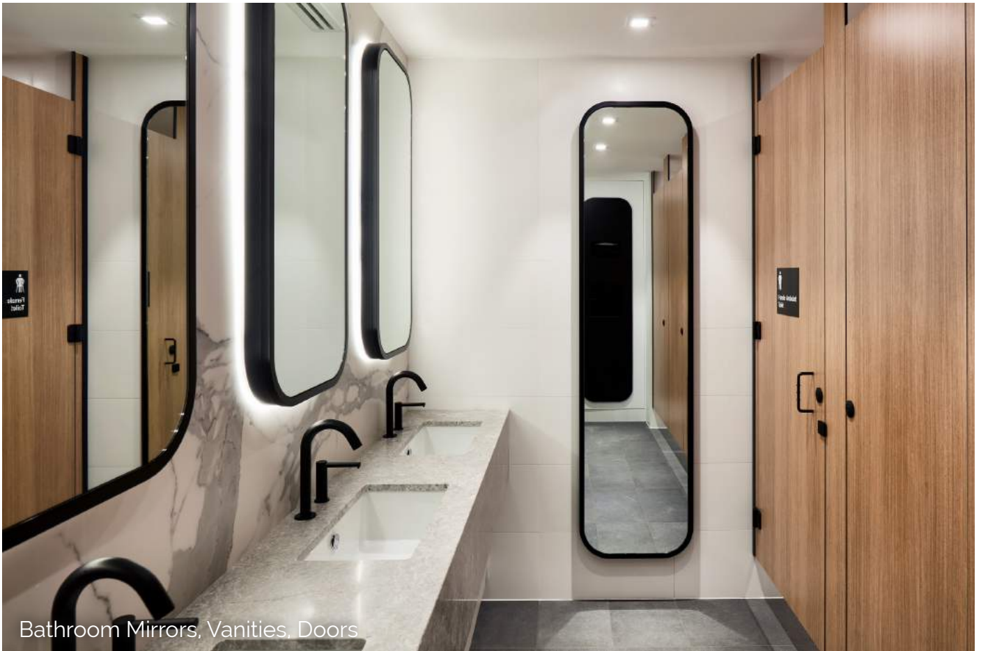
Bathroom Mirrors, Vanities, Doors