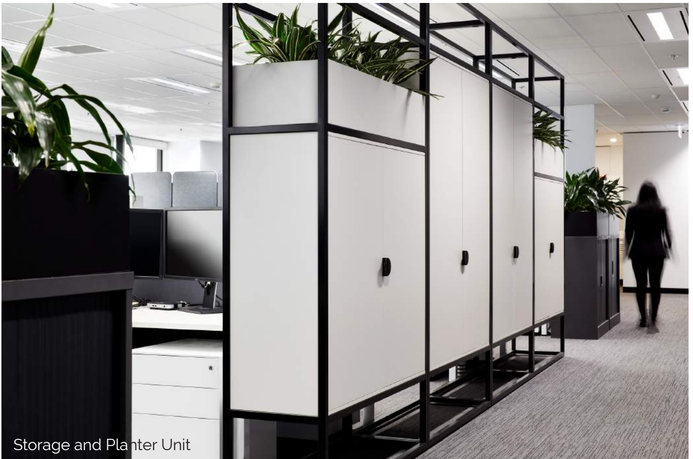
Storage and Planter Unit