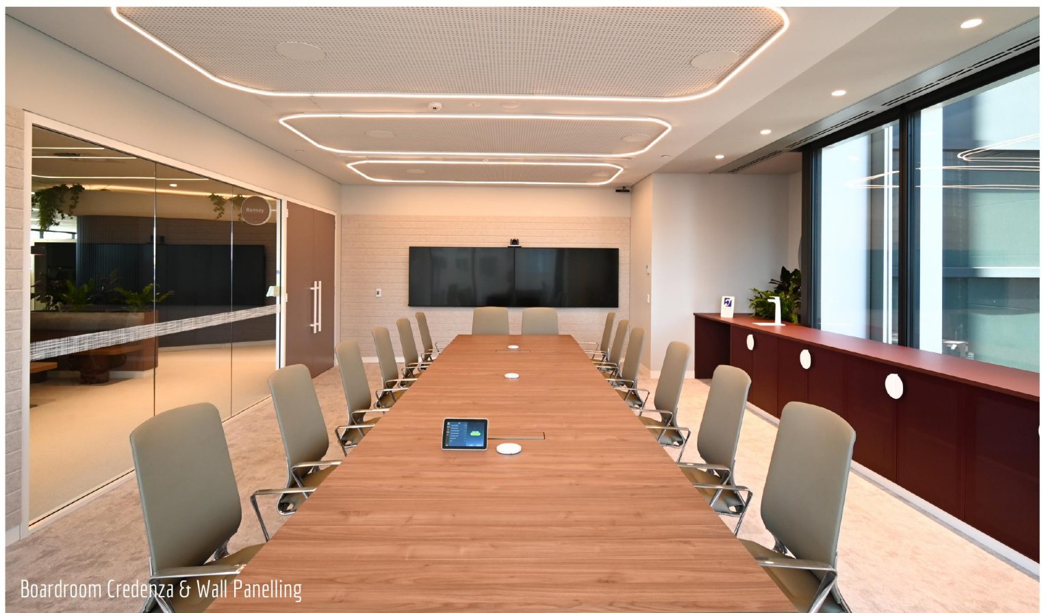
Boardroom Credenza & Wall Panelling