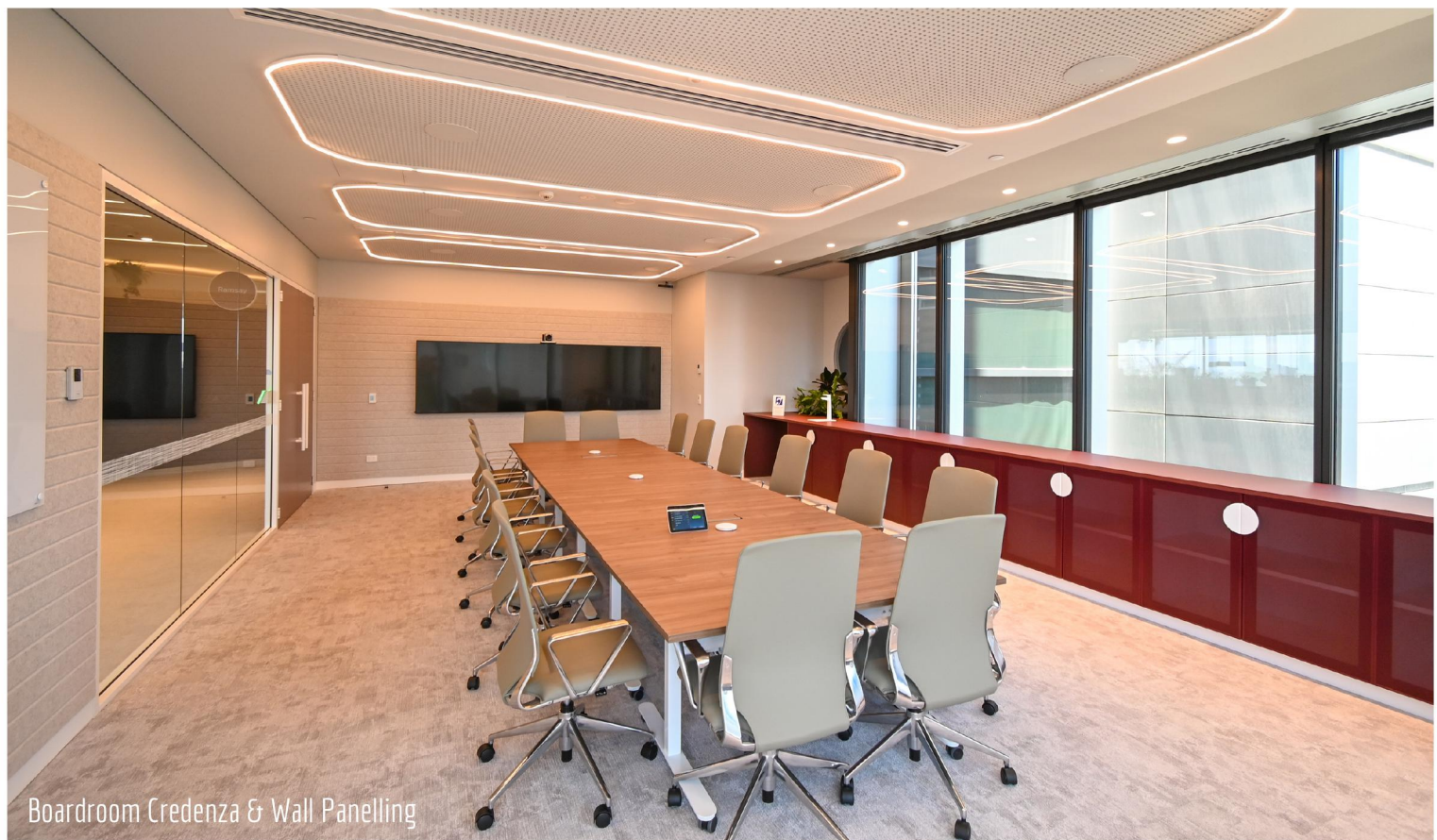
Boardroom Credenza & Wall Panelling