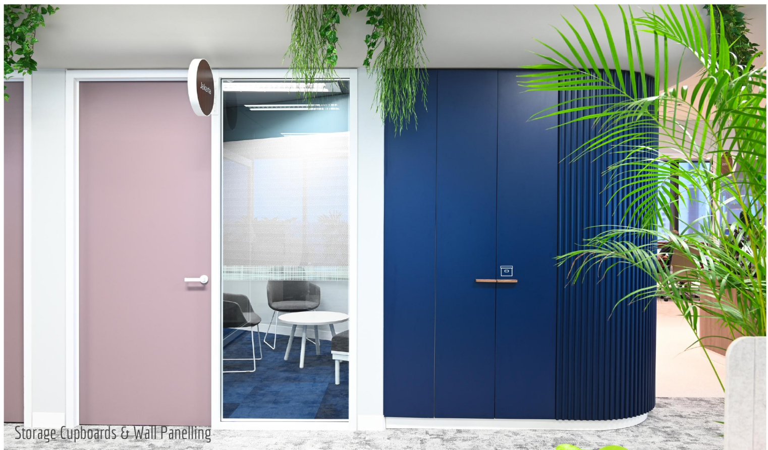
Storage Cupboards & Wall Panelling