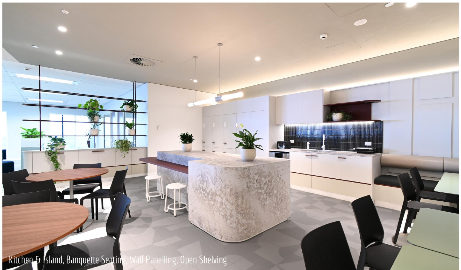
Kitchen & Island, Banquette Seating, Wall Panelling, Open Shelving