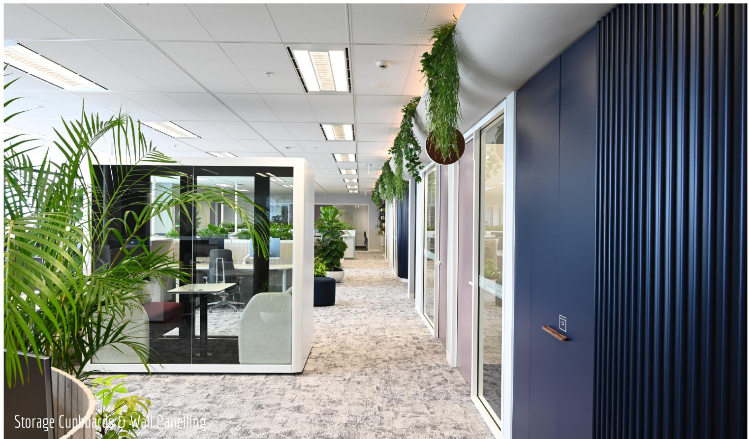
Storage Cupboards & Wall Panelling