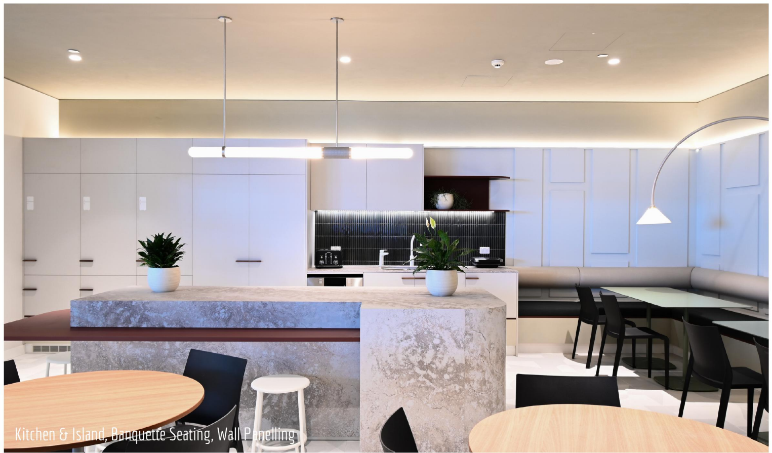
Kitchen & Island, Banquette Seating, Wall Panelling