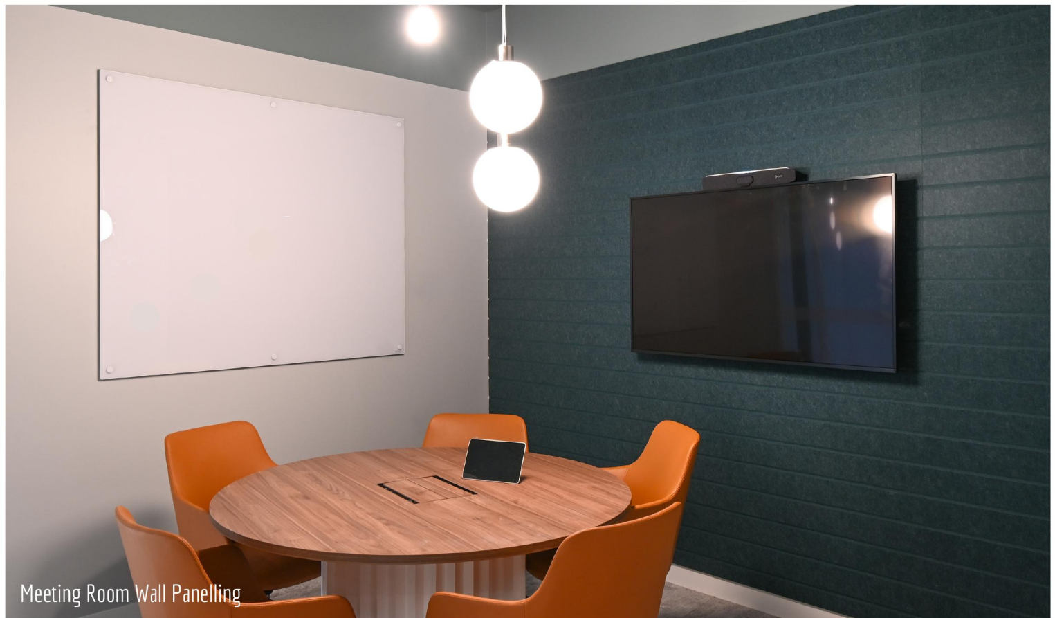
Meeting Room Wall Panelling