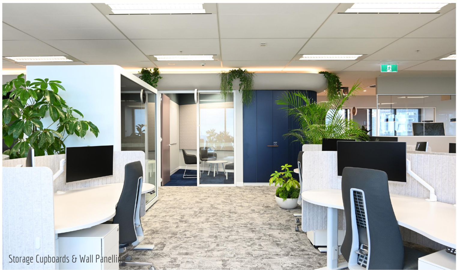
Storage Cupboards & Wall Panelling