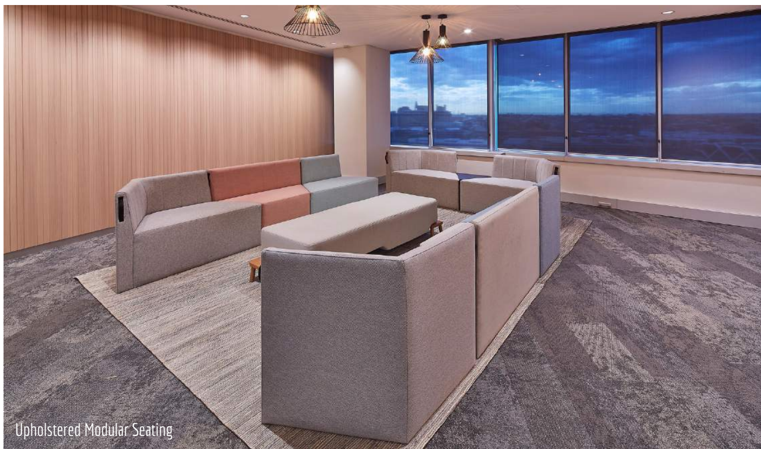
Upholstered Modular Seating