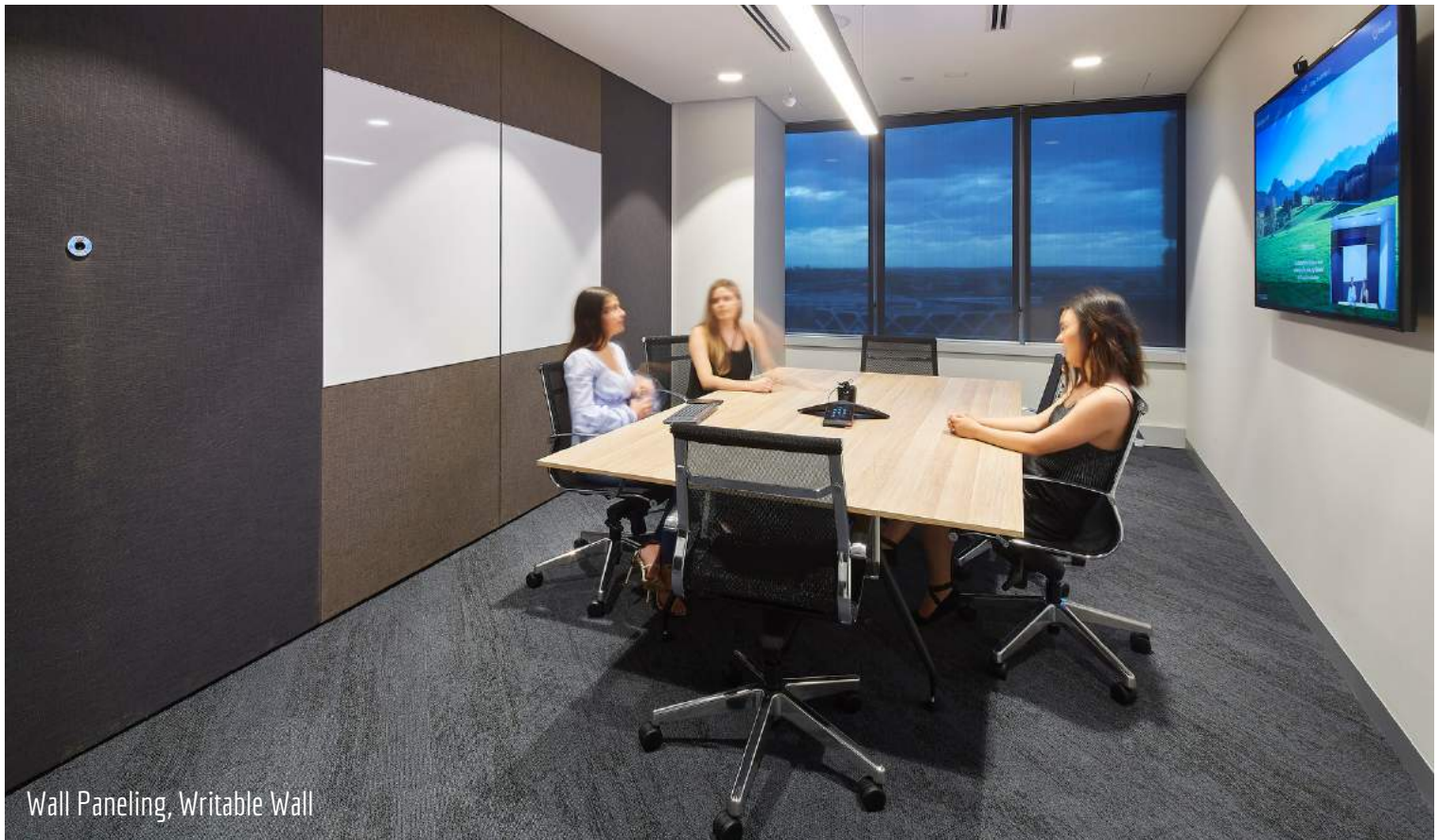
Wall Paneling, Writable Wall