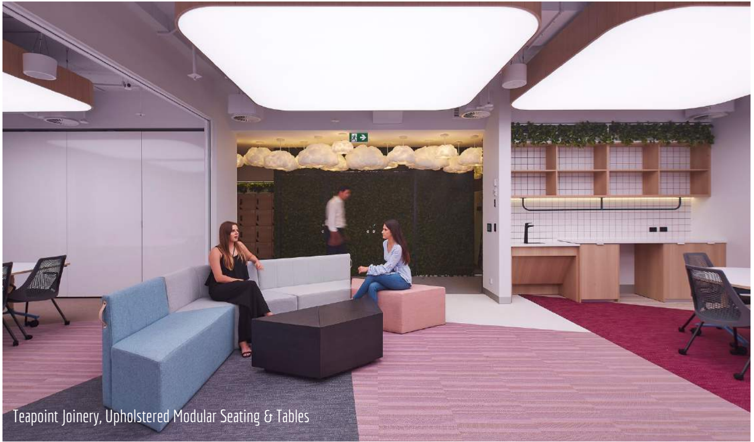
Teapoint Joinery, Upholstered Modular Seating & Tables