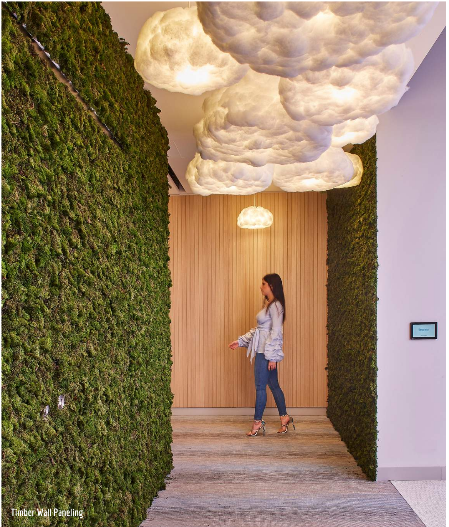
Timber Wall Paneling