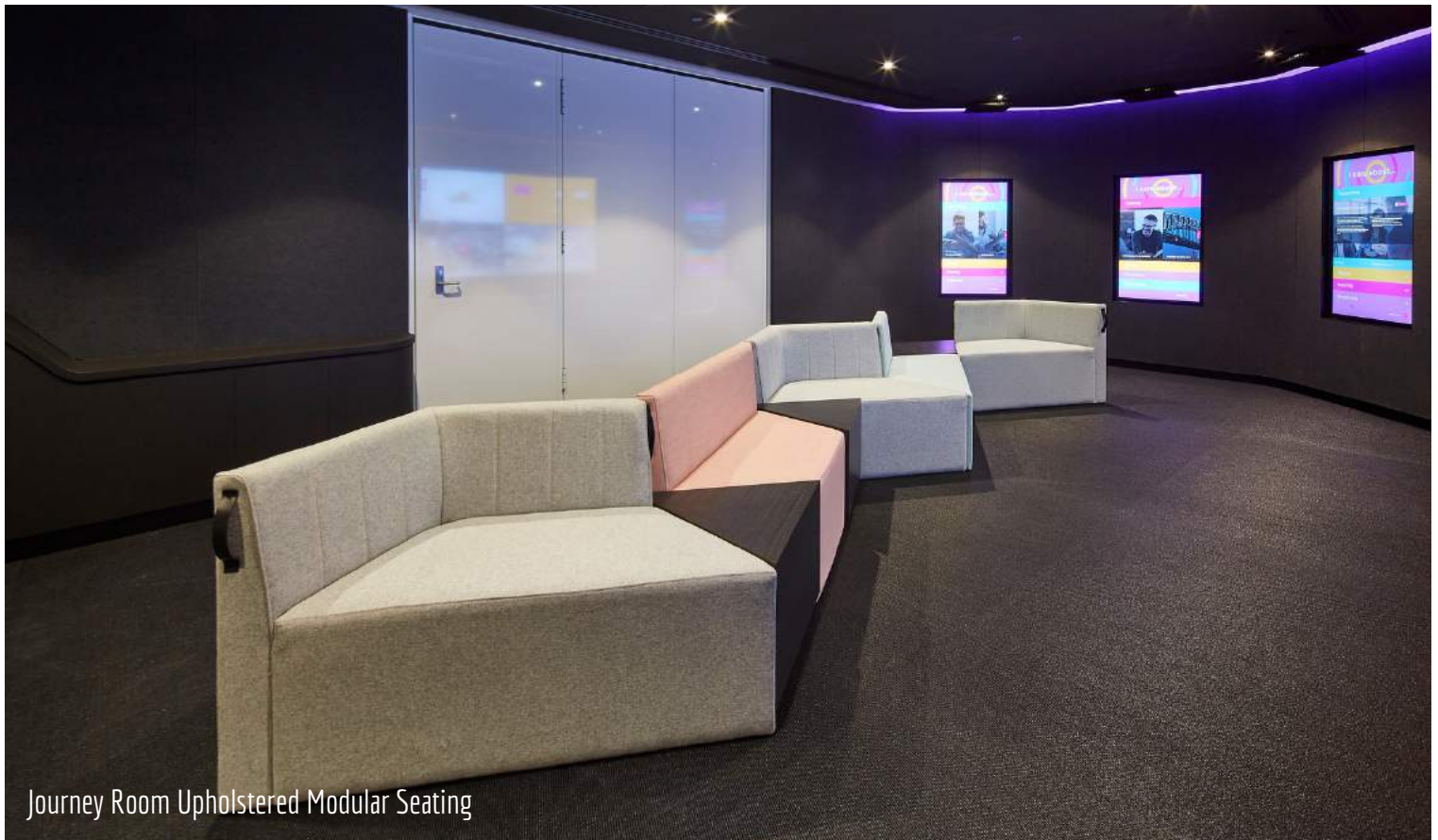
Journey Room Upholstered Modular Seating