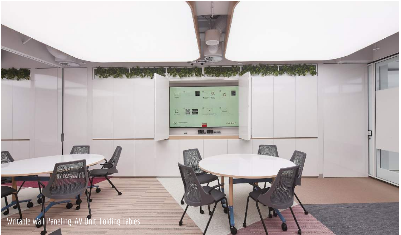
Writable Wall Paneling, AV Unit, Folding Tables