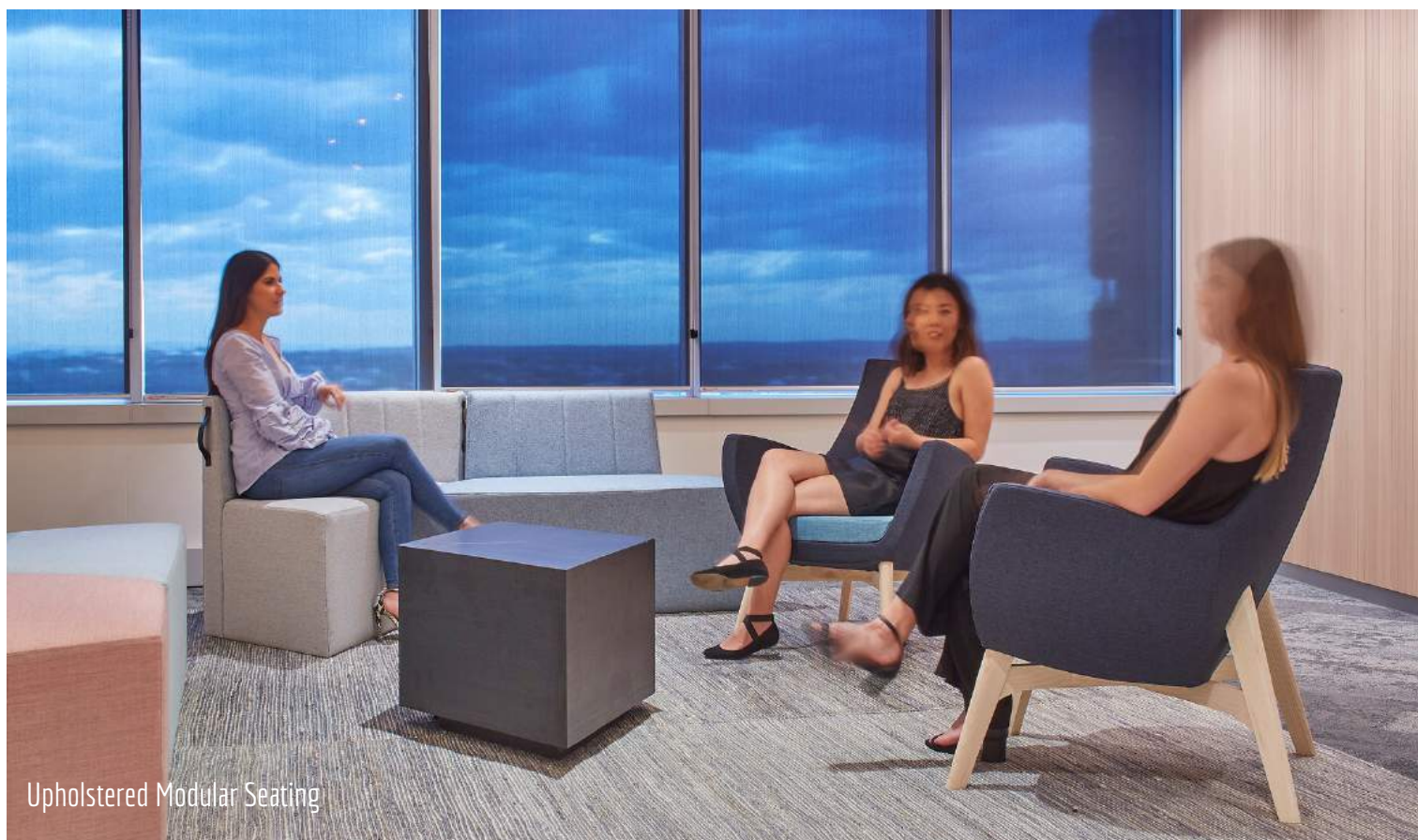
Upholstered Modular Seating