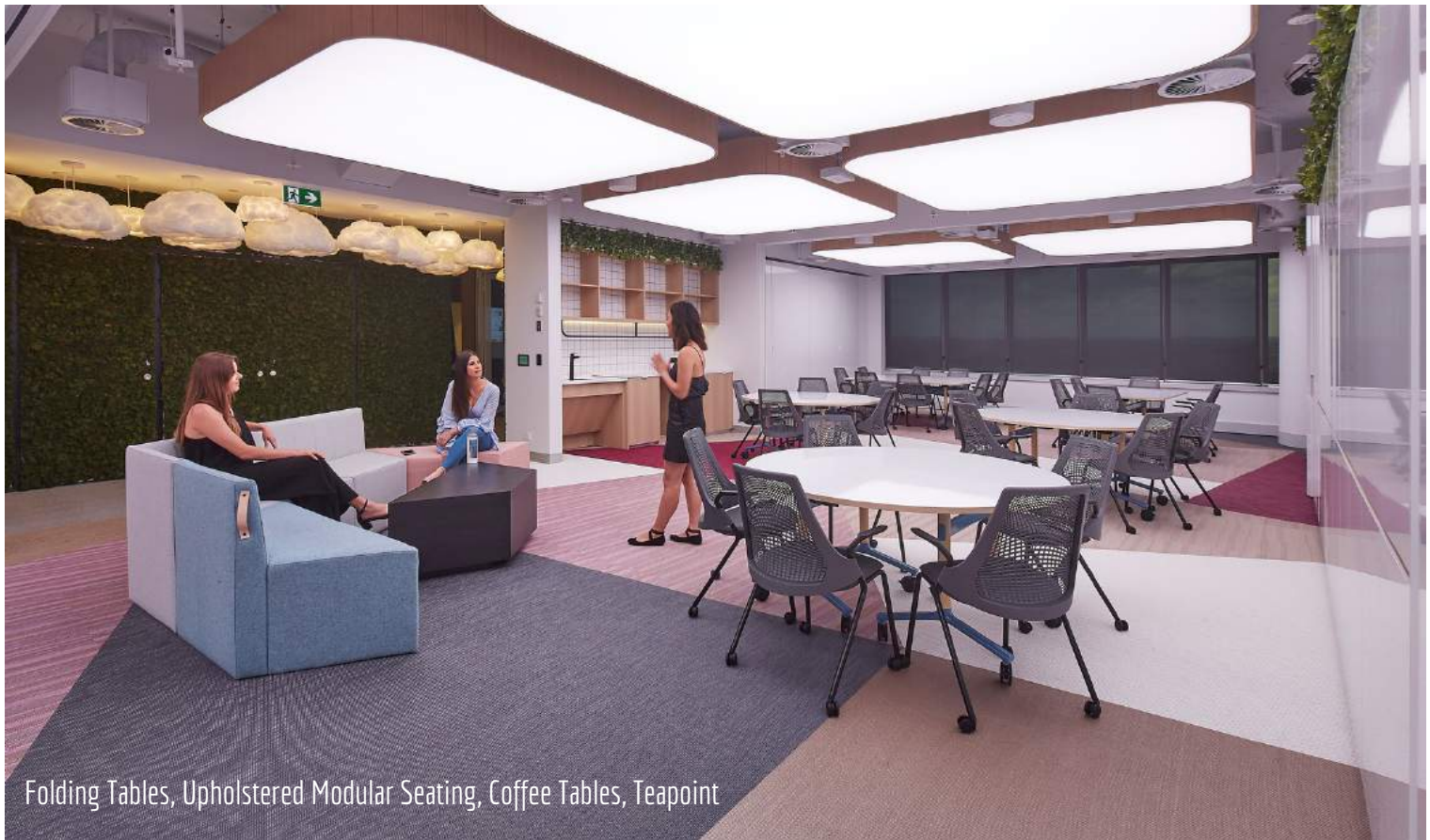
Folding Tables, Upholstered Modular Seating, Coffee Tables, Teapoint