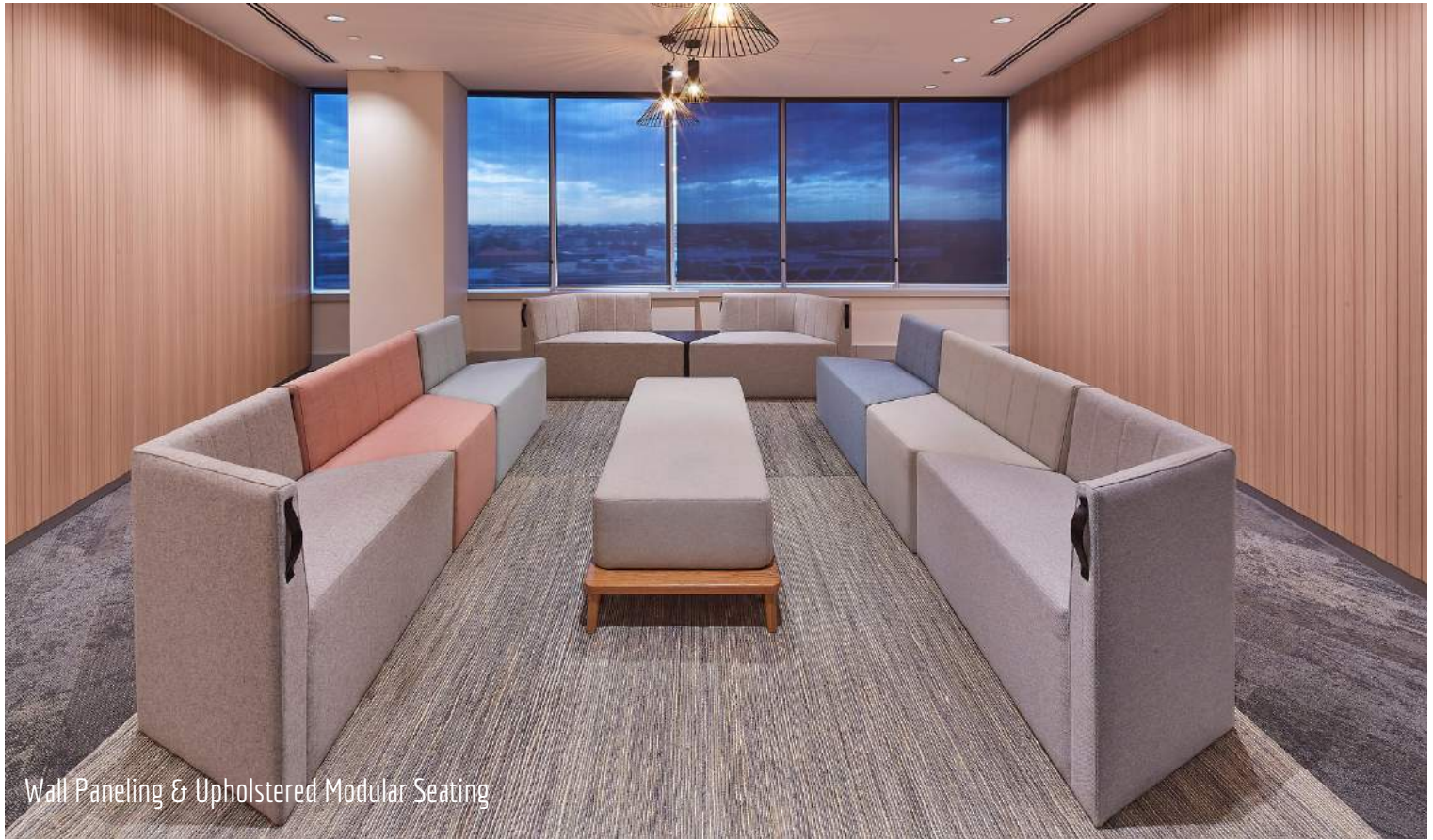
Wall Paneling & Upholstered Modular Seating