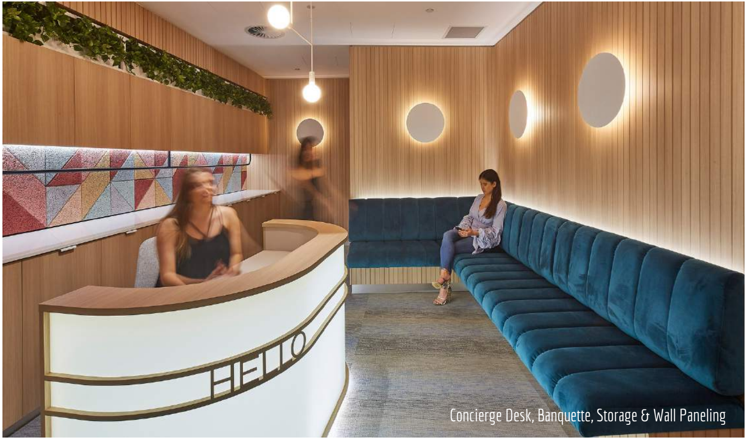
Concierge Desk, Banquette, Storage & Wall Paneling