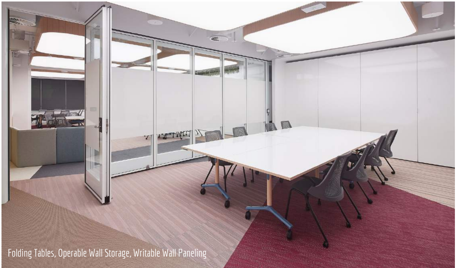
Folding Tables, Operable Wall Storage, Writable Wall Paneling