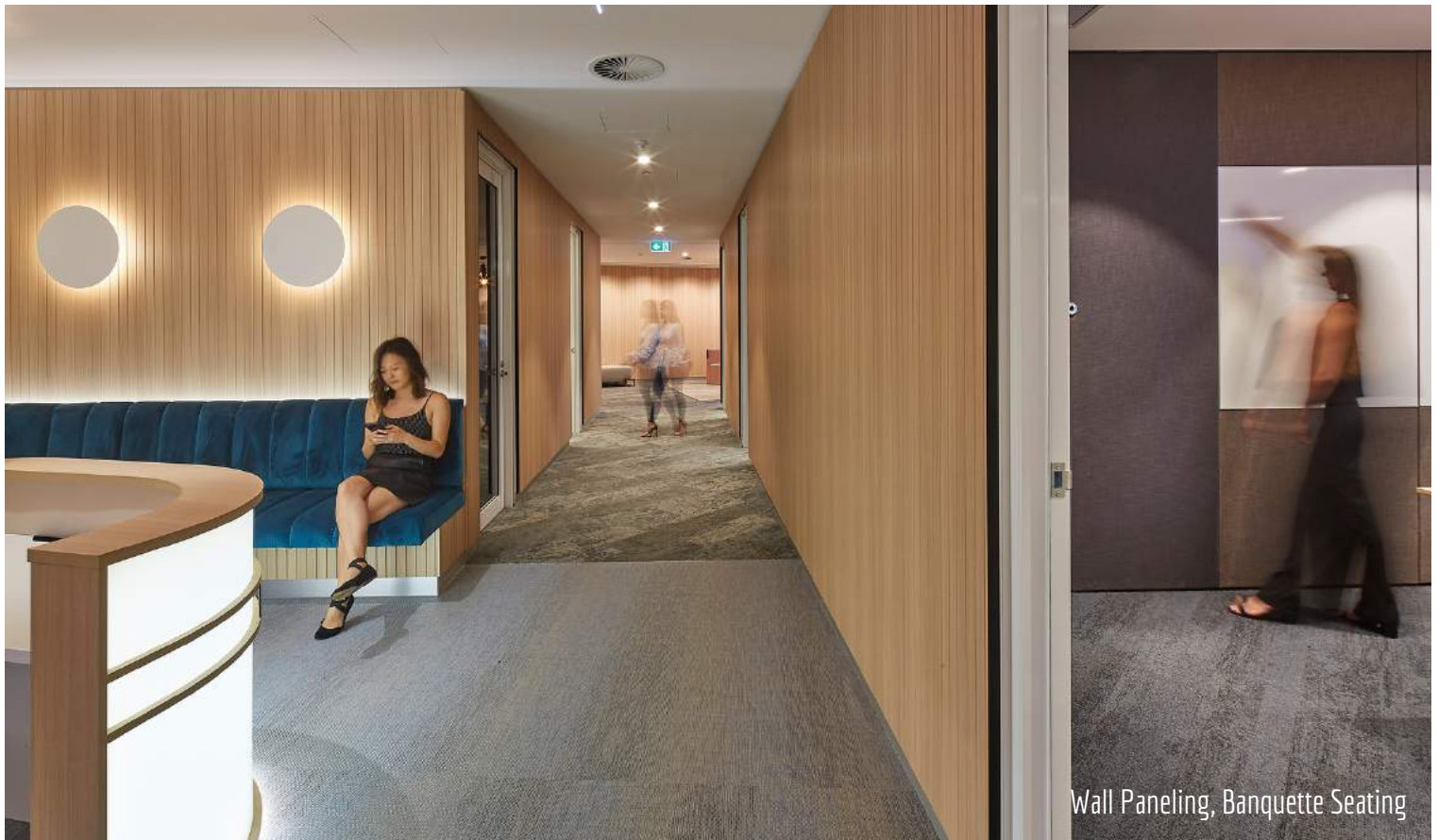
Wall Paneling, Banquette Seating