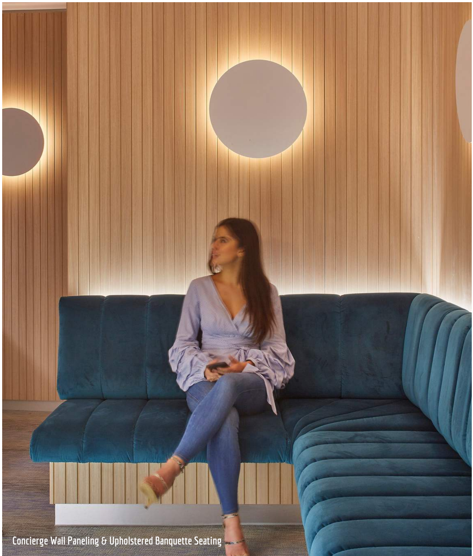
Concierge Wall Paneling & Upholstered Banquette Seating