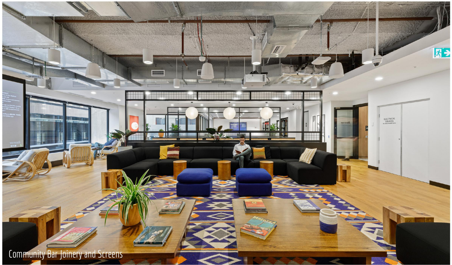
Community Bar Joinery and Screens