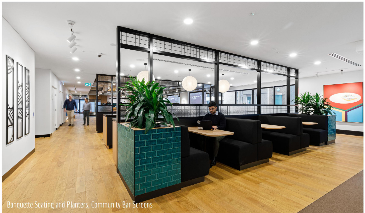
Banquette Seating and Planters, Community Bar Screens