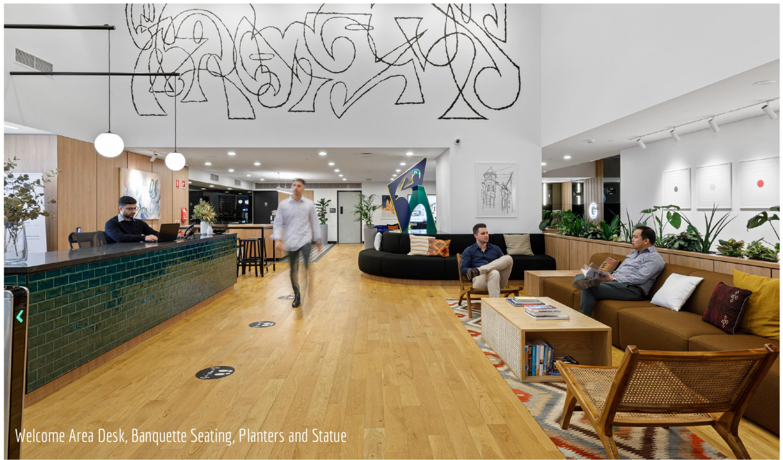
Welcome Area Desk, Banquette Seating, Planters and Statue