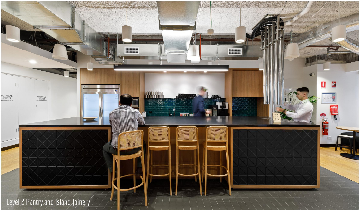
Level 2 Pantry and Island Joinery