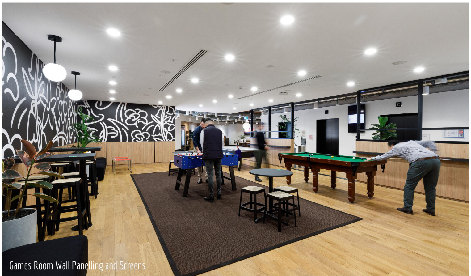
Games Room Wall Panelling and Screens