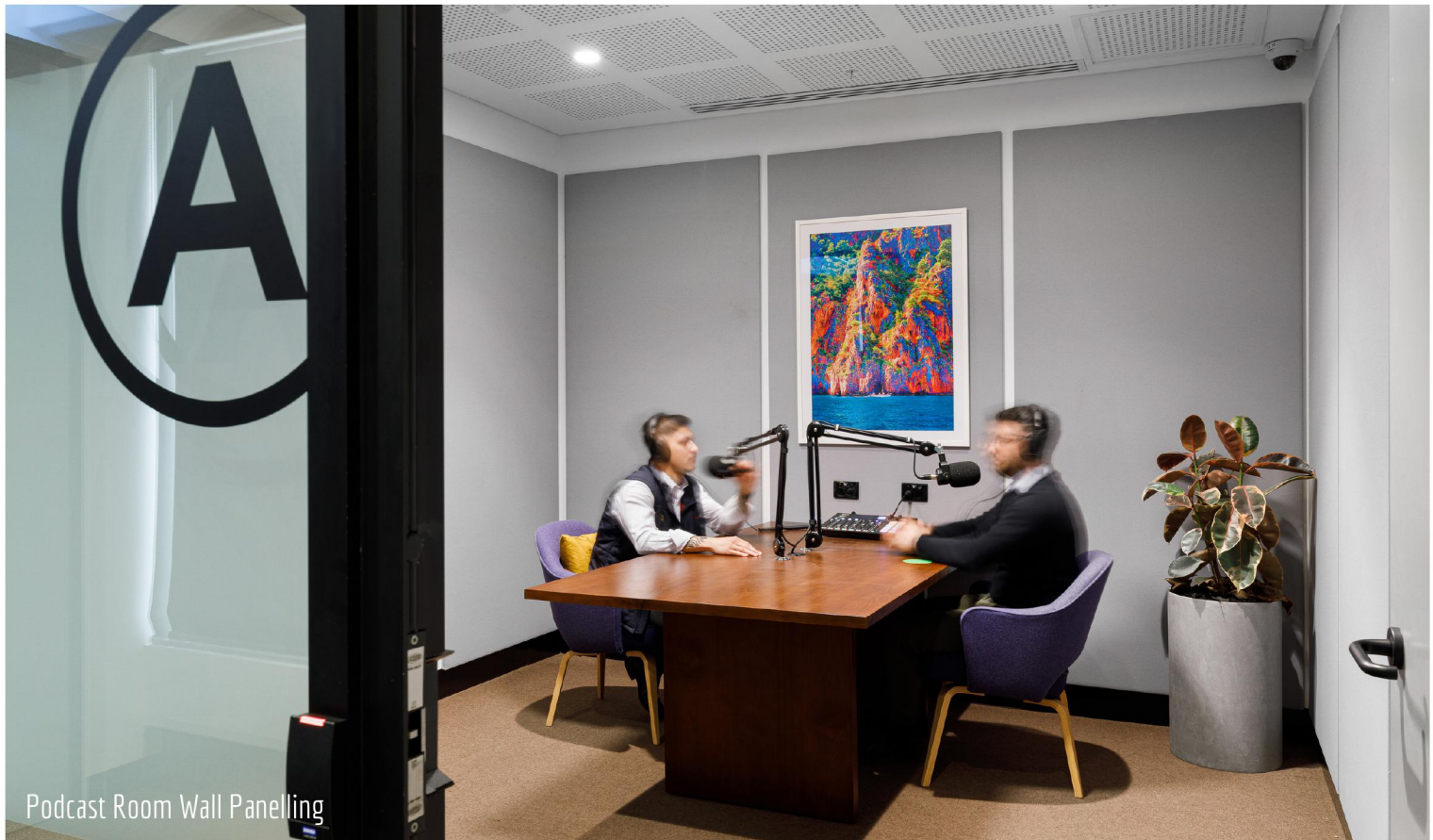
Podcast Room Wall Panelling