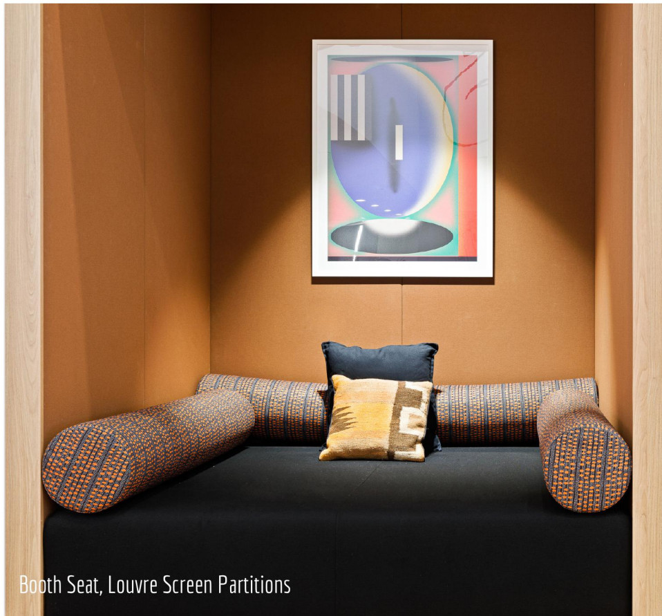
Booth Seat, Louvre Screen Partitions