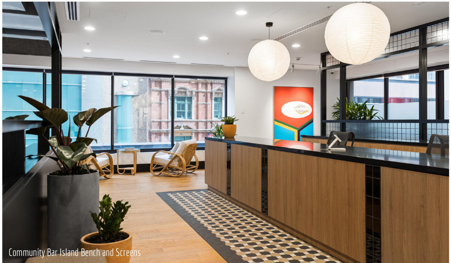
Community Bar Island Bench and Screens