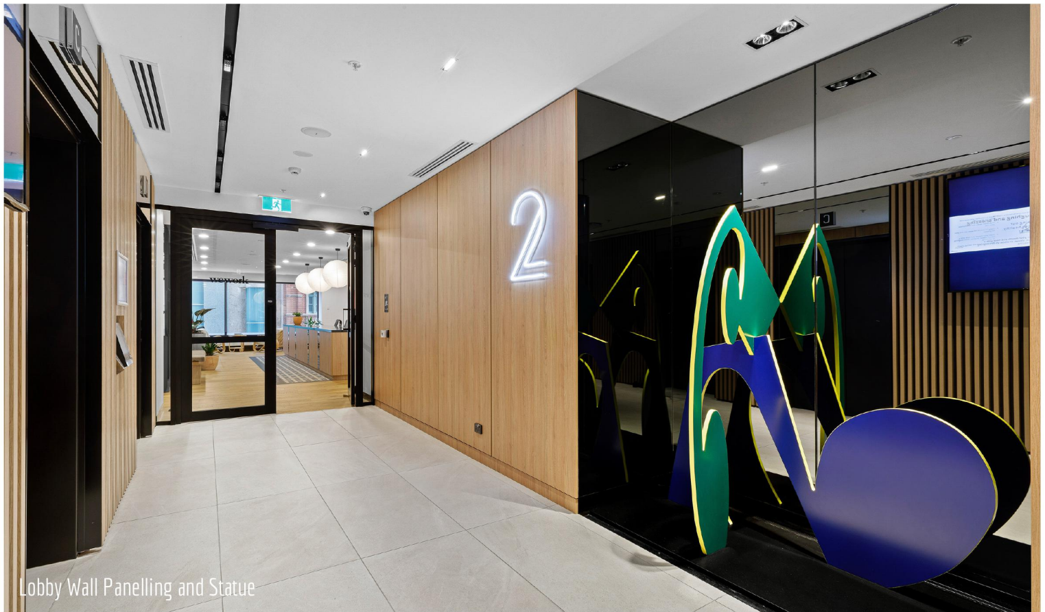
Lobby Wall Panelling and Statue