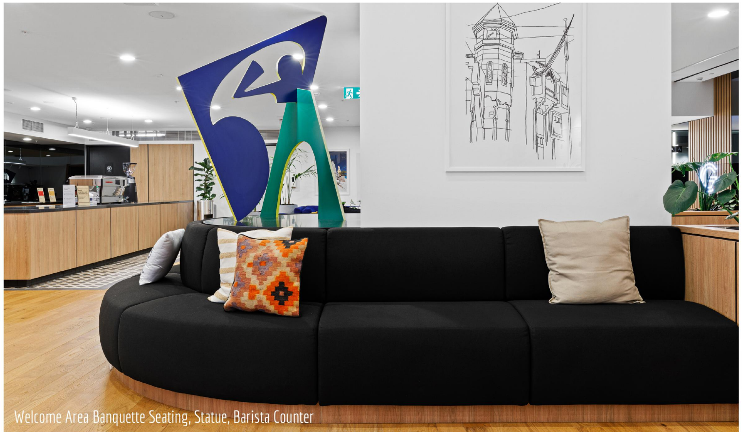
Welcome Area Banquette Seating, Statue, Barista Counter