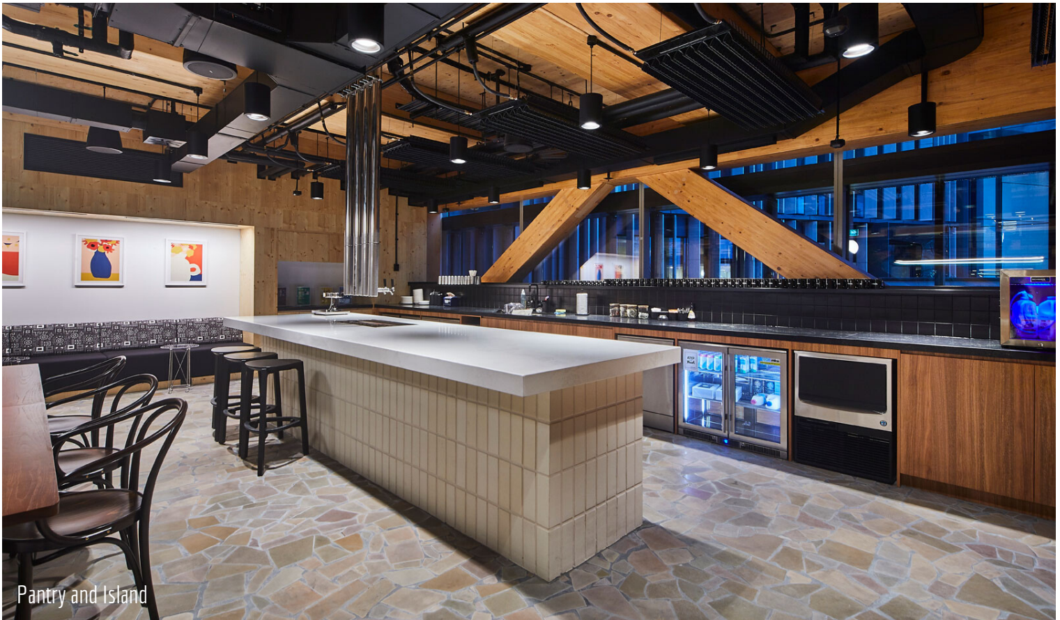
Pantry and Island