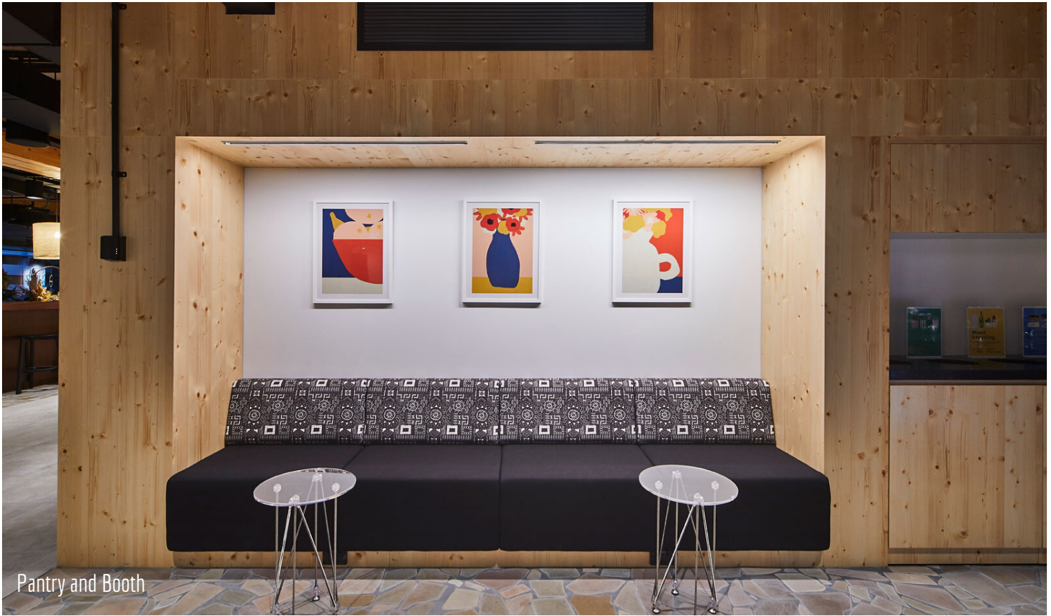
Pantry and Booth