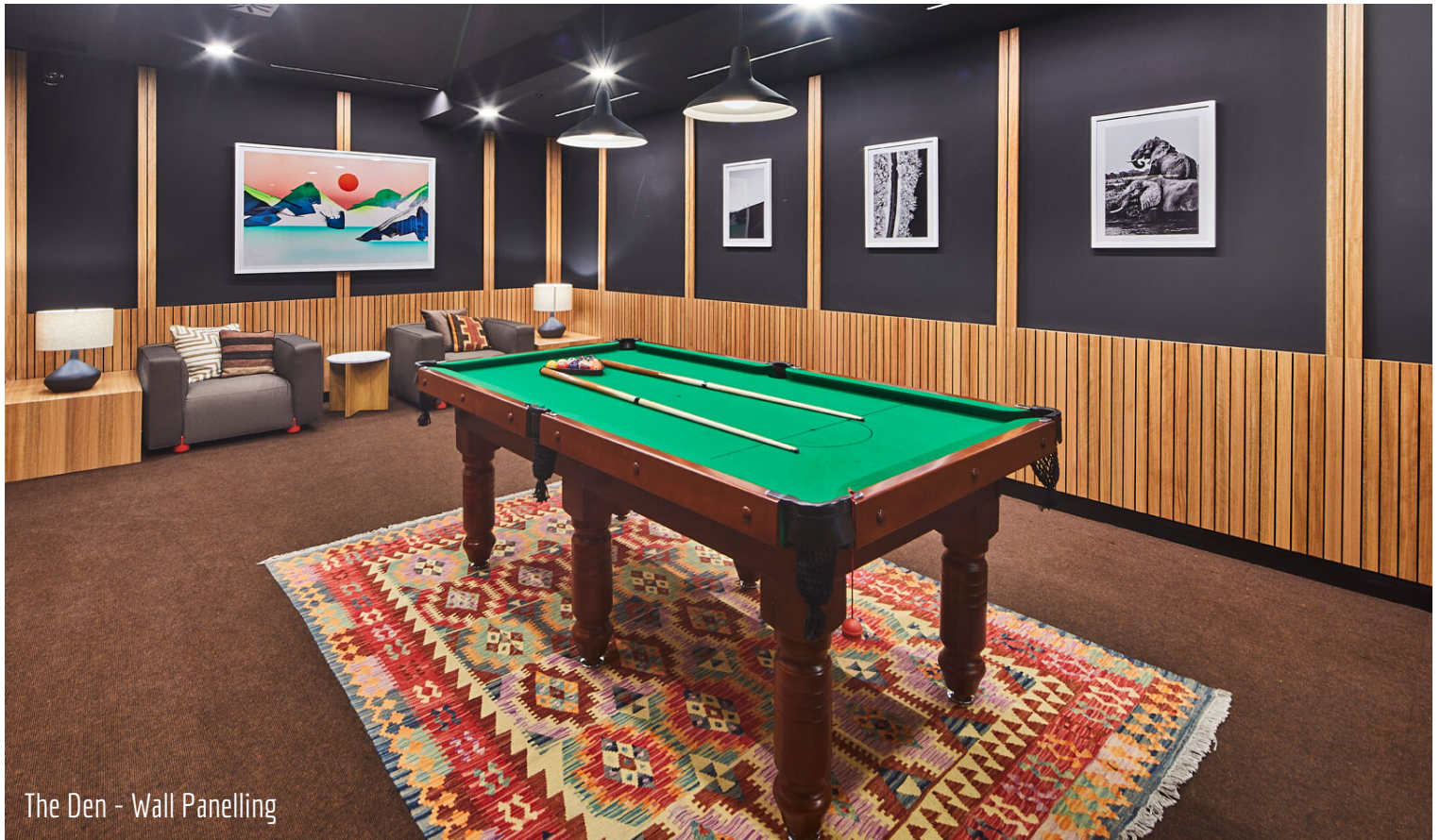
The Den - Wall Panelling