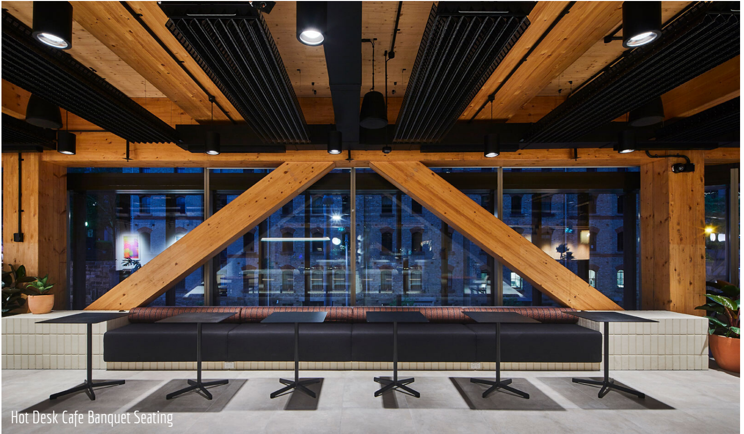
Hot Desk Cafe Banquet Seating