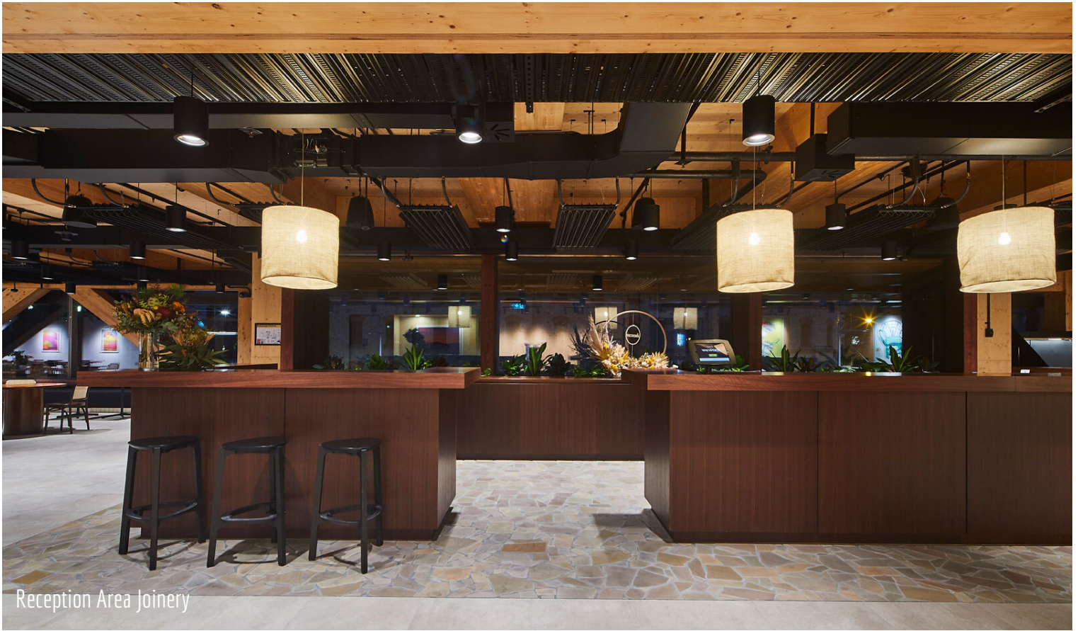
Reception Area Joinery