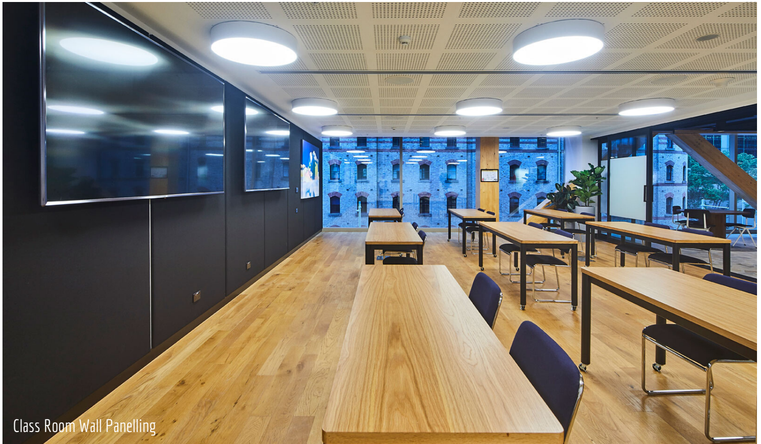
Class Room Wall Panelling