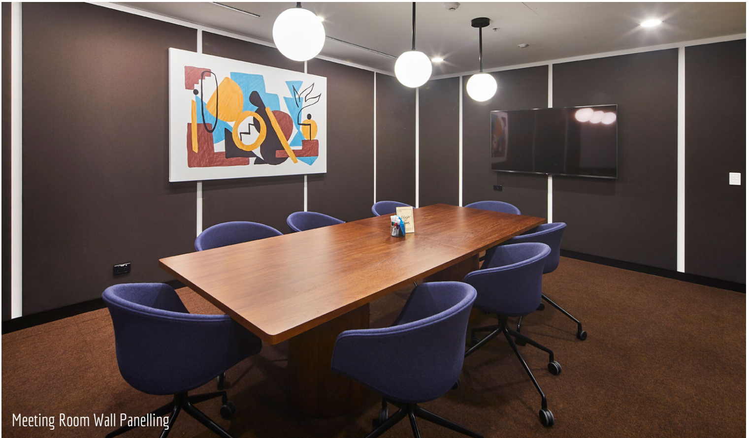
Meeting Room Wall Panelling