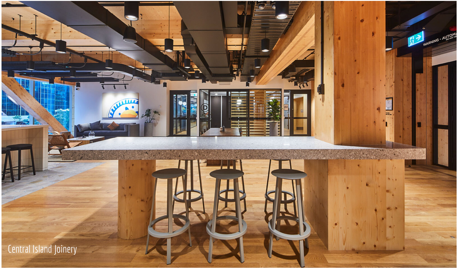
Central Island Joinery