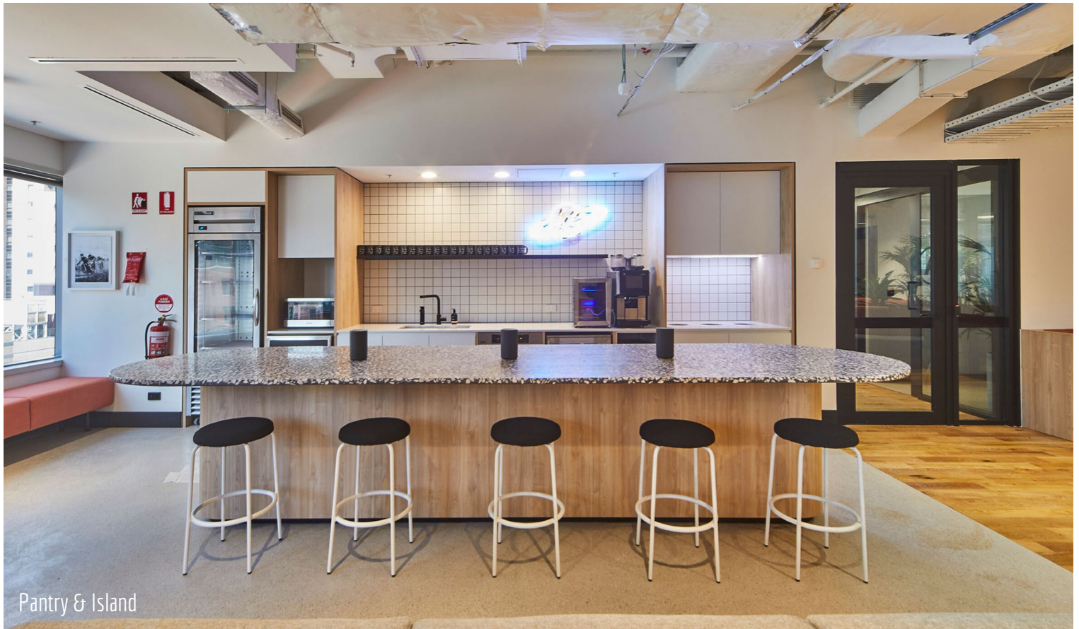
Pantry & Island