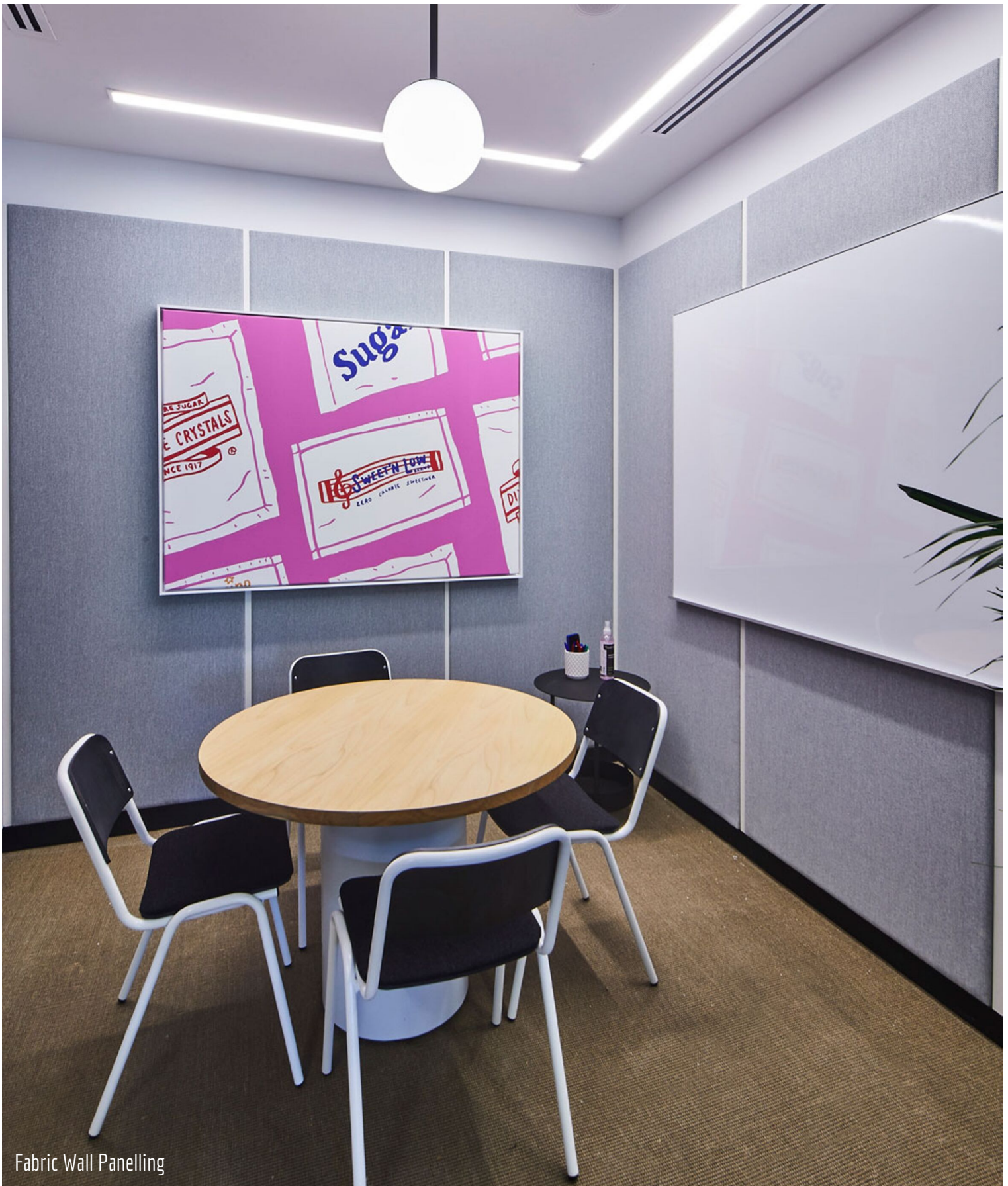
Fabric Wall Panelling