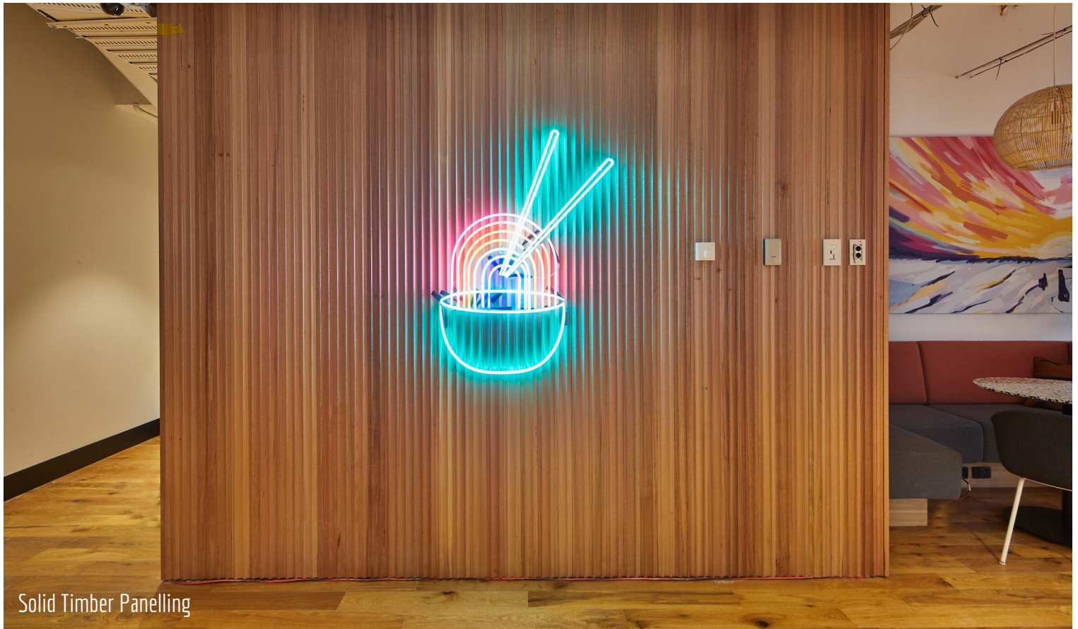
Solid Timber Panelling