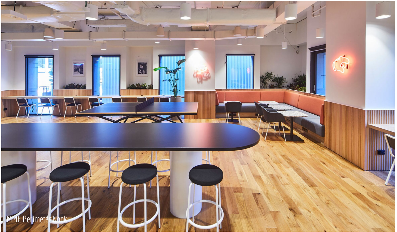
MMF Perimeter Nook