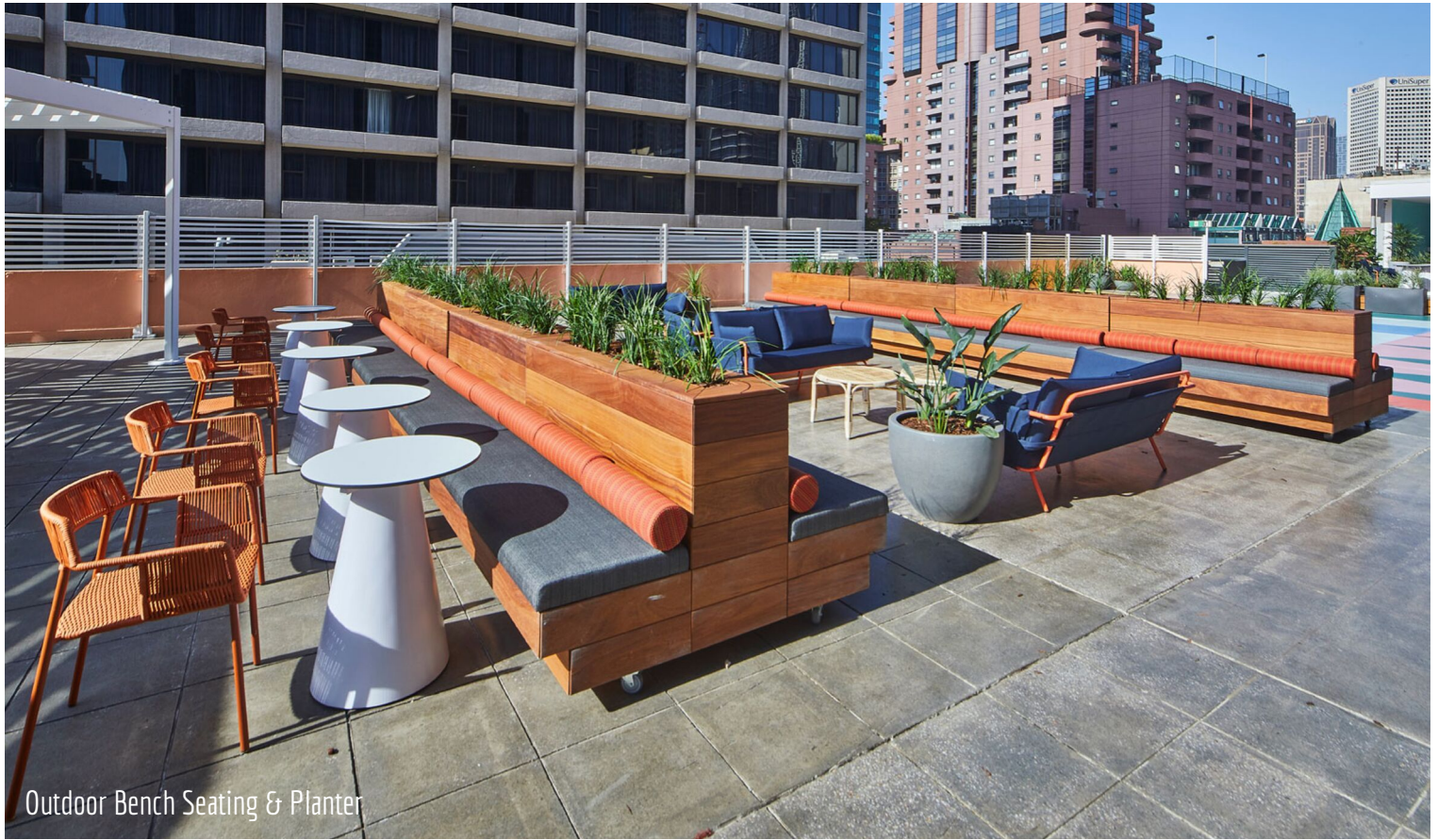
Outdoor Bench Seating & Planter