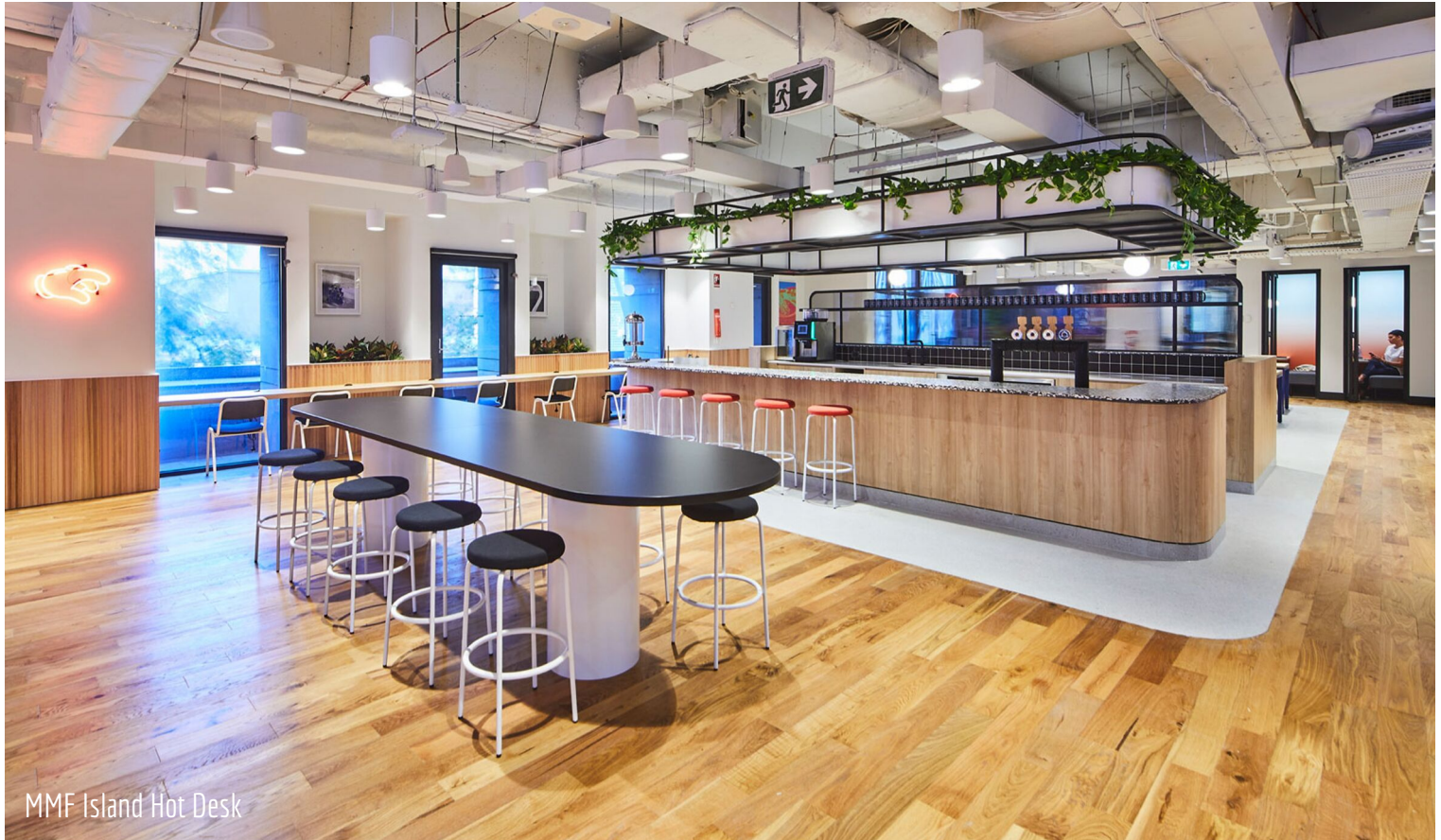
MMF Island Hot Desk