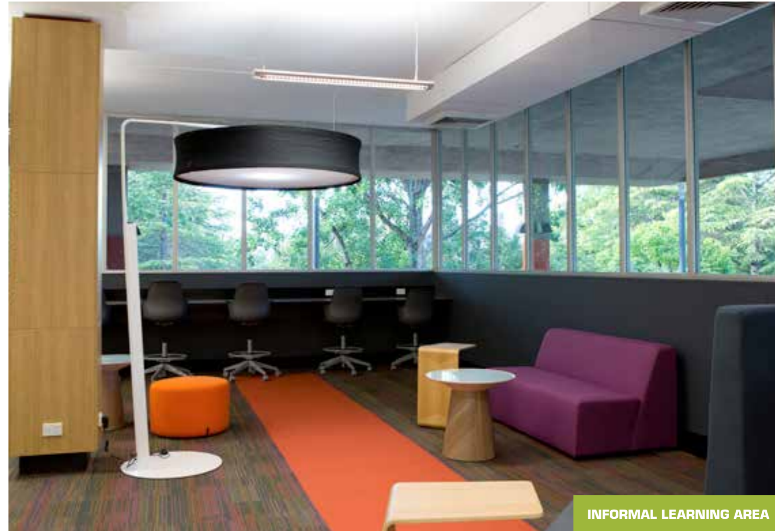
INFORMAL LEARNING AREA