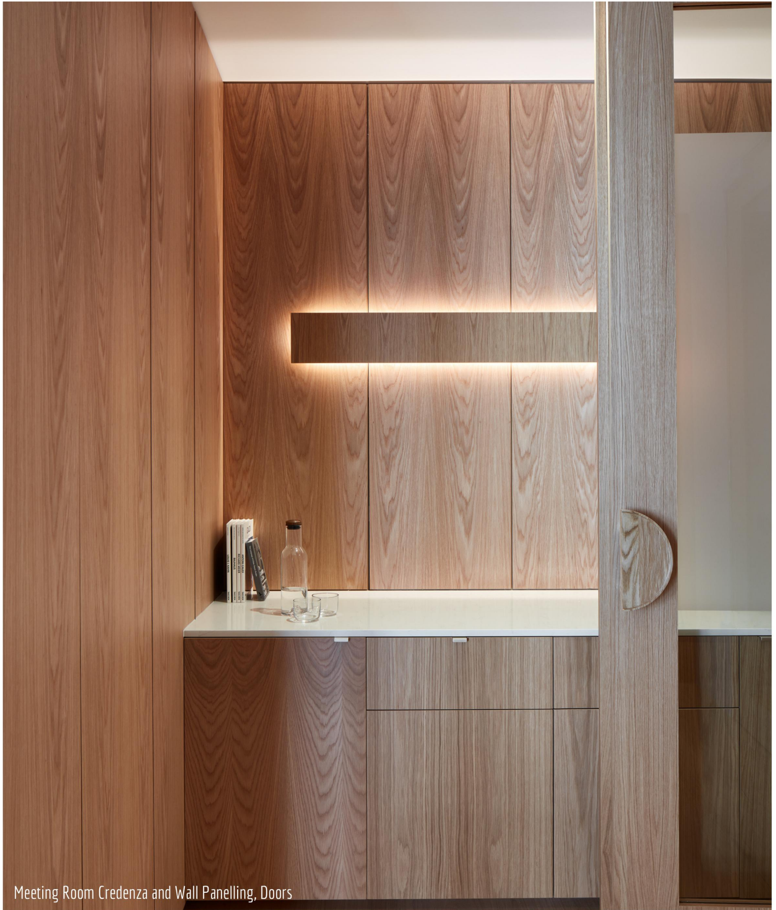
Meeting Room Credenza and Wall Panelling, Doors