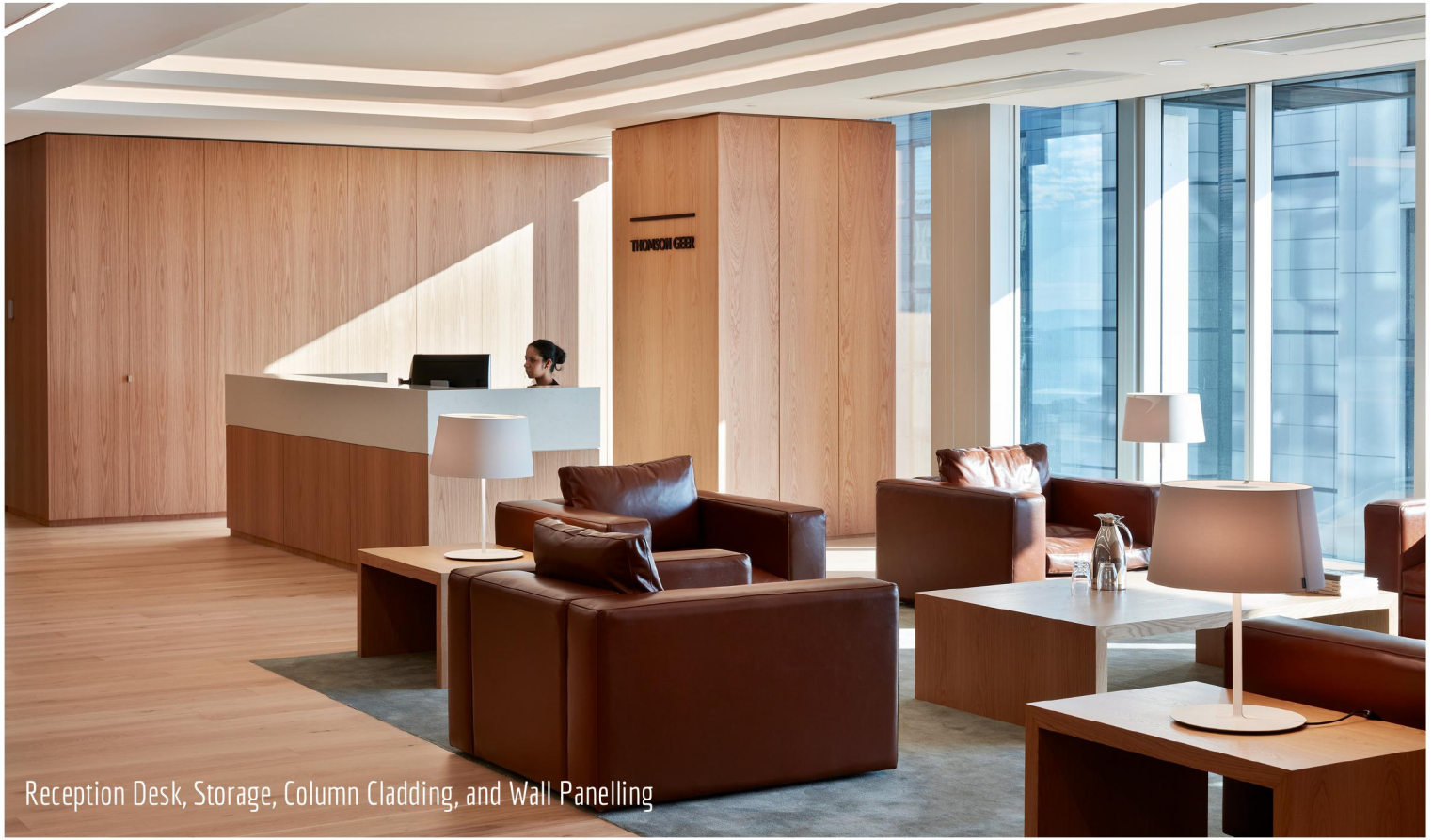
Reception Desk, Storage, Column Cladding, and Wall Panelling