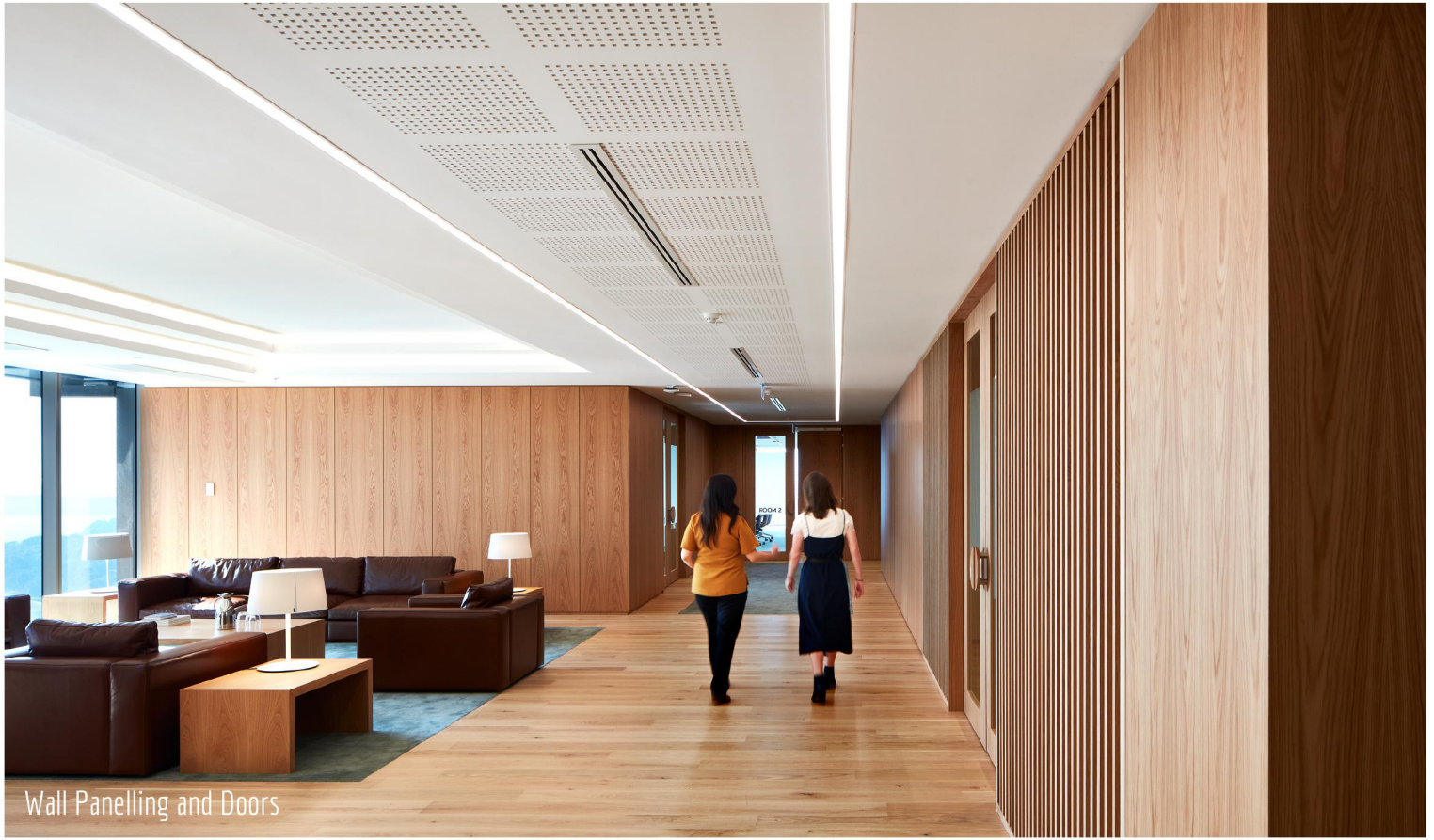
Wall Panelling and Doors