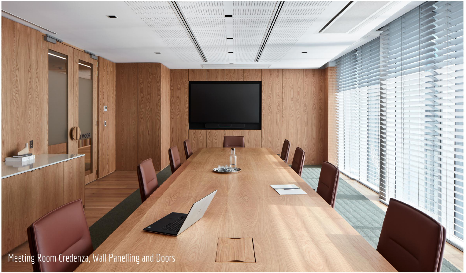
Meeting Room Credenza, Wall Panelling and Doors