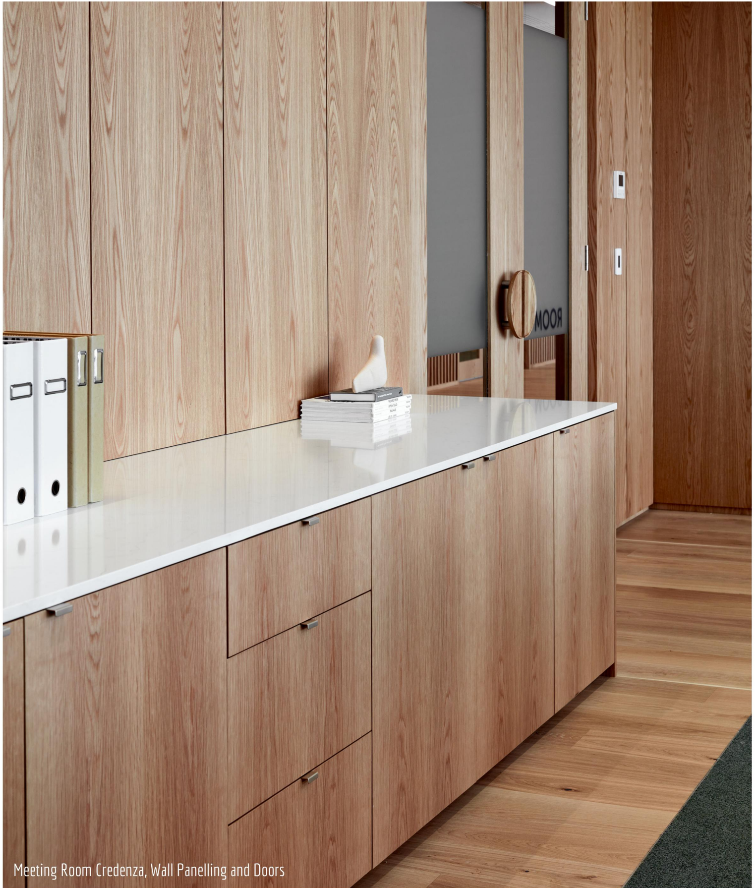
Meeting Room Credenza, Wall Panelling and Doors