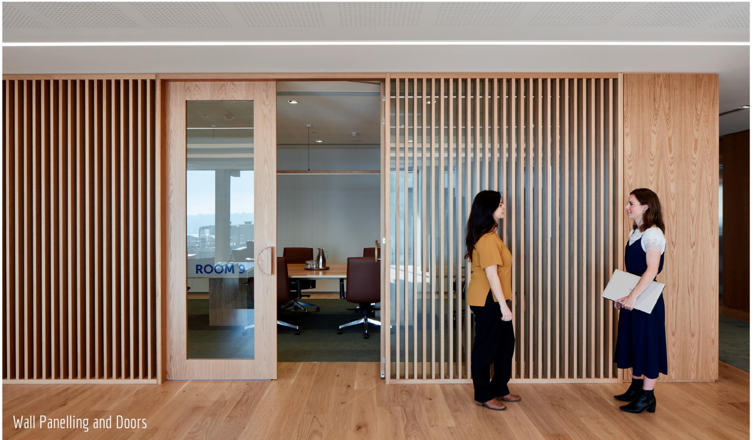
Wall Panelling and Doors