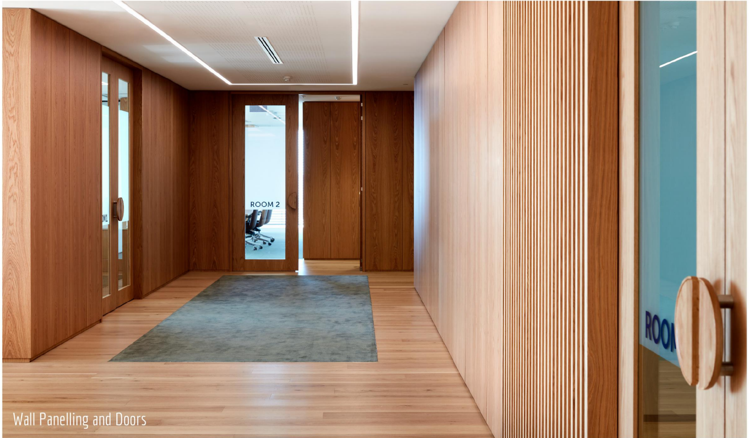
Wall Panelling and Doors