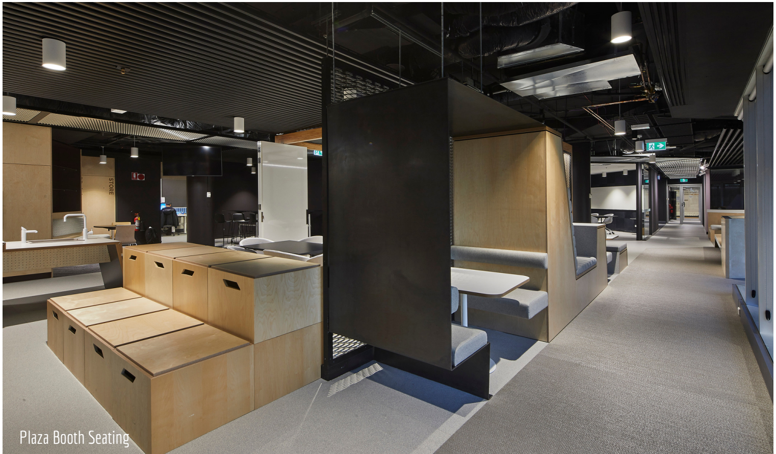
Plaza Booth Seating