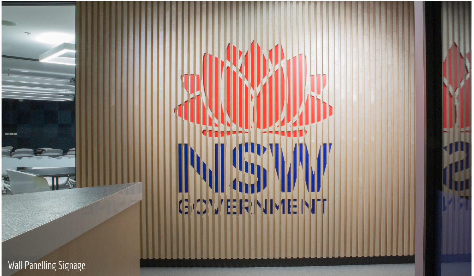
Wall Panelling Signage