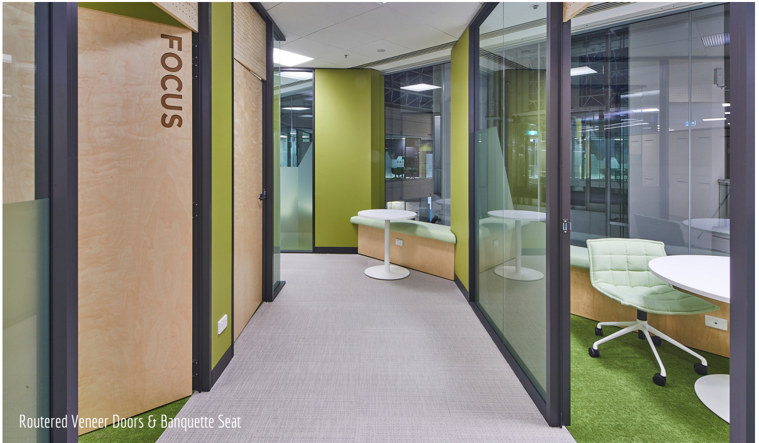
Routed Veneer Doors & Banquette Seat