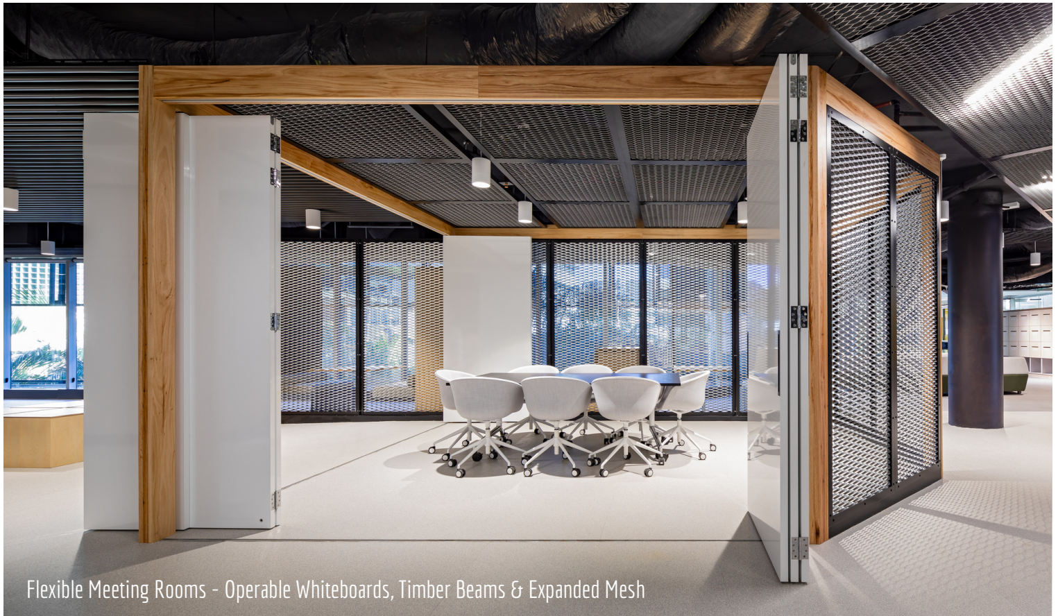
Flexible Meeting Rooms - Operable Whiteboards, Timber Beams & Expanded Mesh