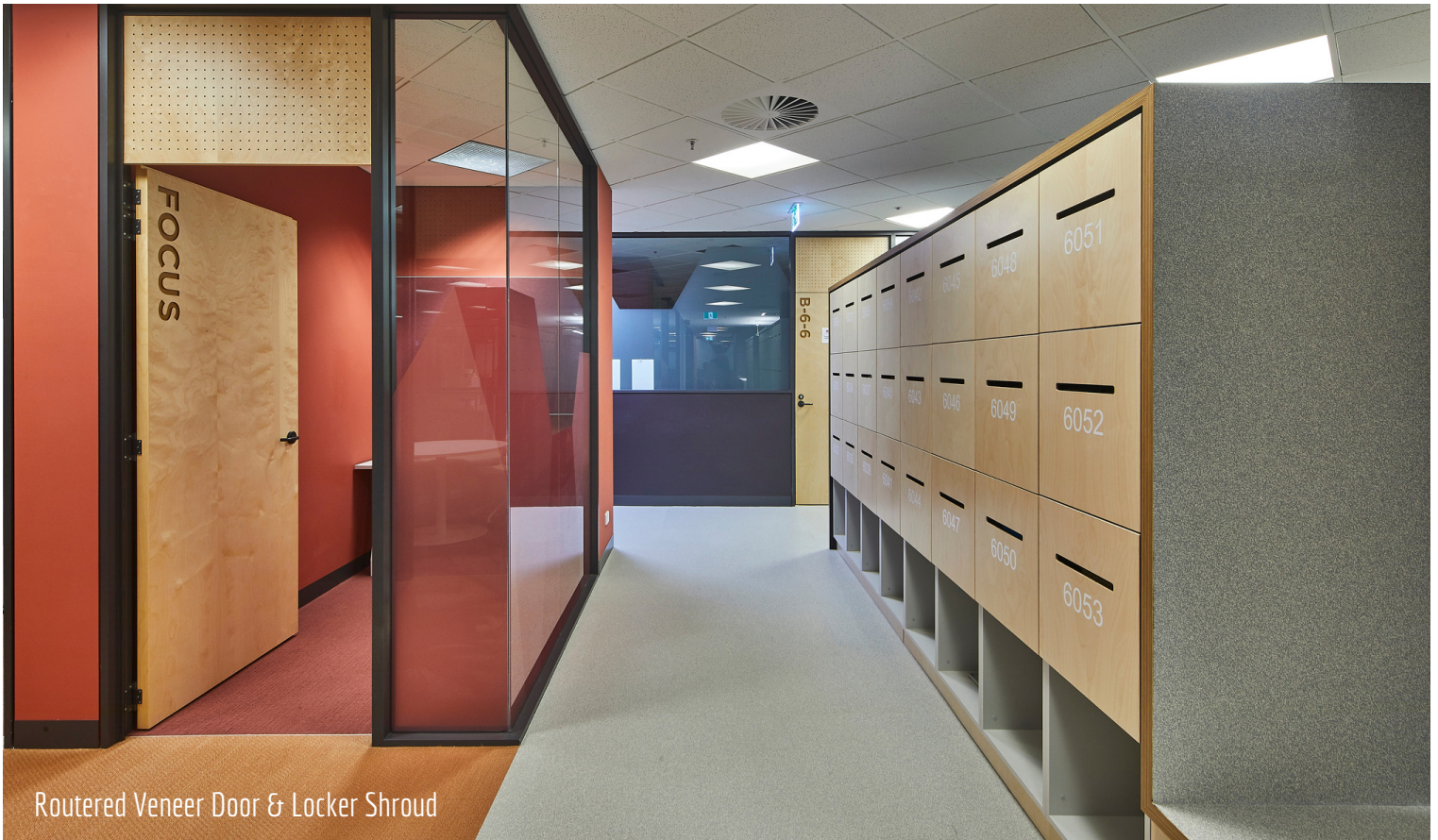
Routed Veneer Door & Locker Shroud