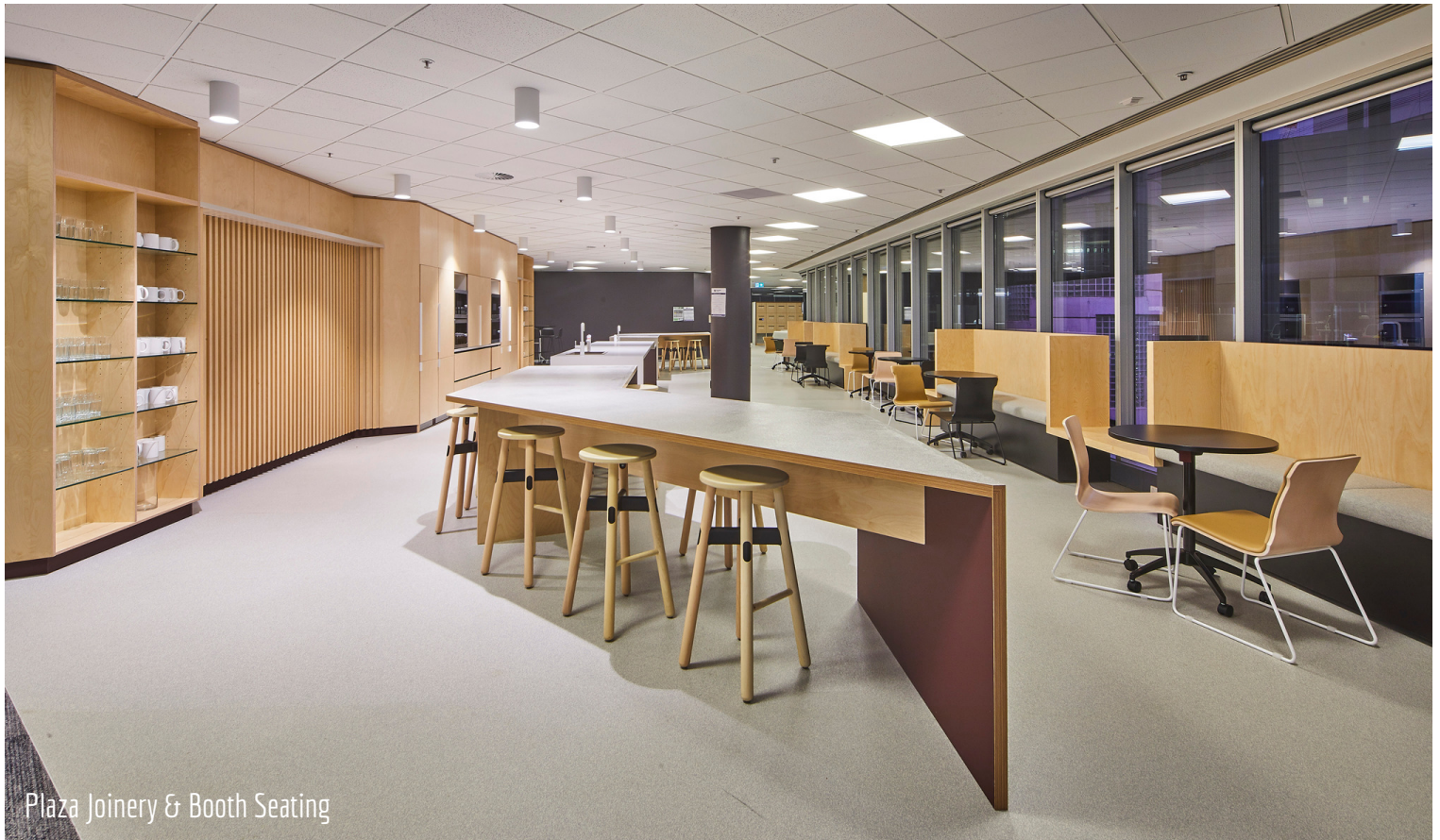
Plaza Joinery & Booth Seating