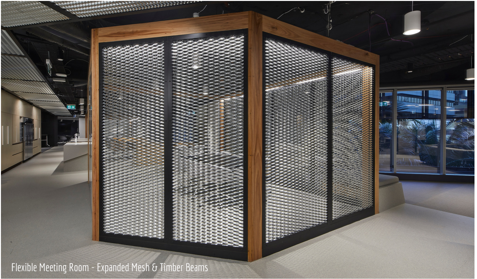
Flexible Meeting Room - Expanded Mesh & Timber Beams