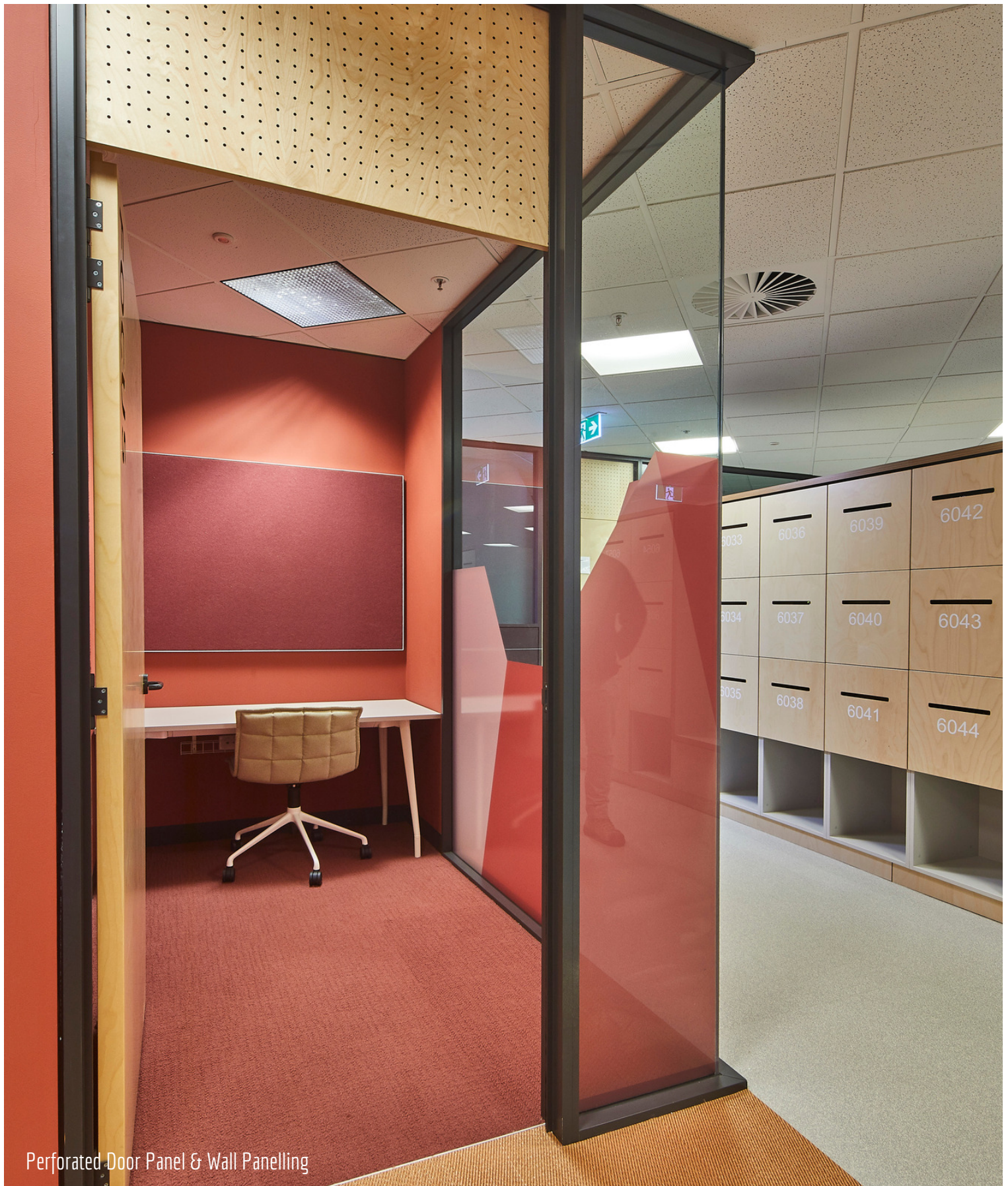
Perforated Door Panel & Wall Panelling