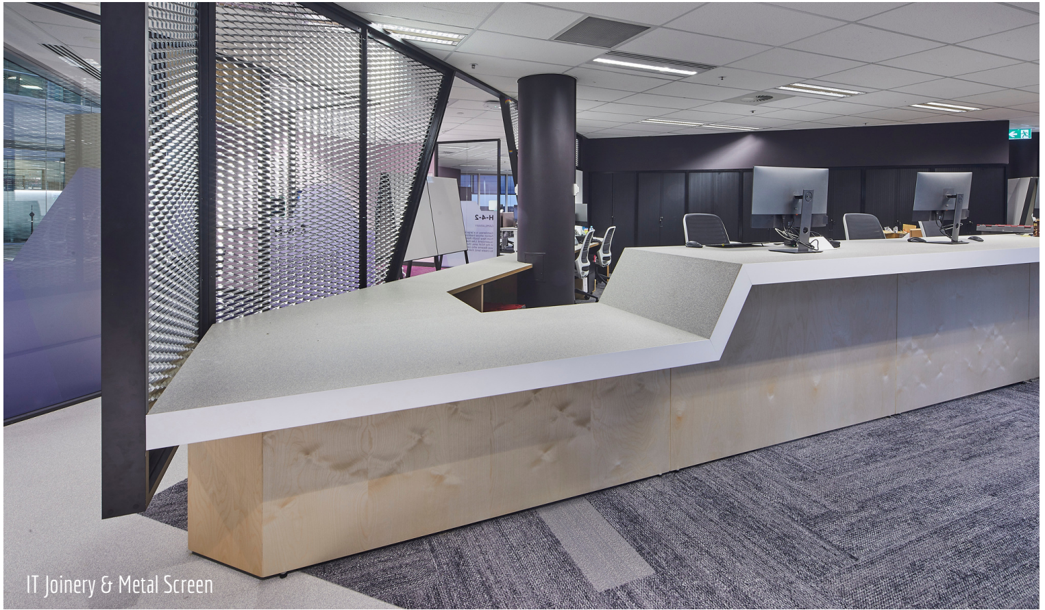
IT Joinery & Metal Screen