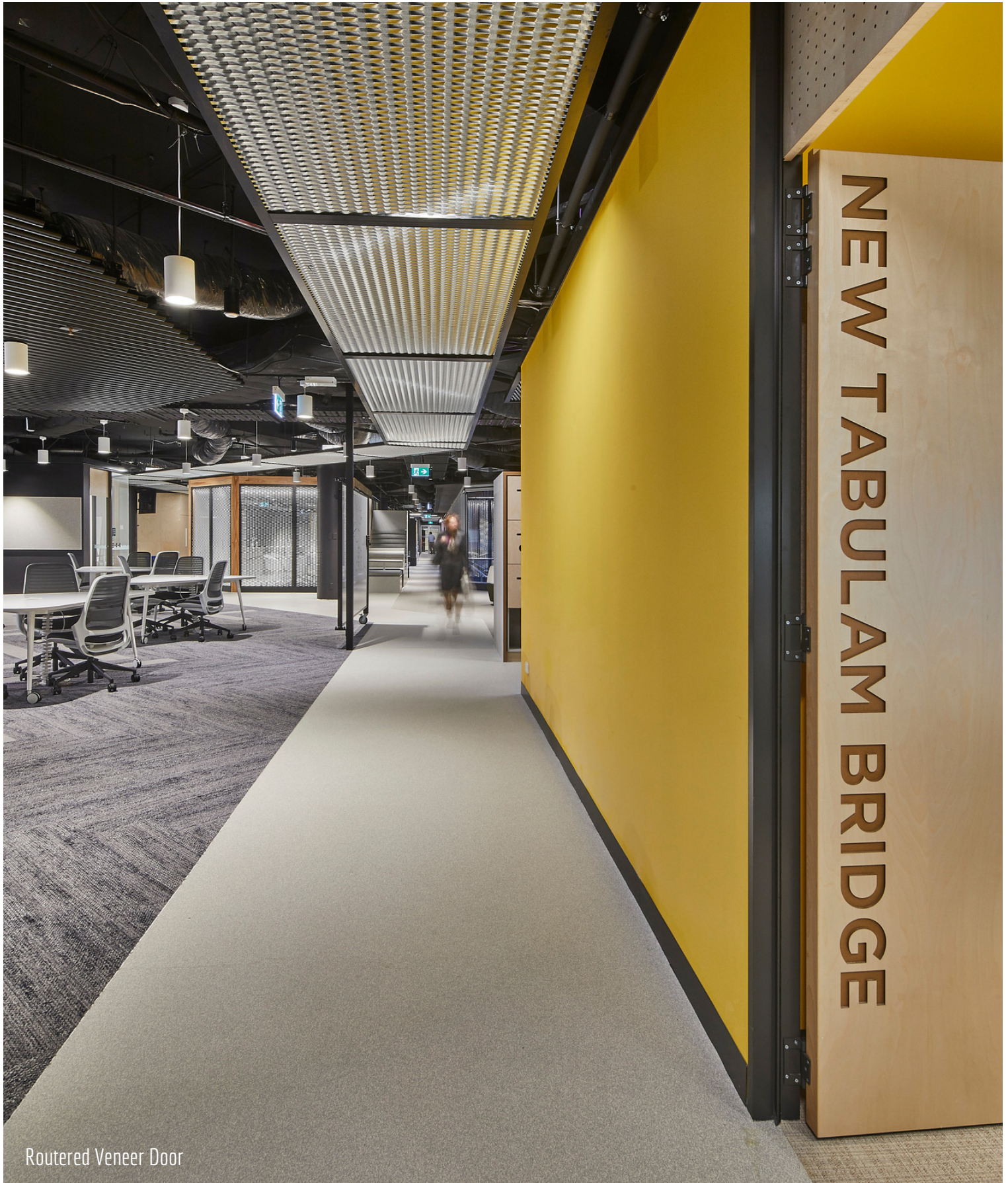
Routed Veneer Door