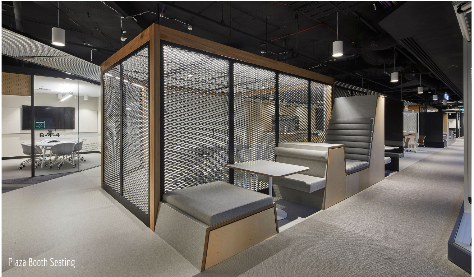
Plaza Booth Seating