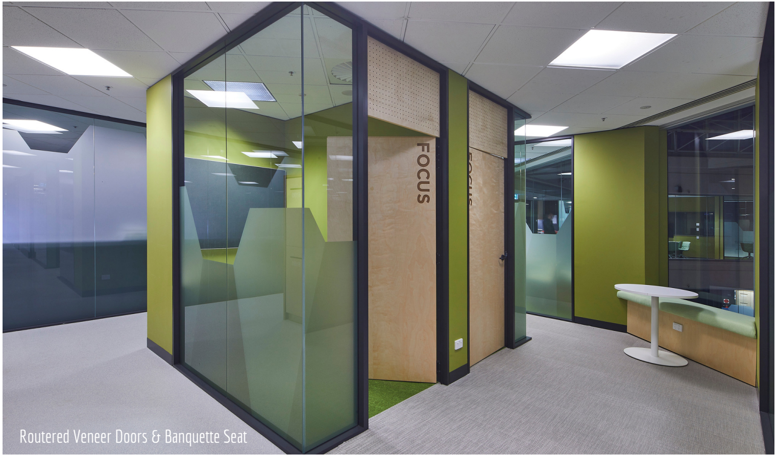
Routed Veneer Doors & Banquette Seat