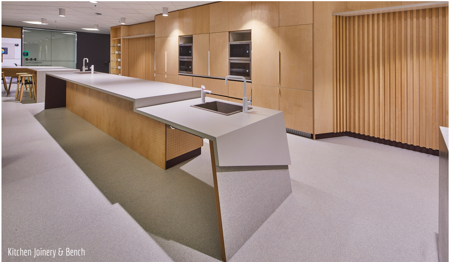
Kitchen Joinery & Bench