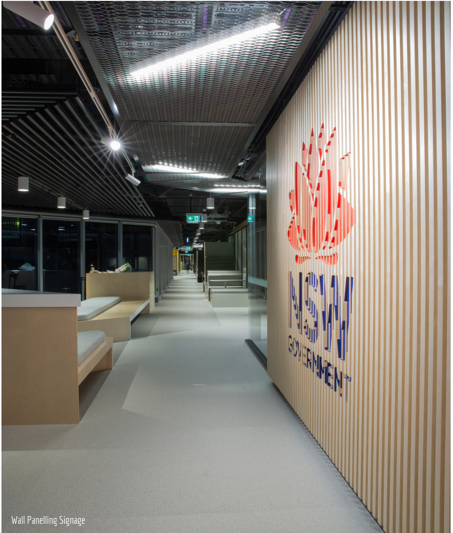
Wall Panelling Signage