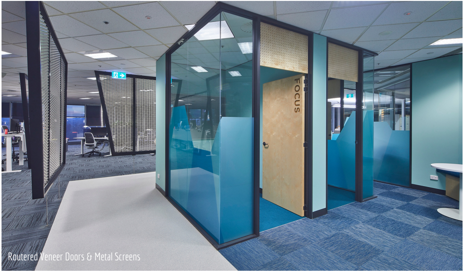
Routed Veneer Doors & Metal Screens