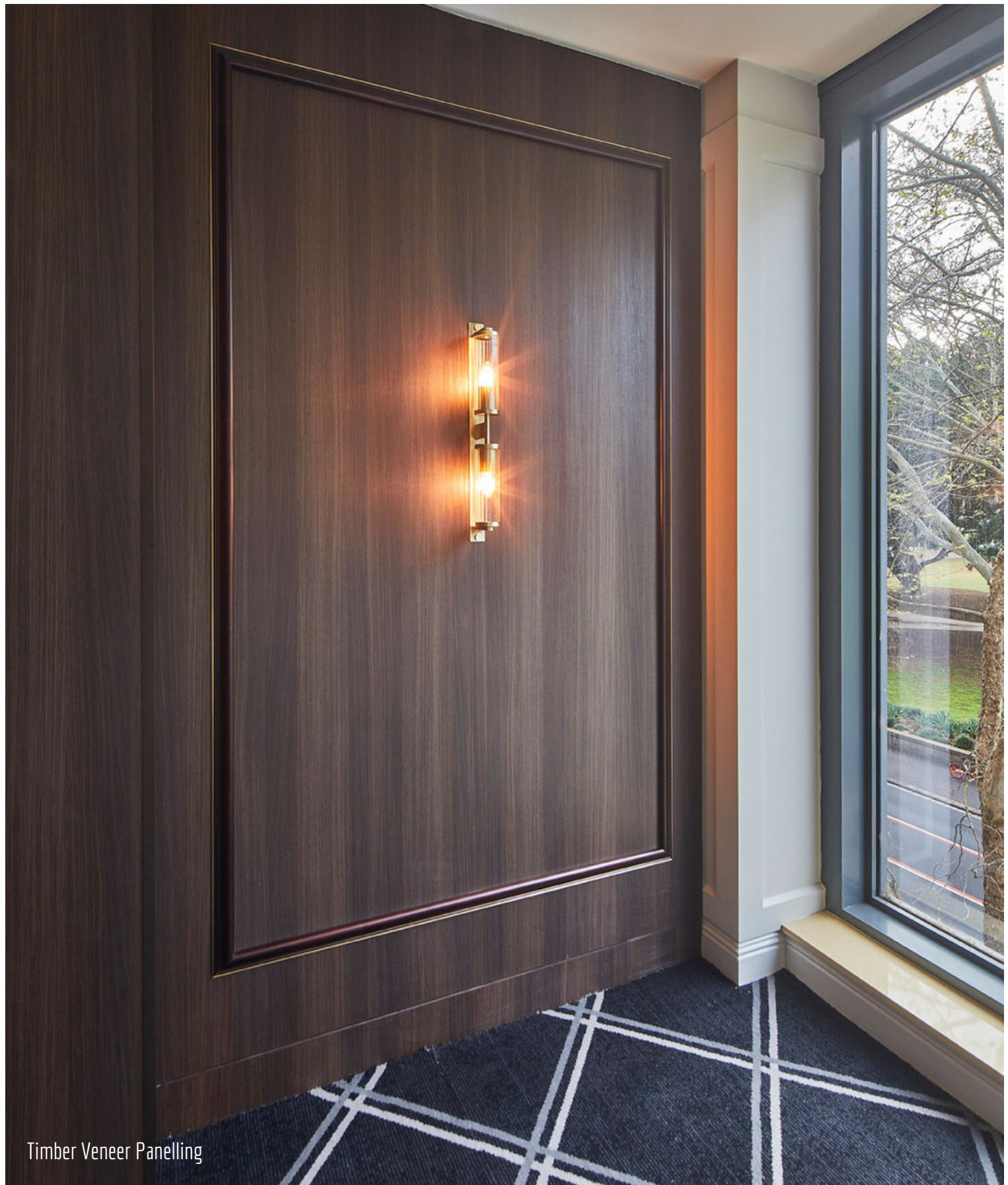
Timber Veneer Panelling