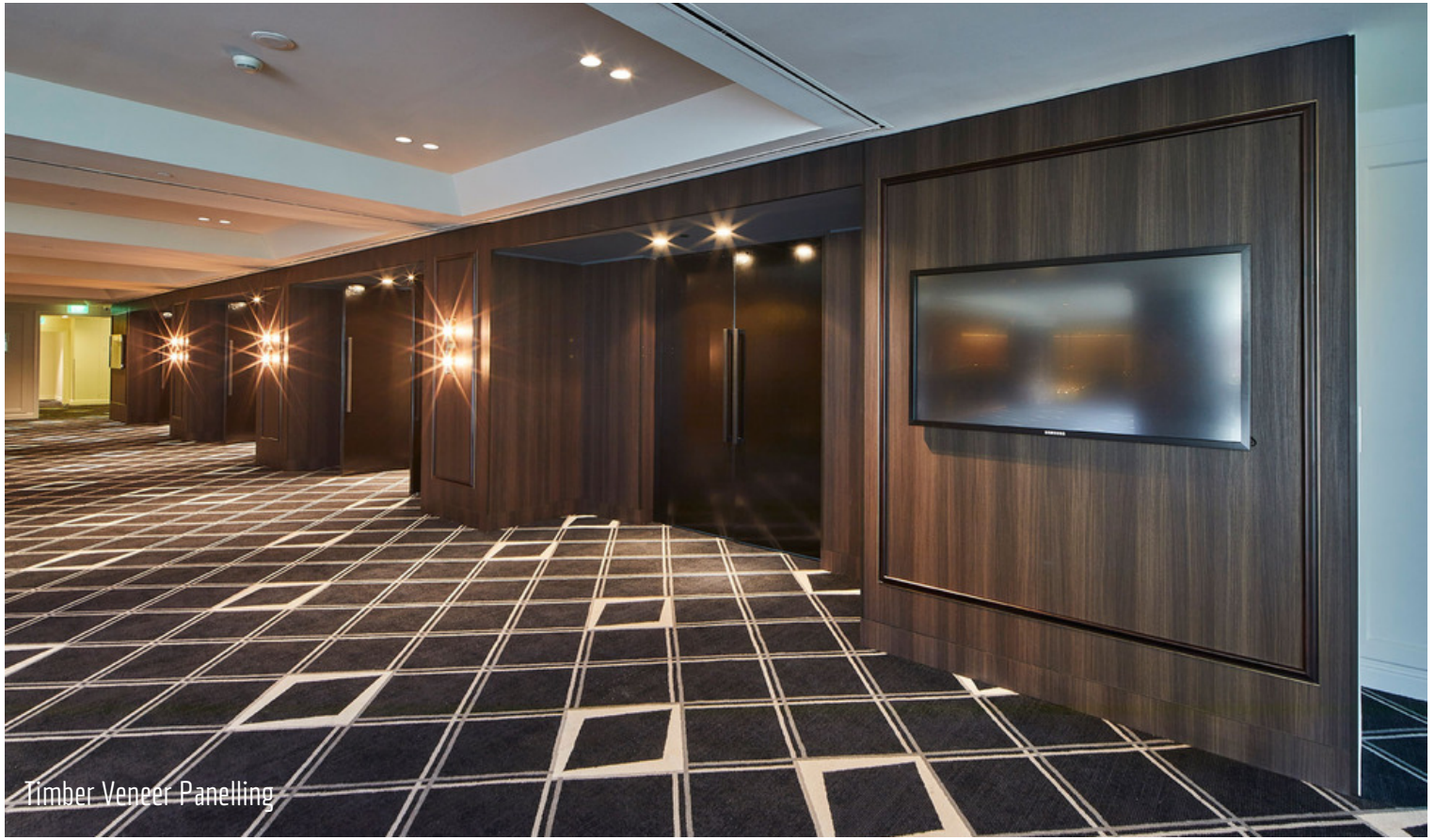
Timber Veneer Panelling