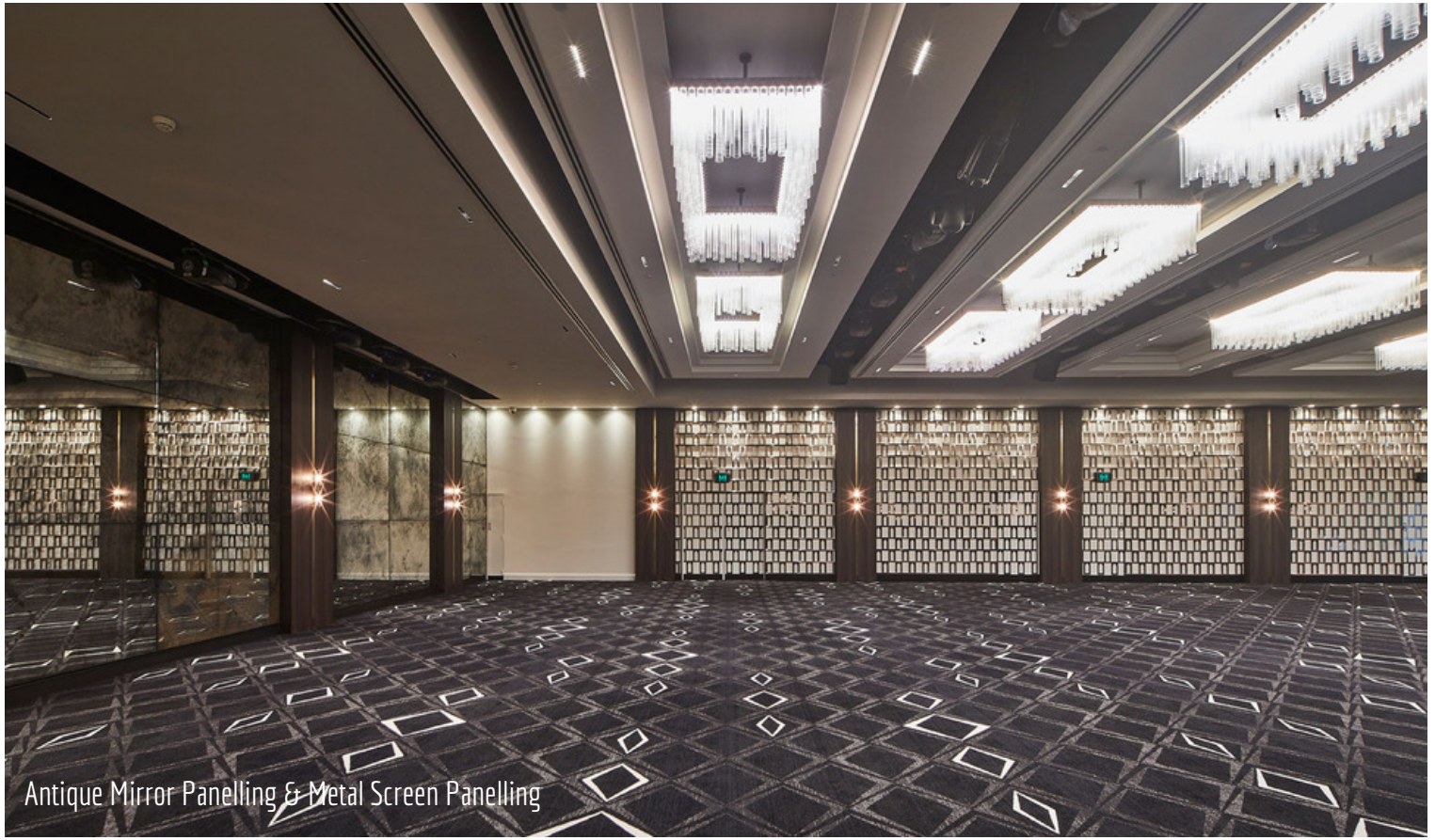
Antique Mirror Panelling & Metal Screen Panelling