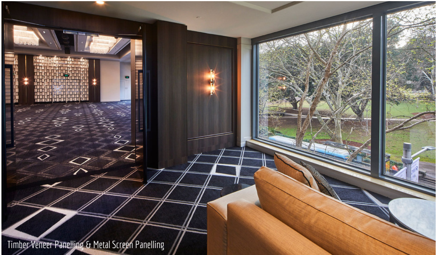
Timber Veneer Panelling & Metal Screen Panelling