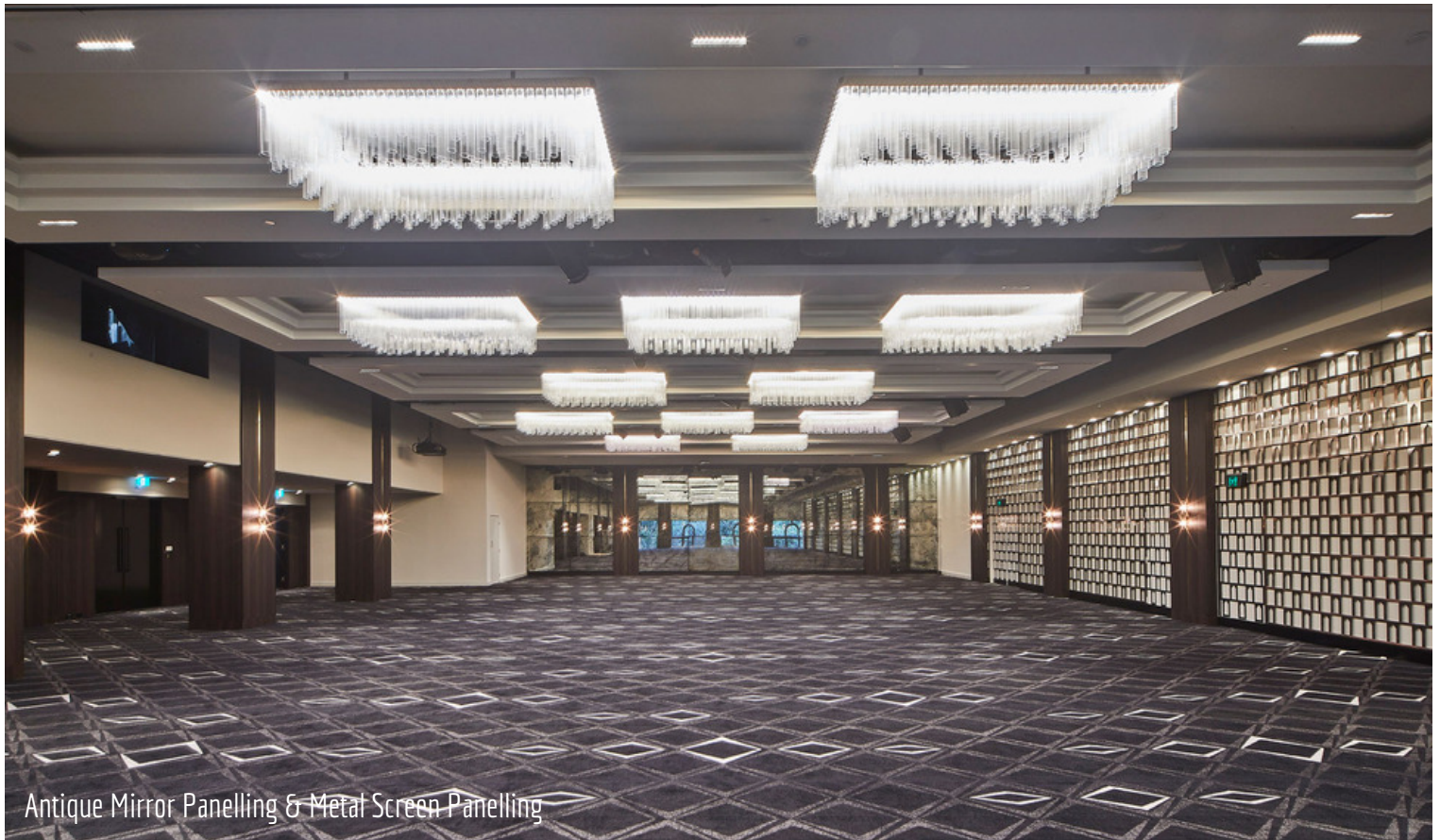
Antique Mirror Panelling & Metal Screen Panelling