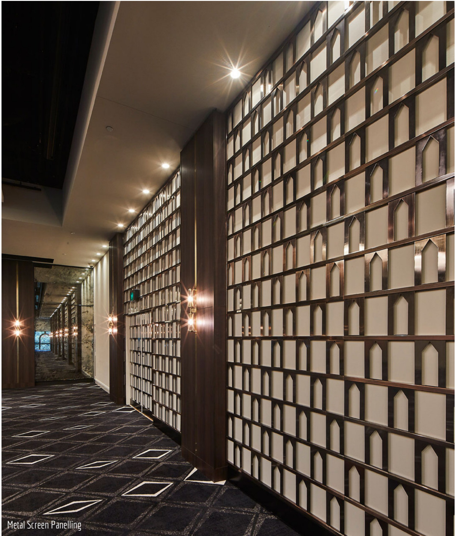
Metal Screen Panelling