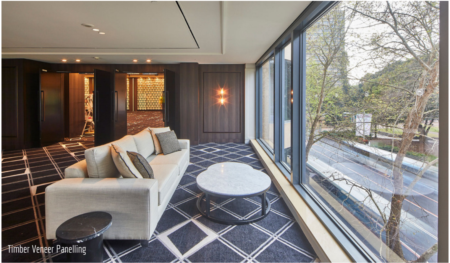
Timber Veneer Panelling