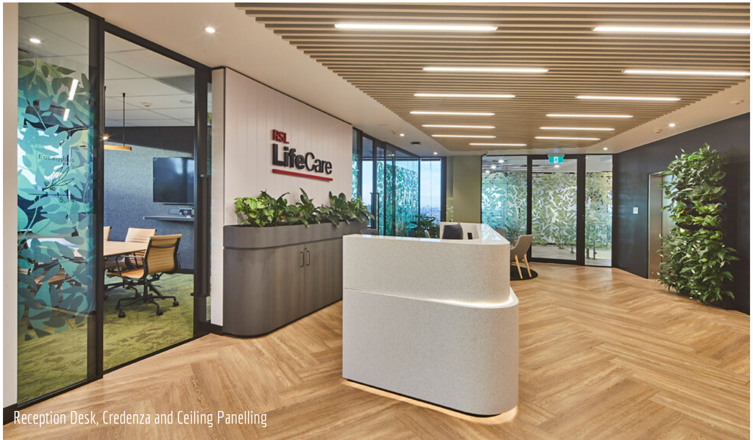
Reception Desk, Credenza and Ceiling Panelling