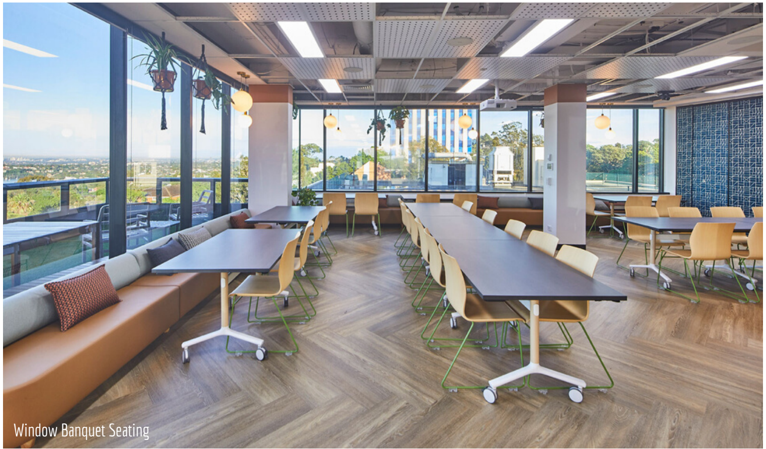
Window Banquet Seating