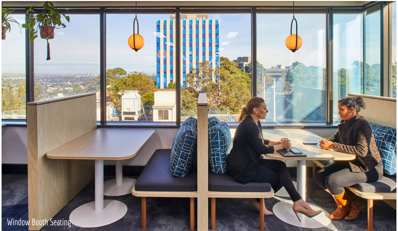
Window Booth Seating