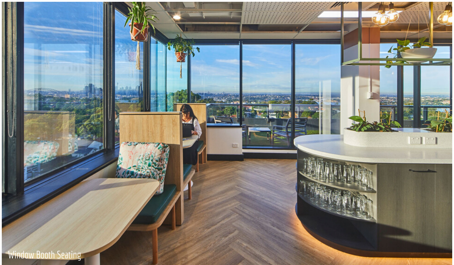
Window Booth Seating