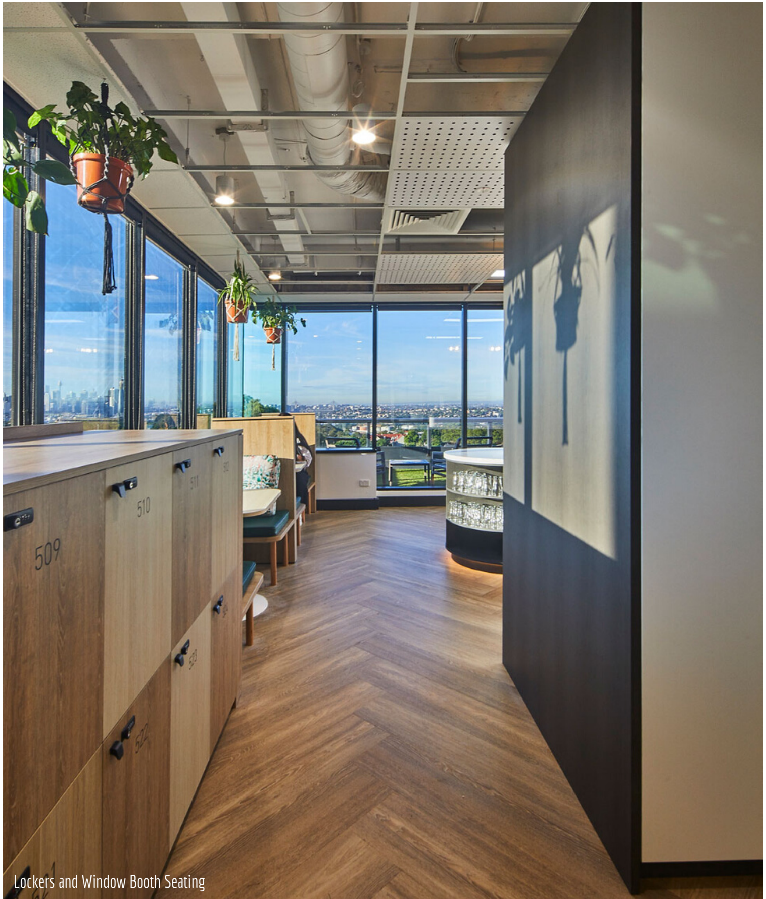
Lockers and Window Booth Seating