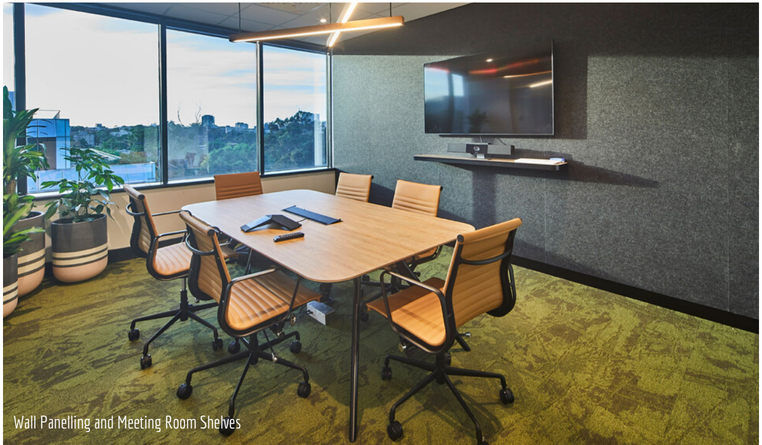
Wall Panelling and Meeting Room Shelves