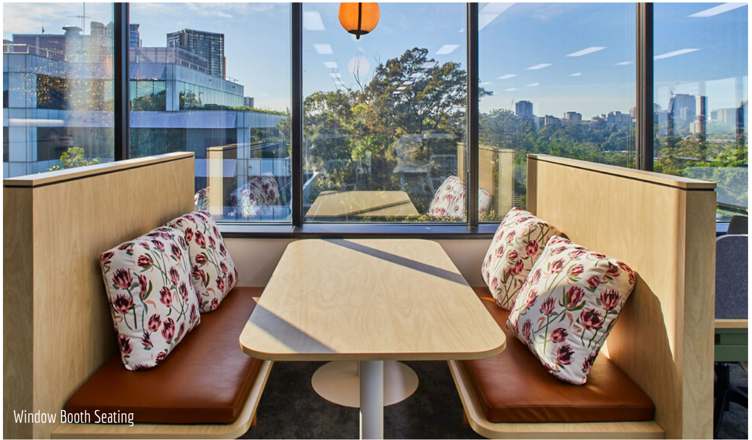
Window Booth Seating