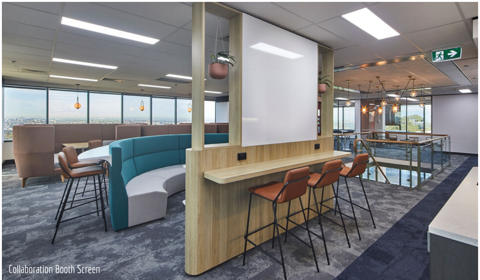
Collaboration Booth Screen