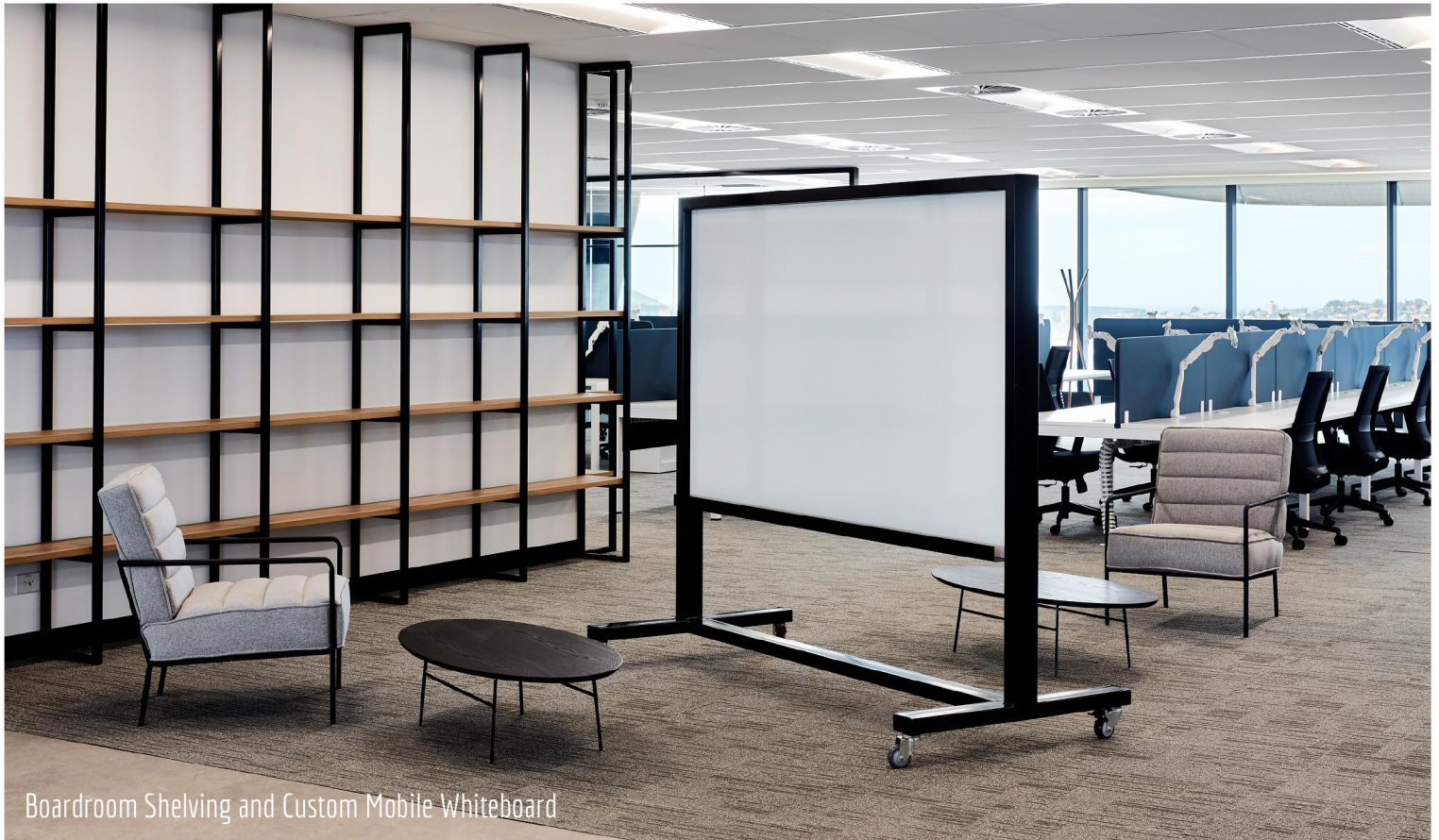
Boardroom Shelving and Custom Mobile Whiteboard