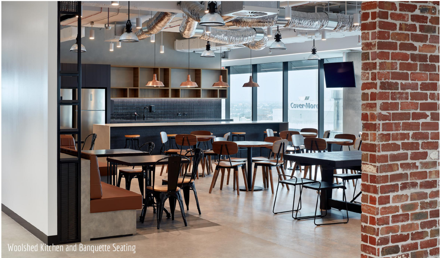
Woolshed Kitchen and Banquette Seating