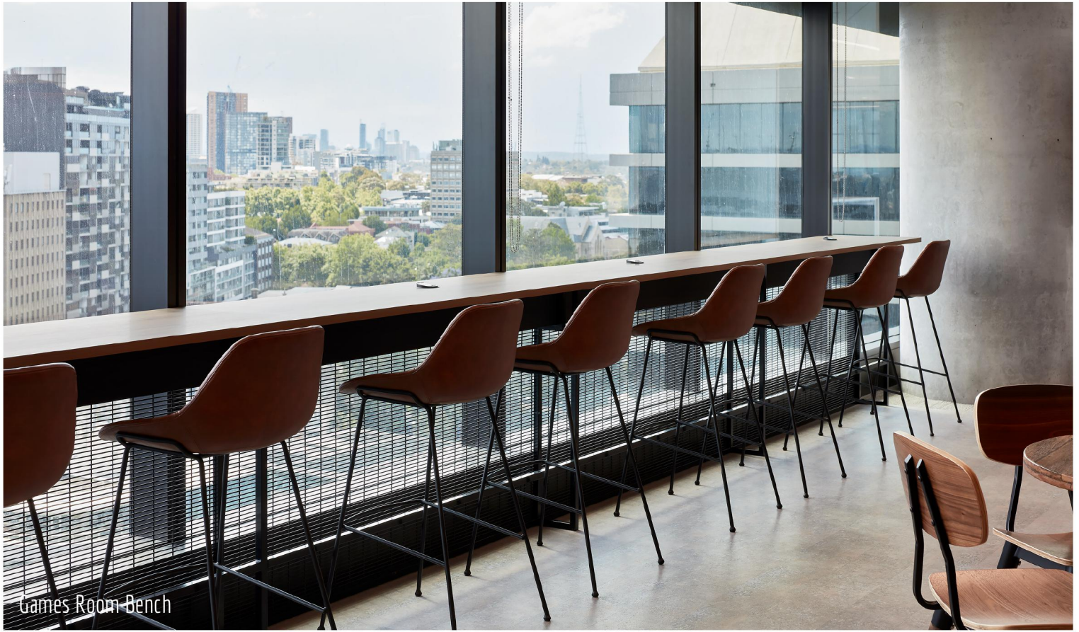
Games Room Bench