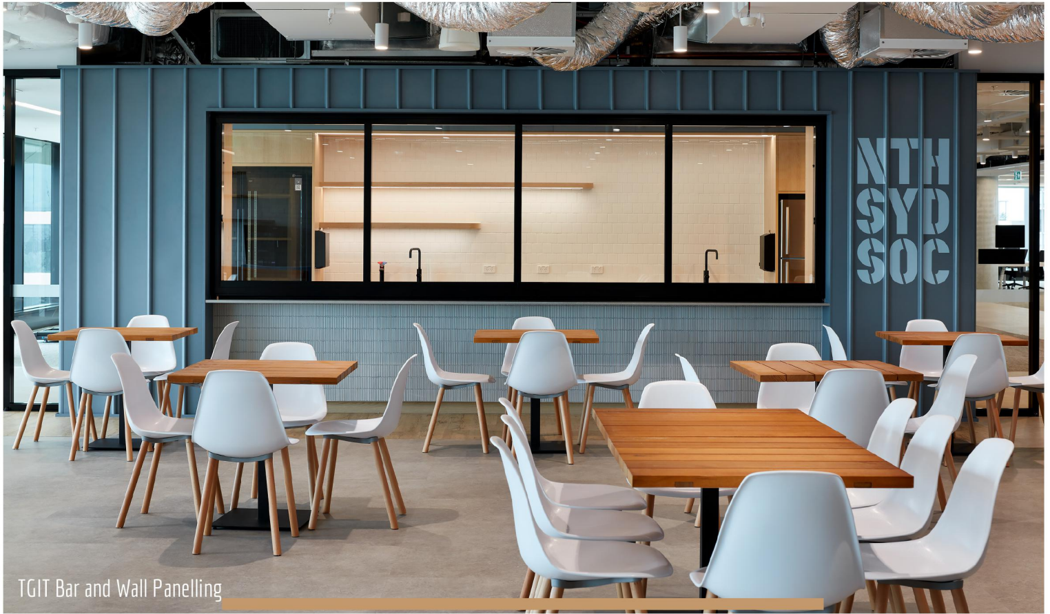
TGIT Bar and Wall Panelling