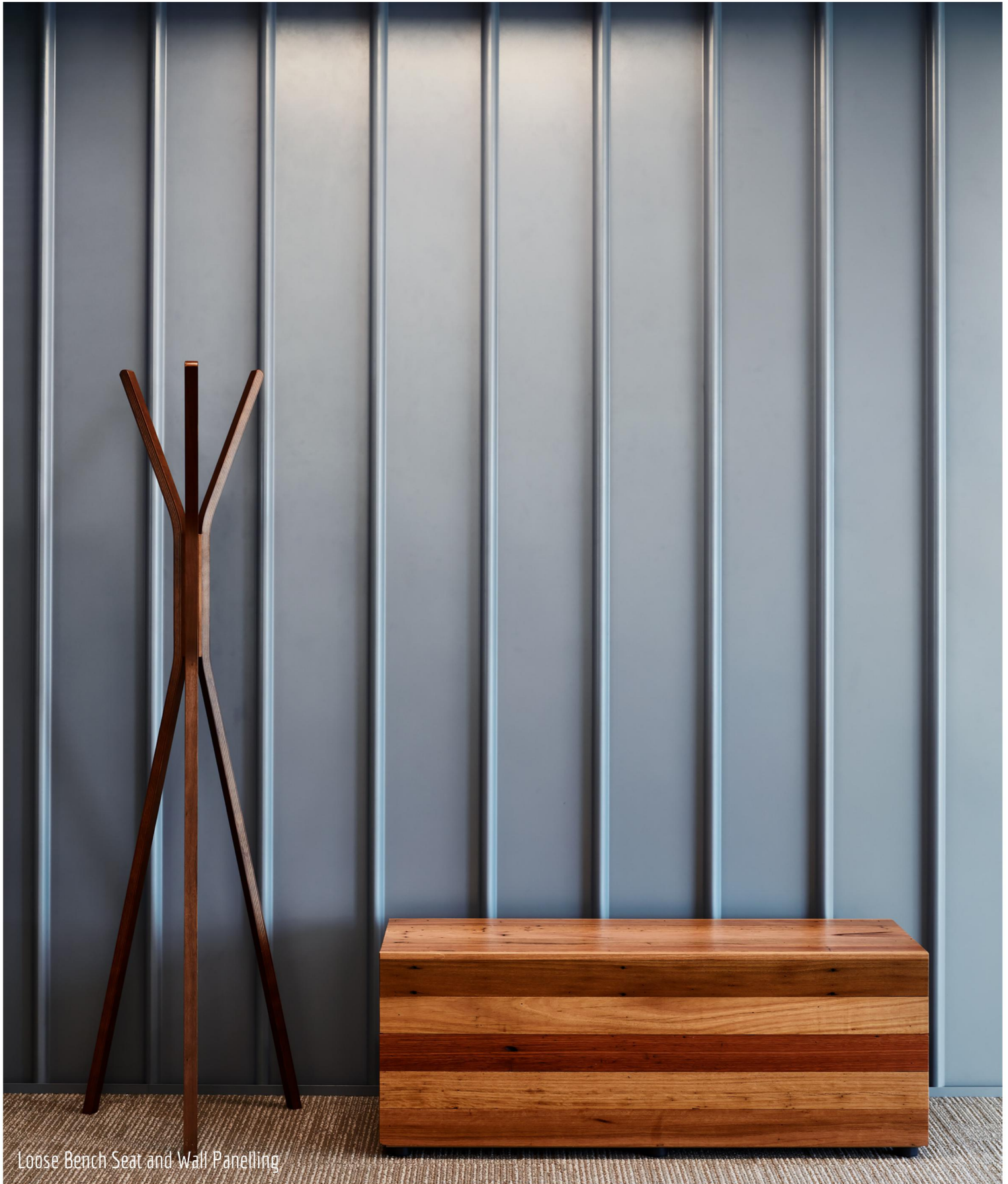
Loose Bench Seat and Wall Panelling