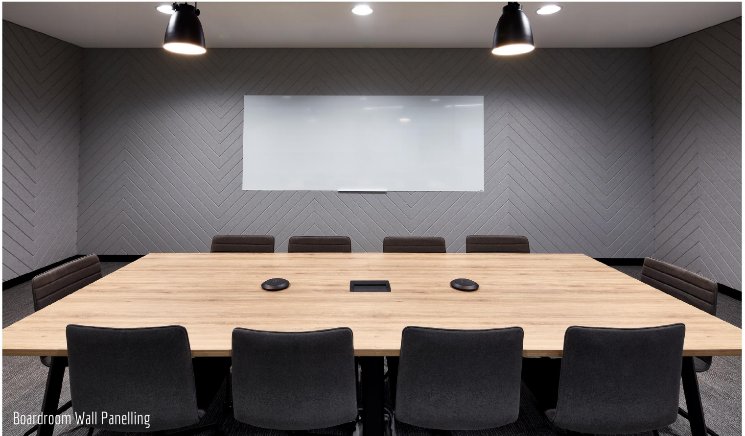
Boardroom Wall Panelling