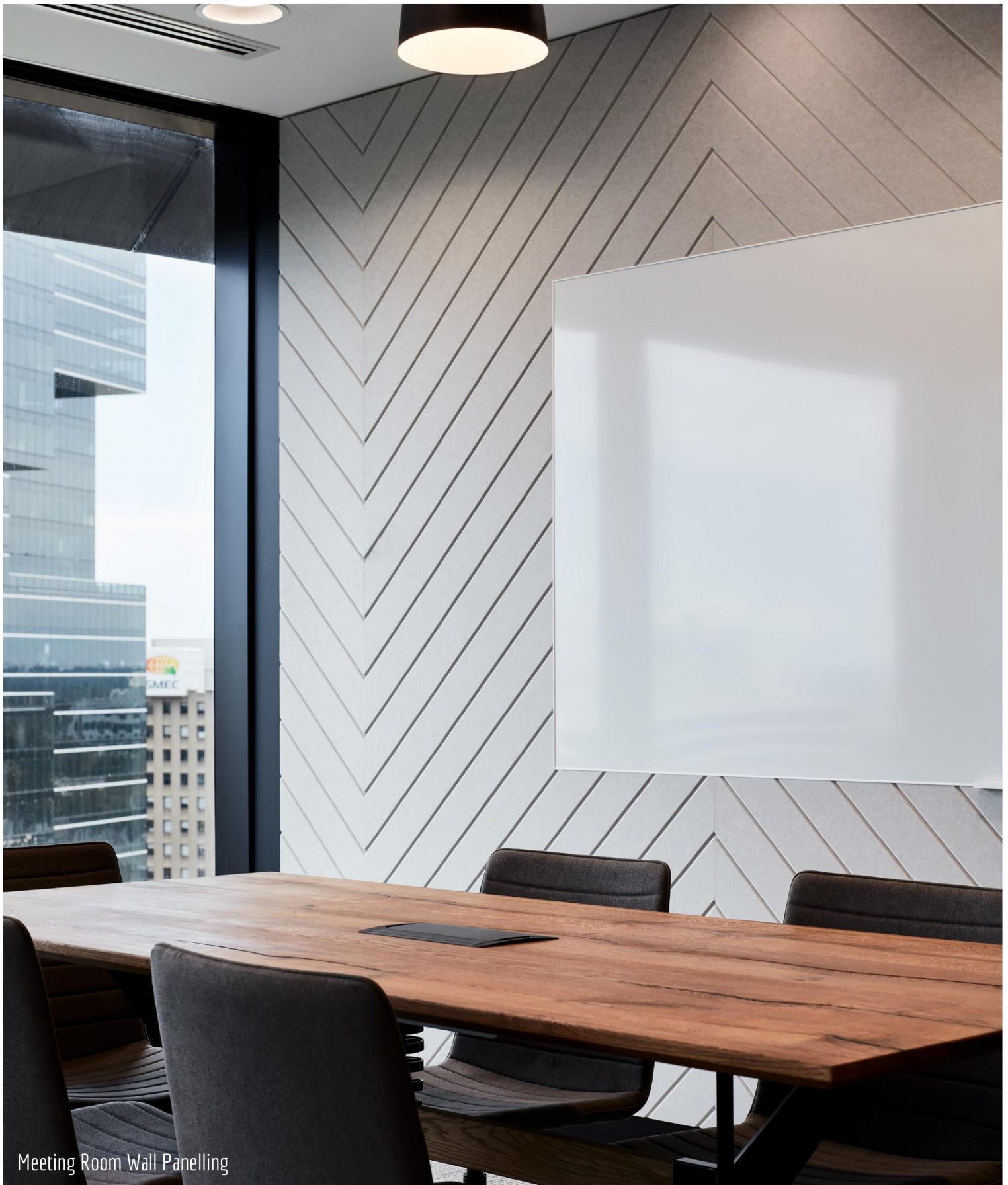
Meeting Room Wall Panelling