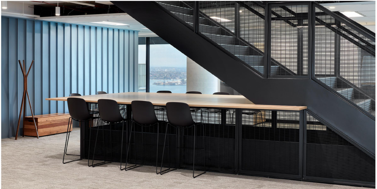
Under Stair Bench, Loose Bench Seating and Wall Panelling