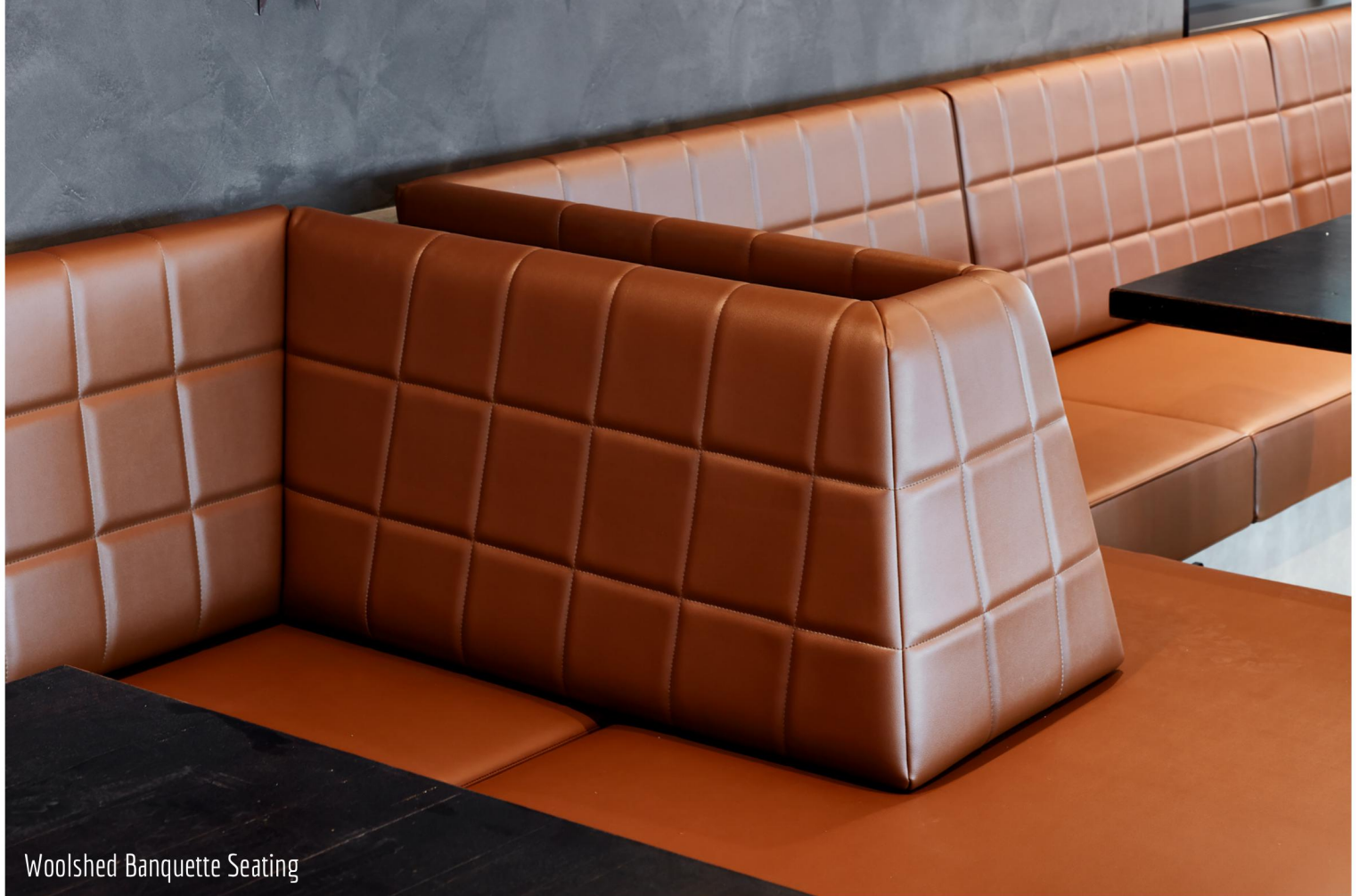
Woolshed Banquette Seating