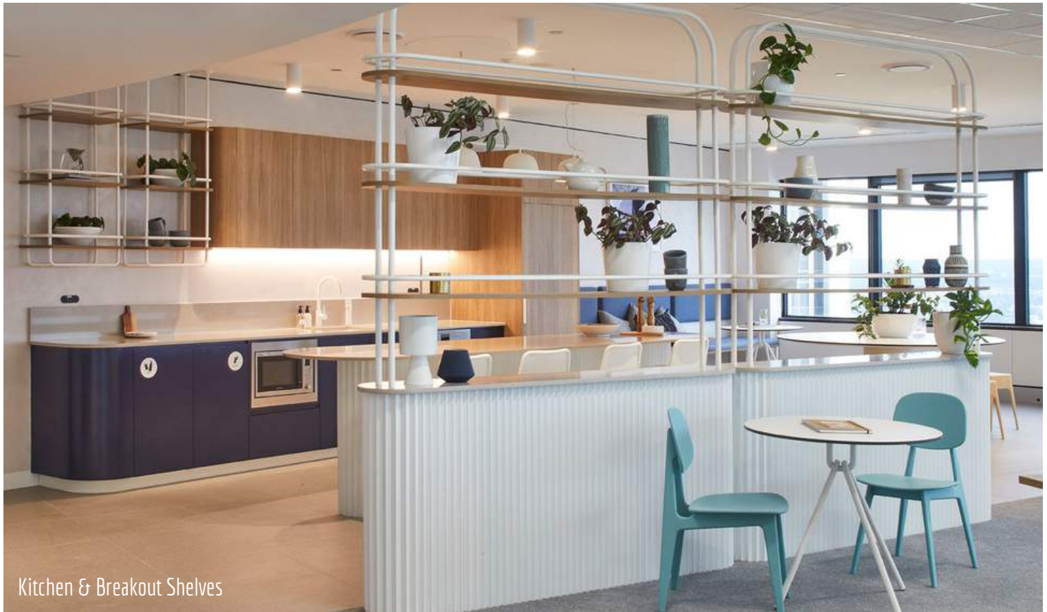
Kitchen & Breakout Shelves