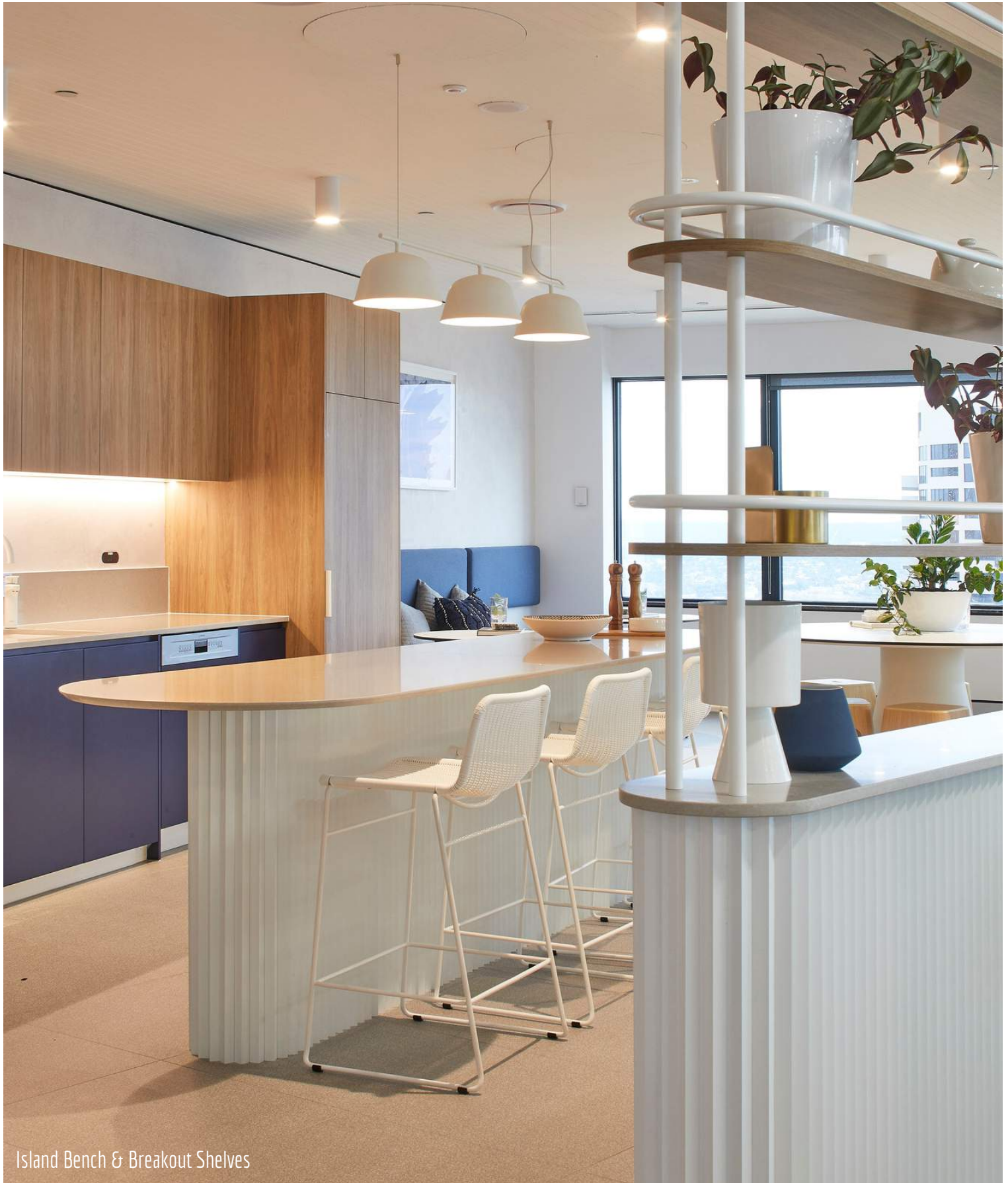
Island Bench & Breakout Shelves