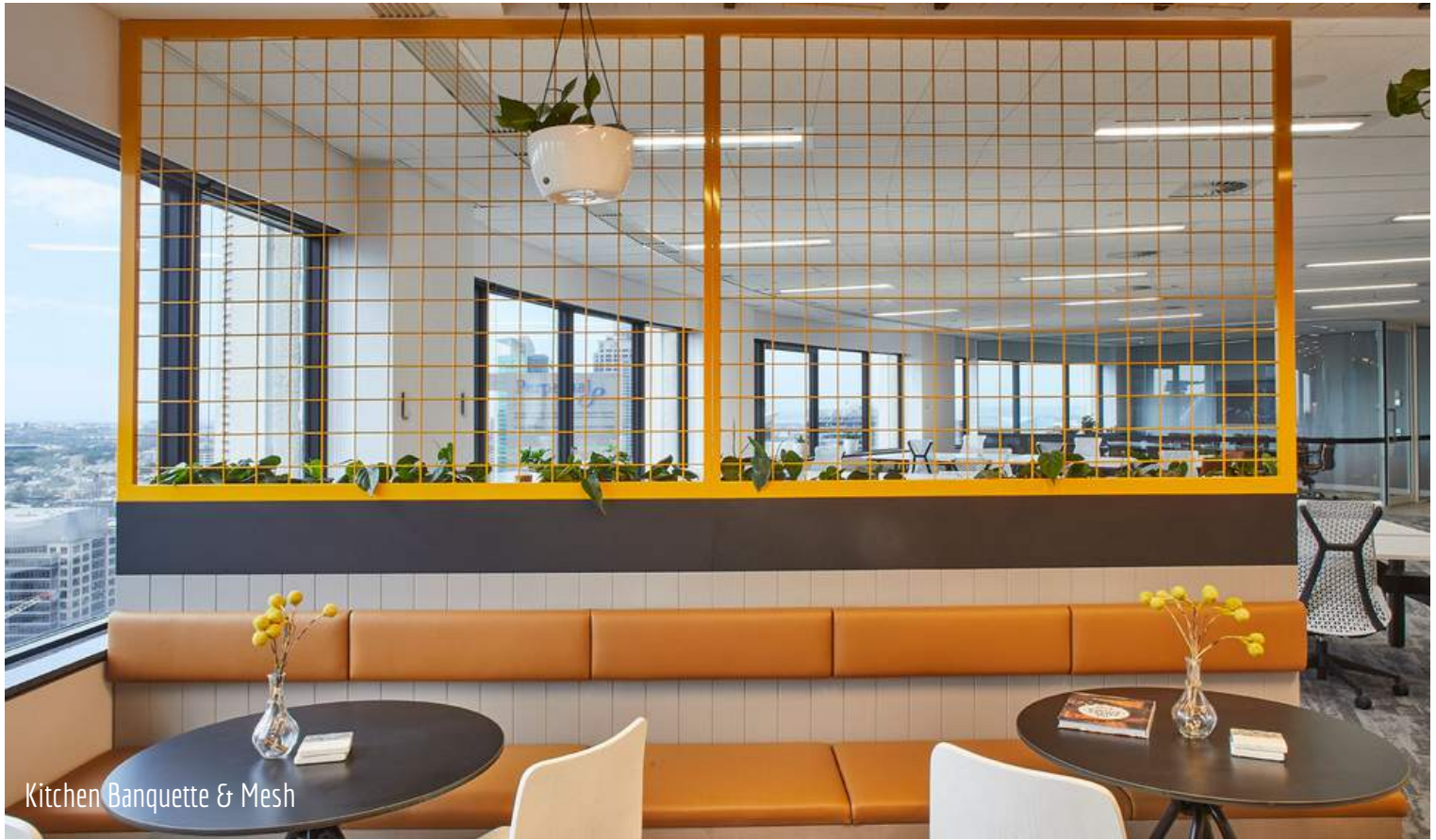
Kitchen Banquette & Mesh