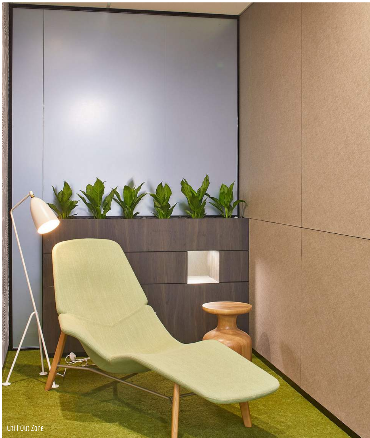
Chill Out Zone