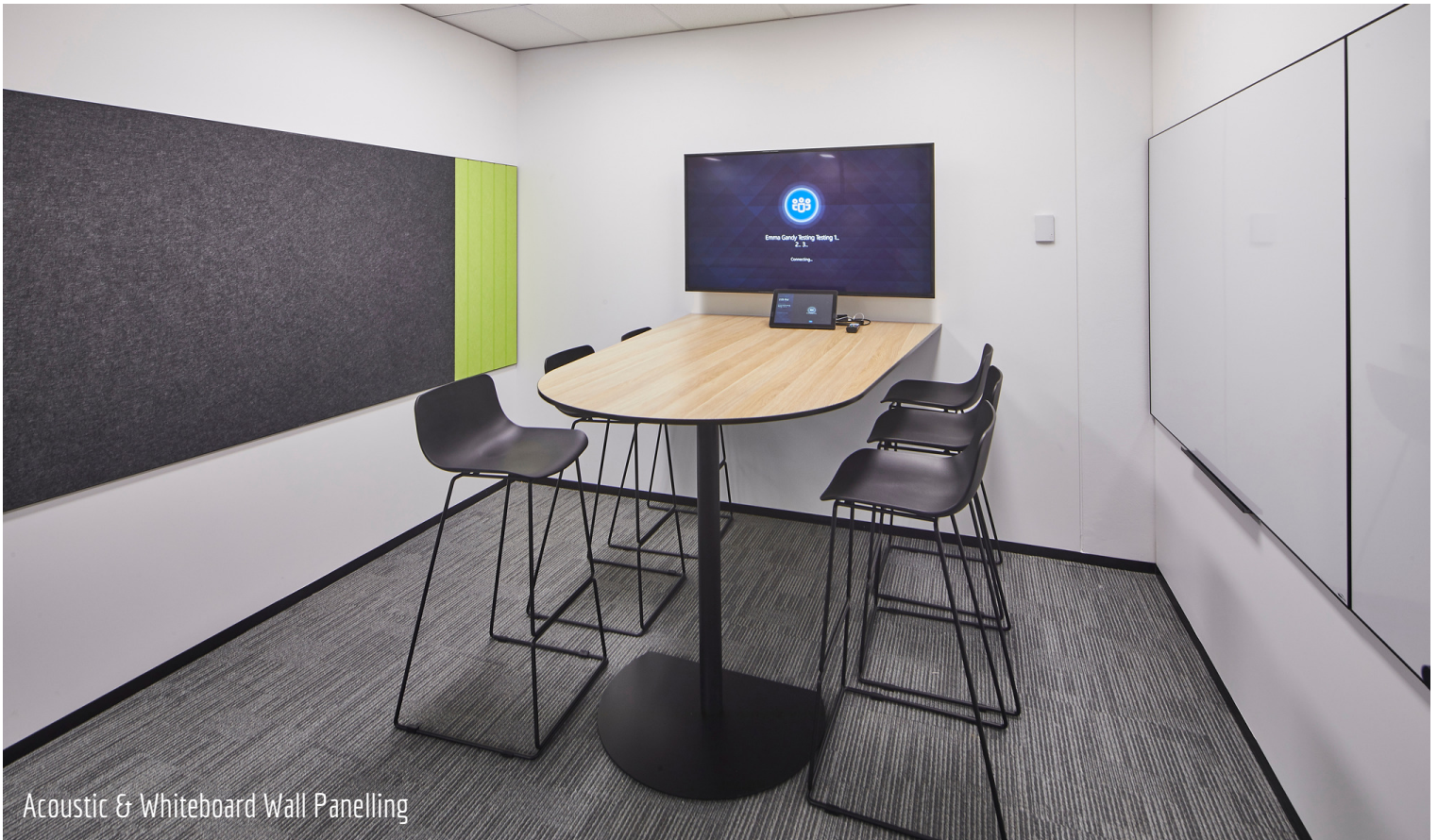
Acoustic & Whiteboard Wall Panelling