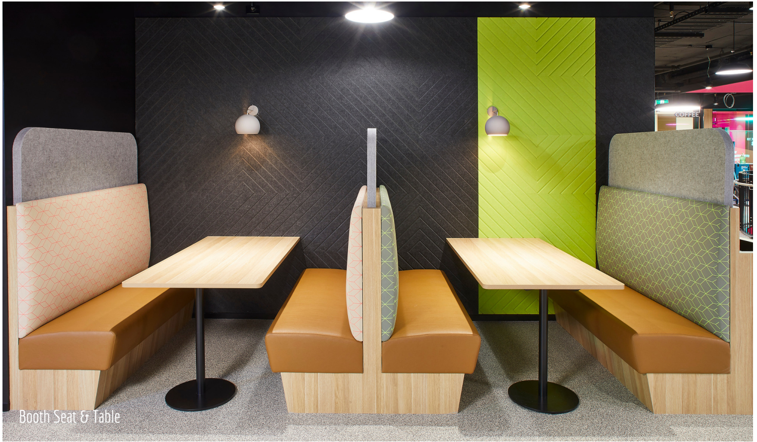
Booth Seat & Table