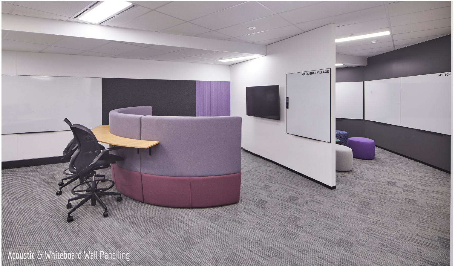
Acoustic & Whiteboard Wall Panelling