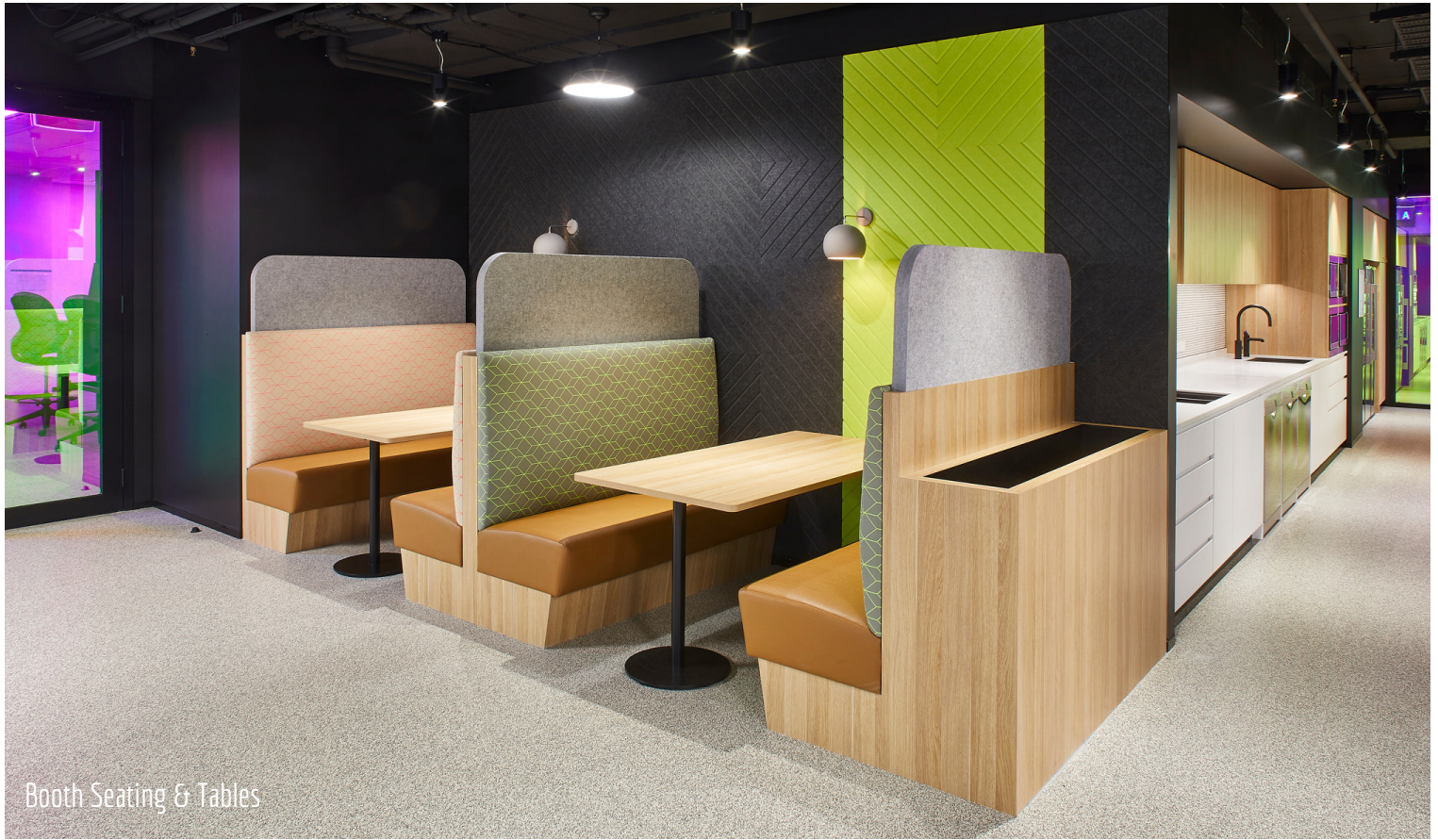
Booth Seating & Tables