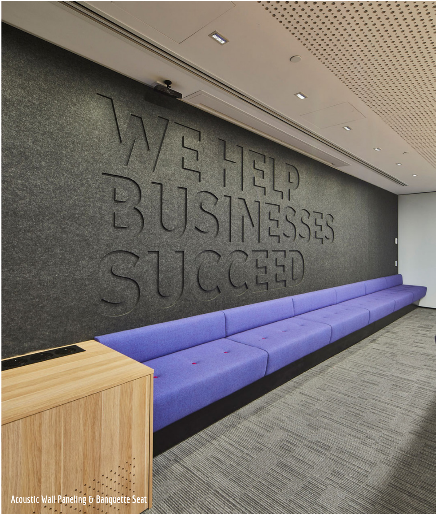
Acoustic Wall Paneling & Banquette Seat