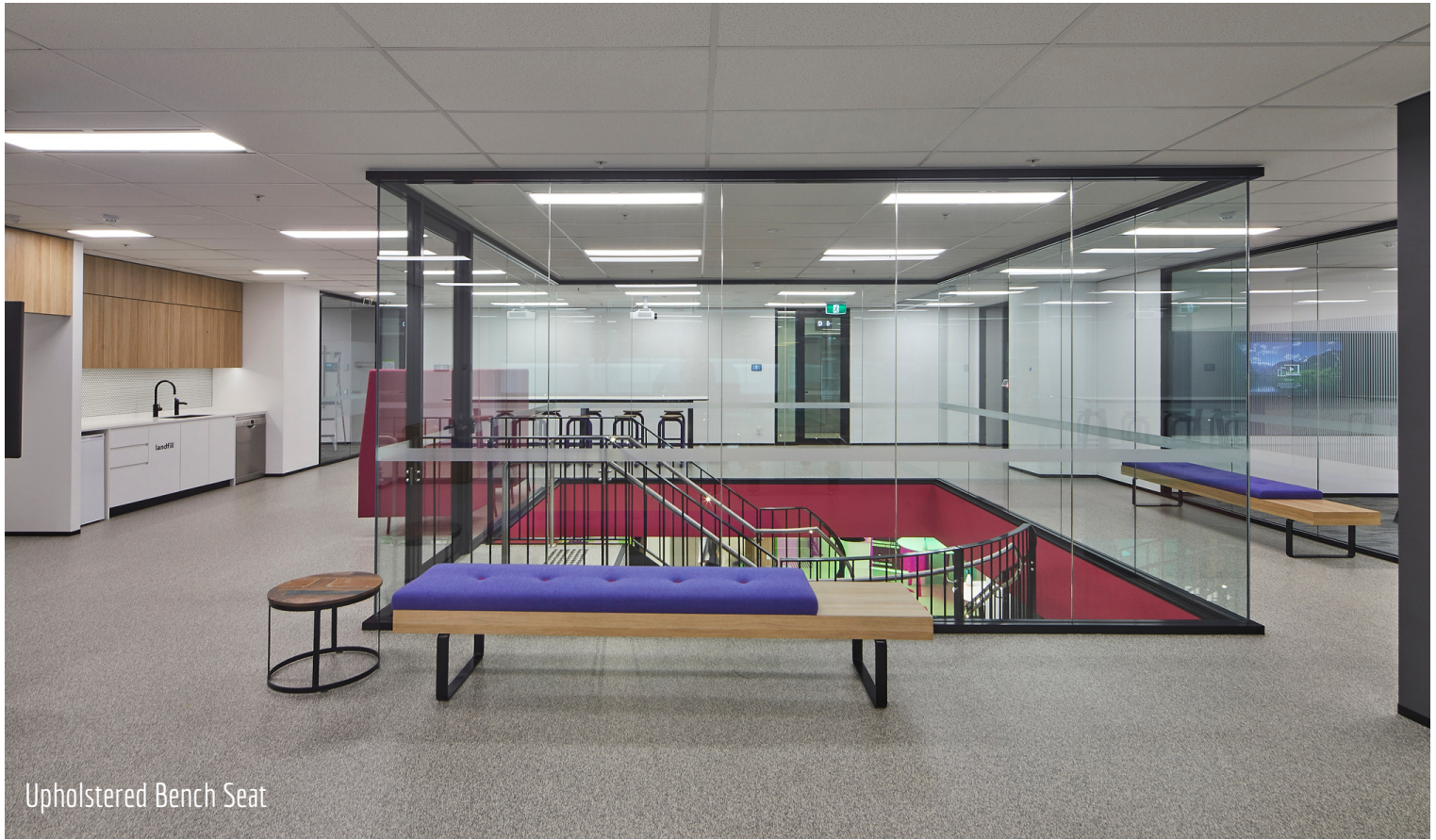
Upholstered Bench Seat