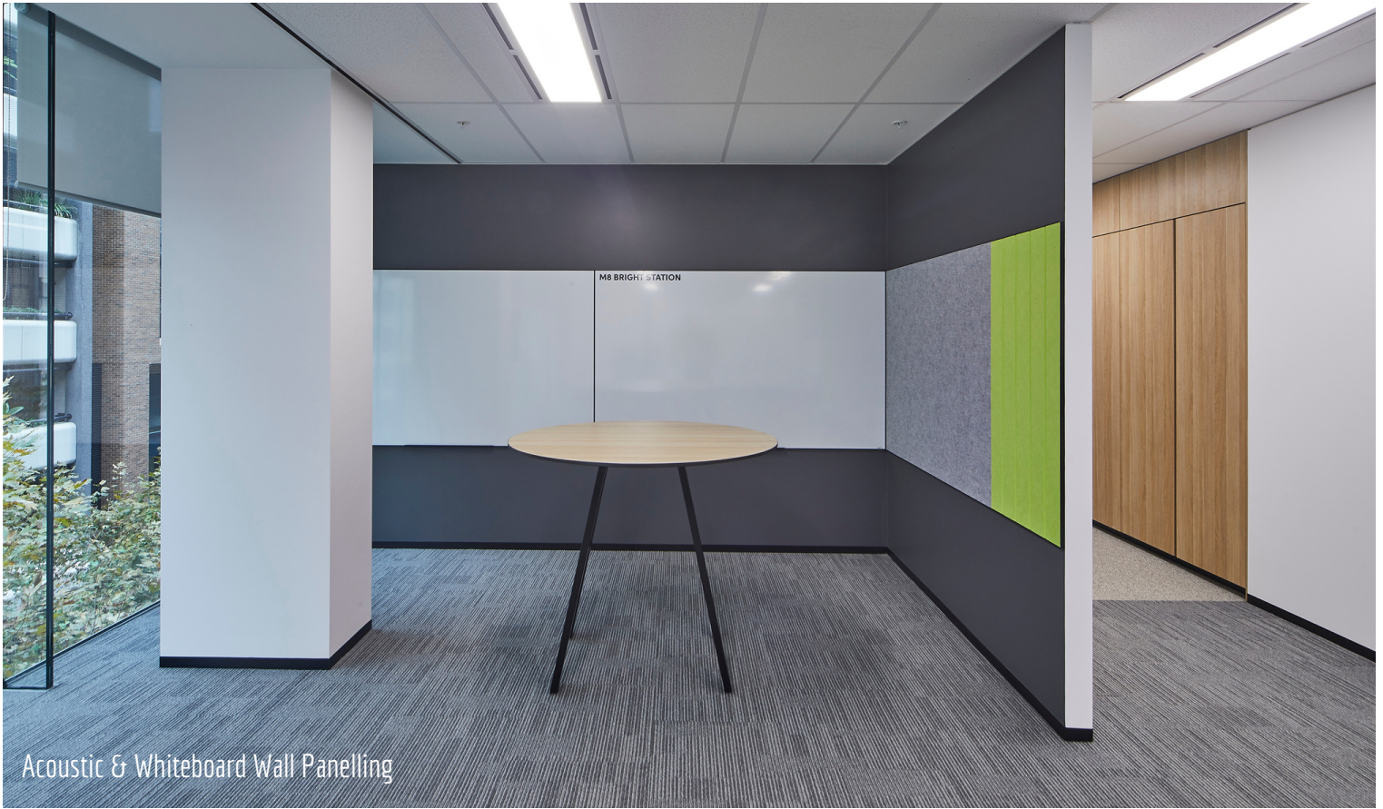
Acoustic & Whiteboard Wall Panelling