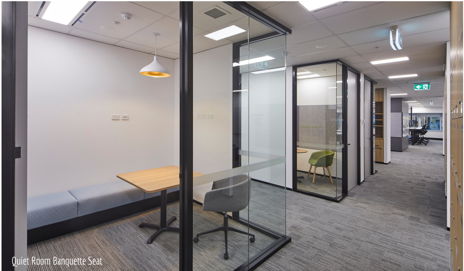
Quiet Room Banquette Seat