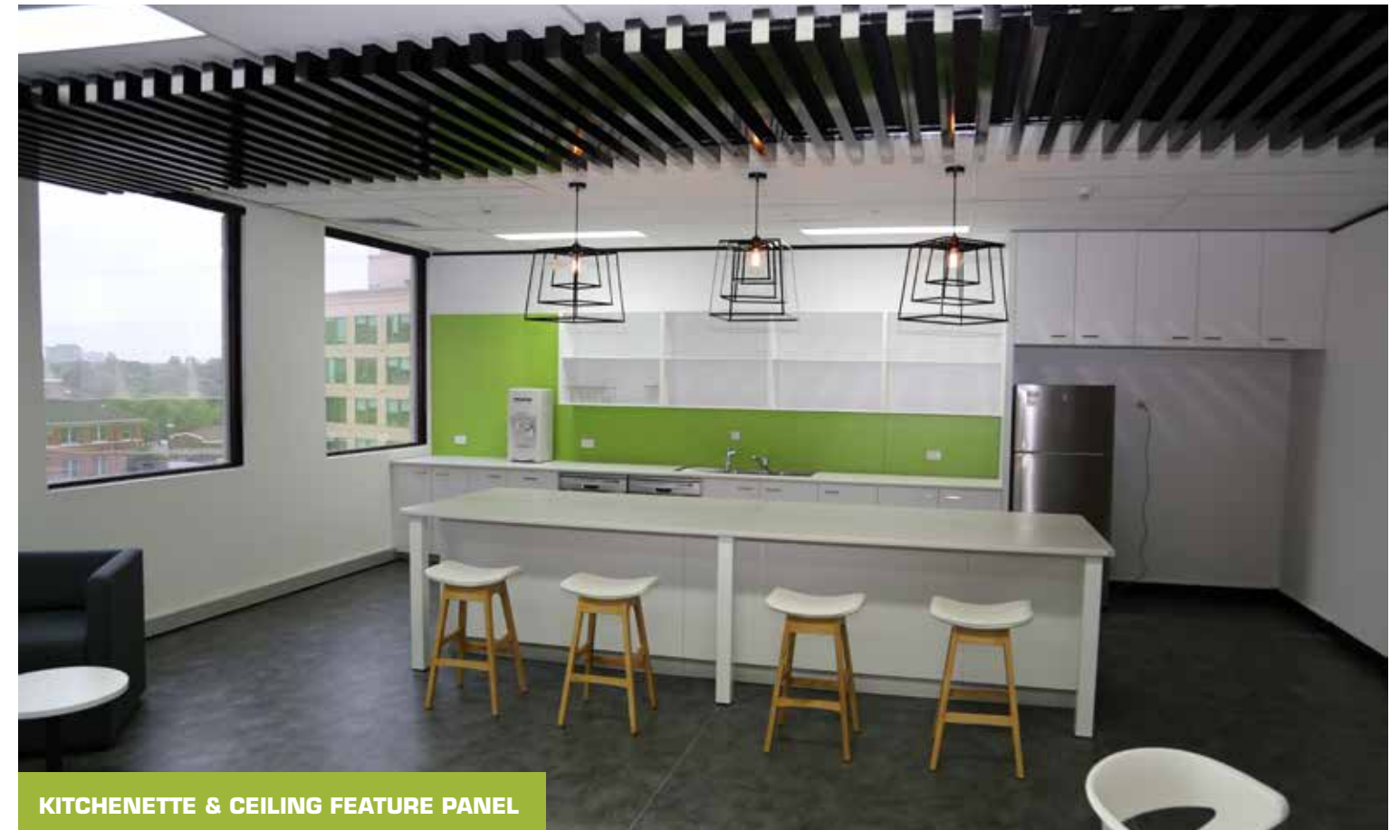
KITCHENETTE & CEILING FEATURE PANEL