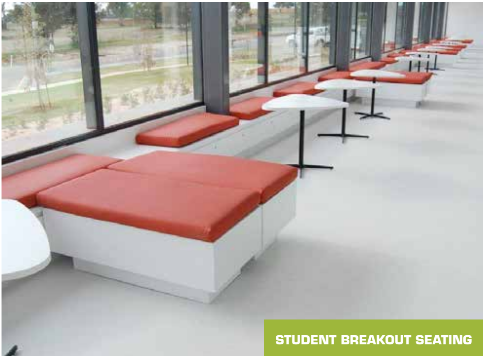
STUDENT BREAKOUT SEATING