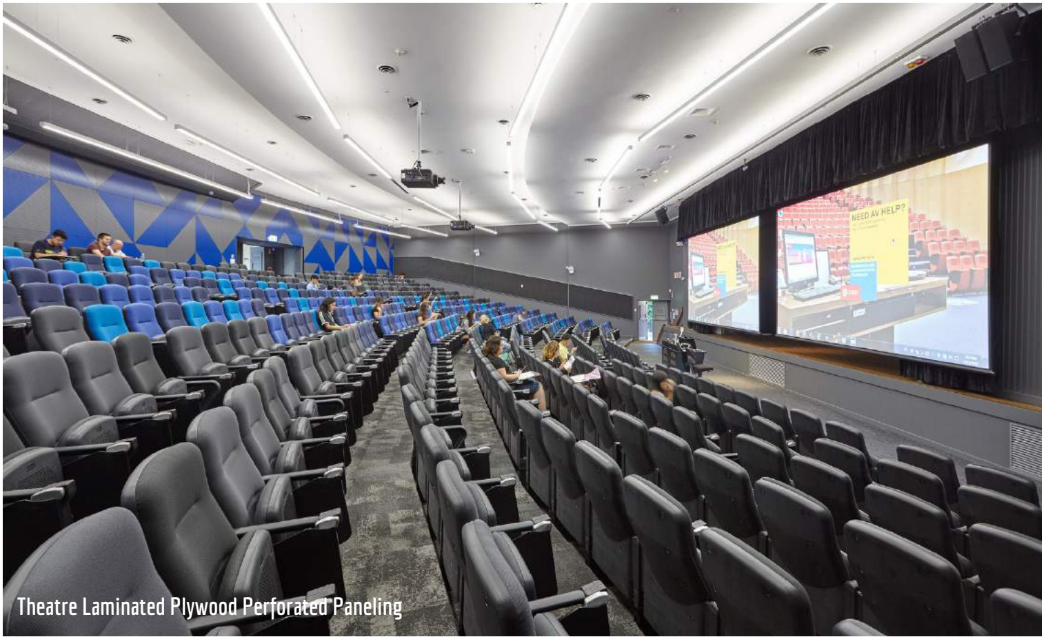
Theatre Laminated Plywood Perforated Paneling