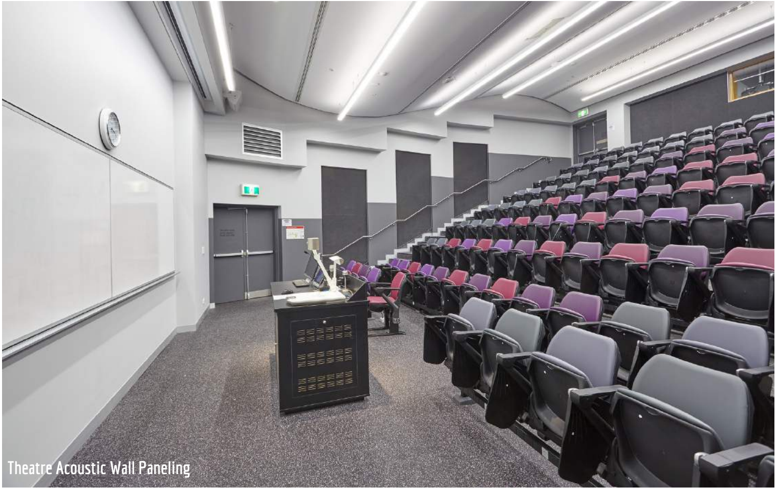
Theatre Acoustic Wall Paneling