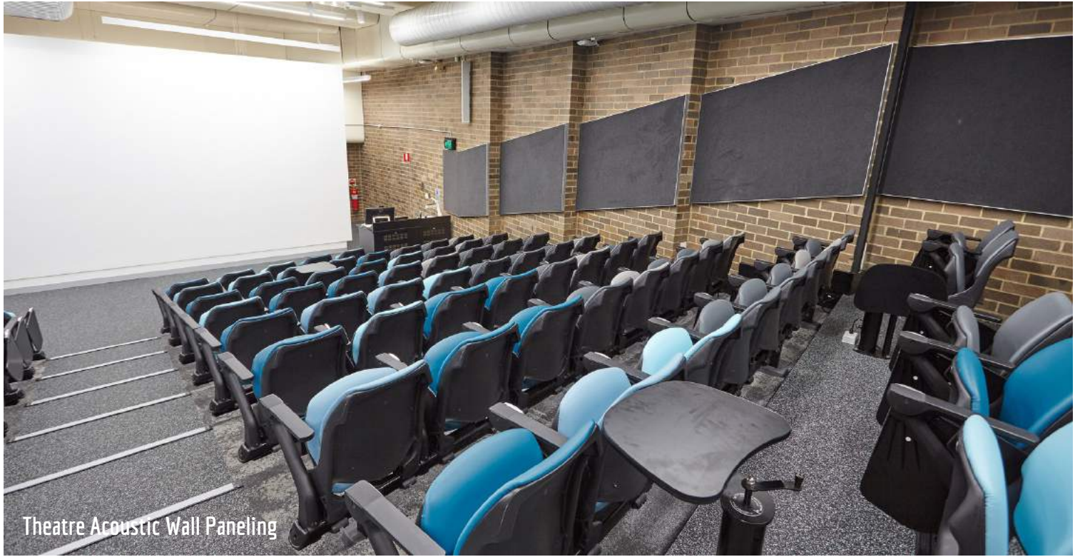
Theatre Acoustic Wall Paneling