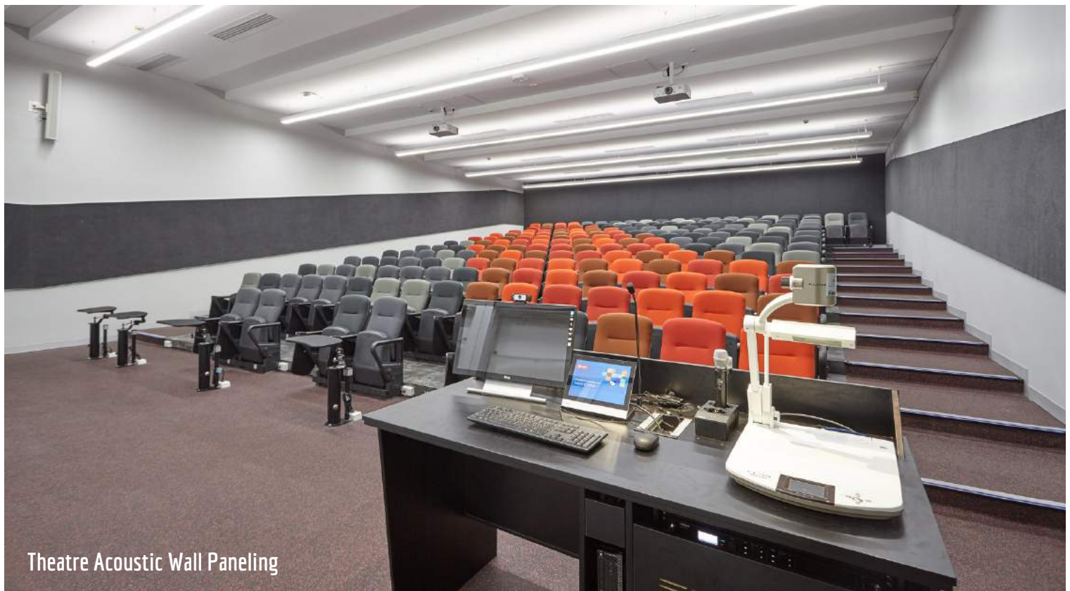
Theatre Acoustic Wall Paneling