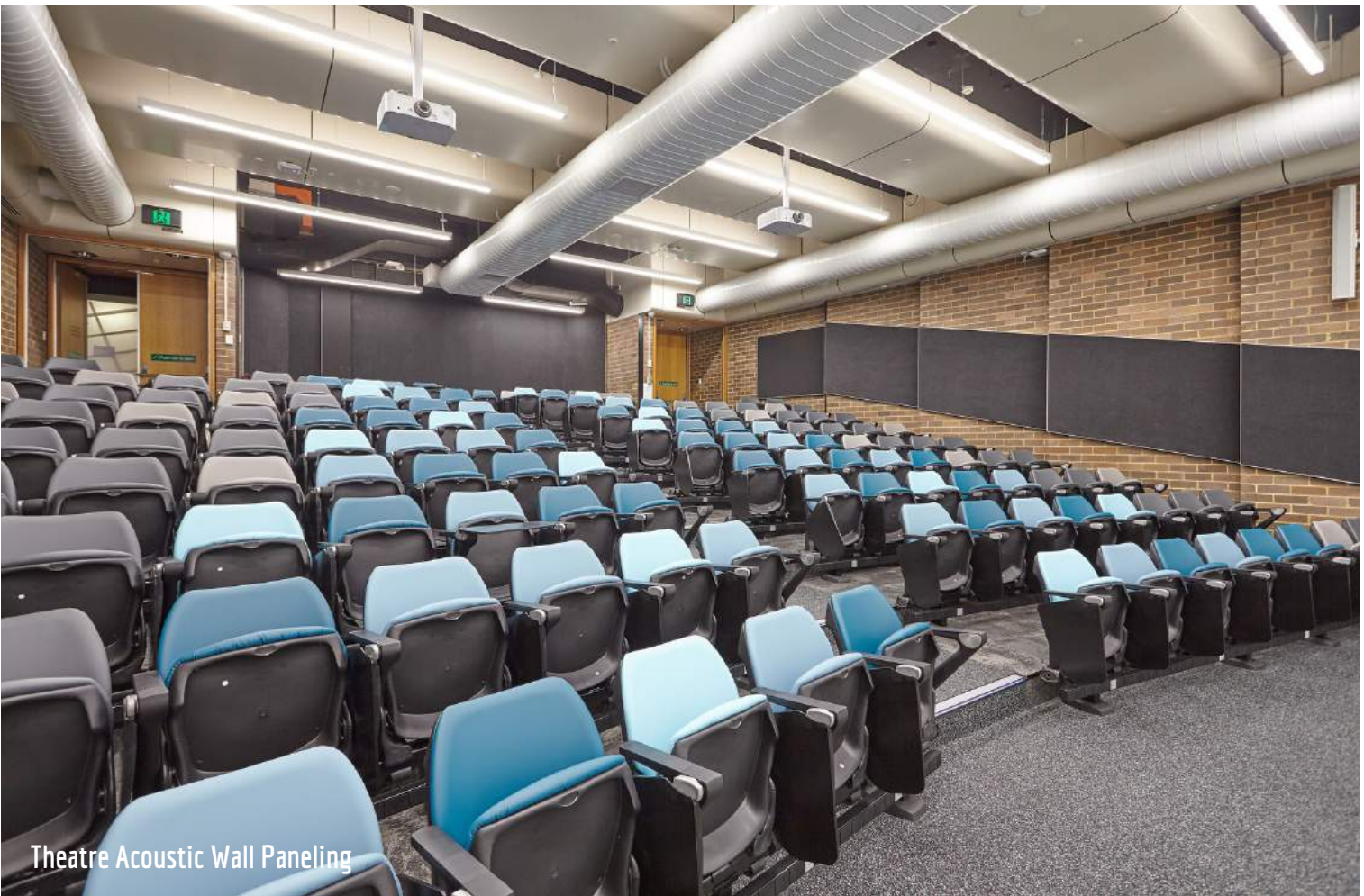
Theatre Acoustic Wall Paneling