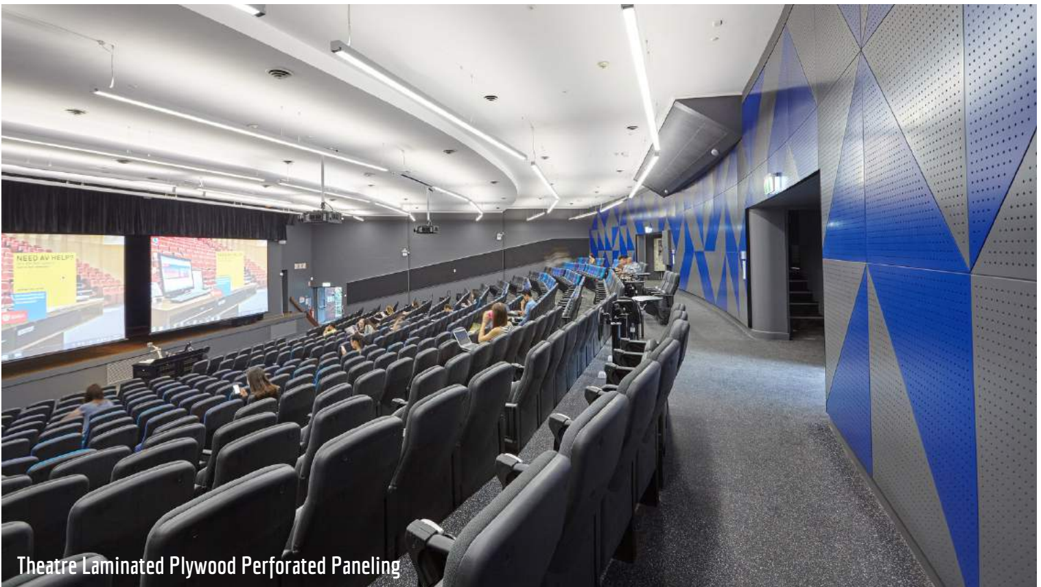
Theatre Laminated Plywood Perforated Paneling