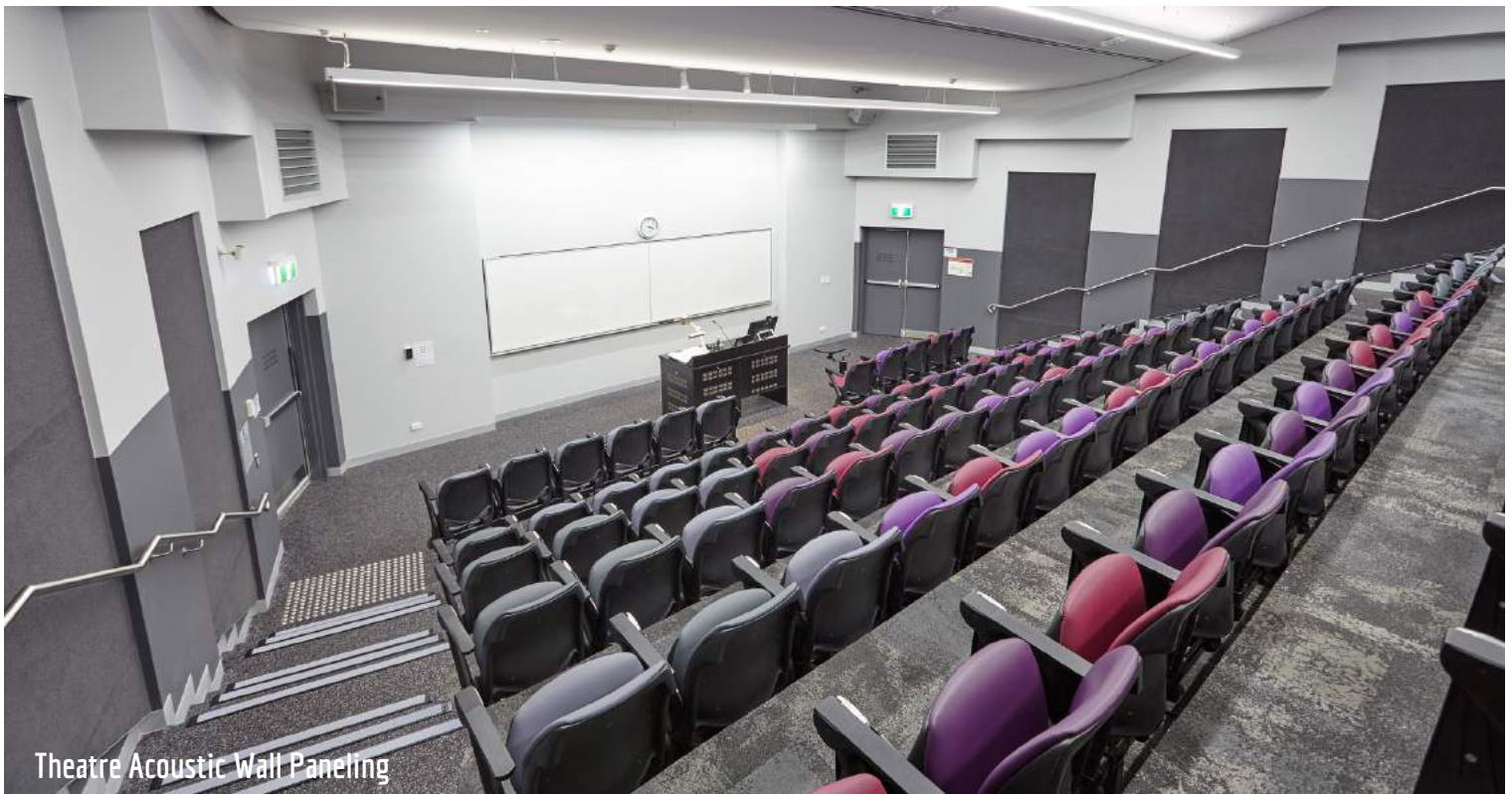
Theatre Acoustic Wall Paneling