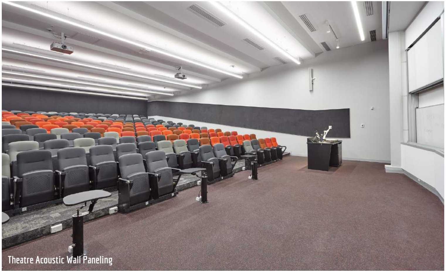
Theatre Acoustic Wall Paneling