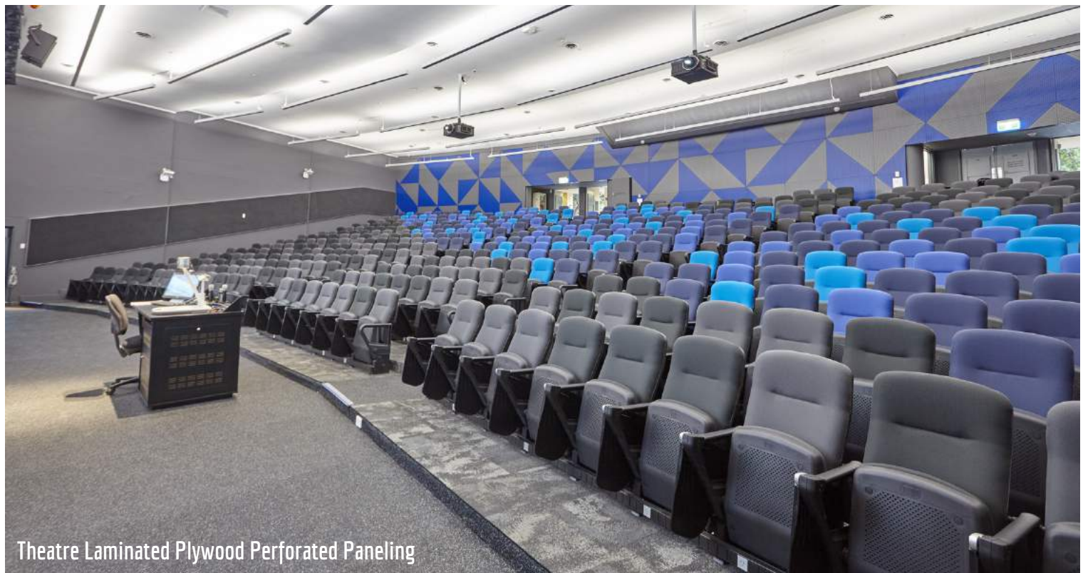
Theatre Laminated Plywood Perforated Paneling