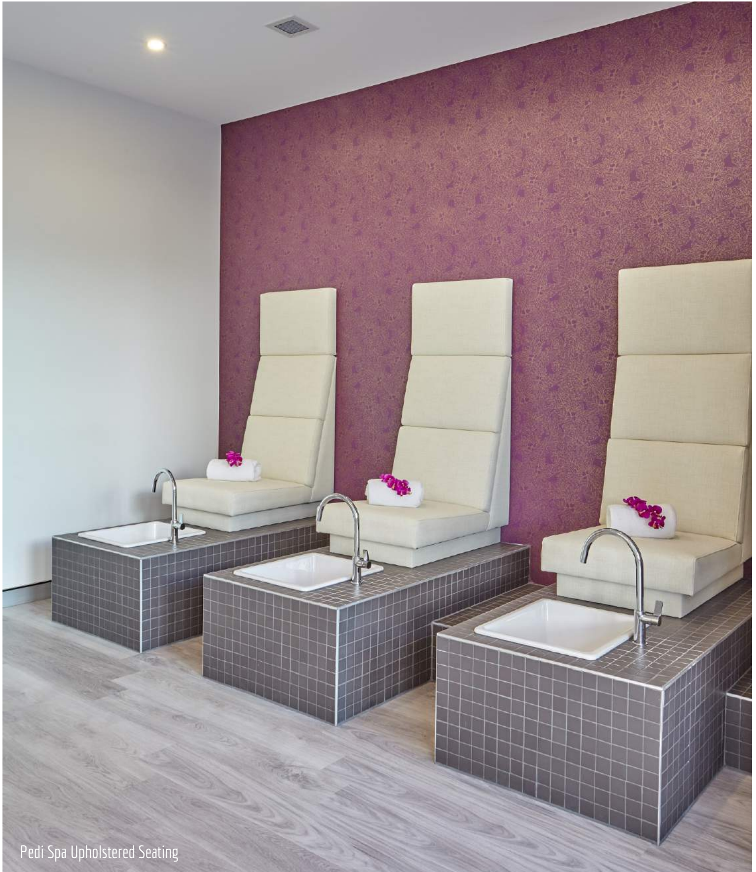
Pedi Spa Upholstered Seating