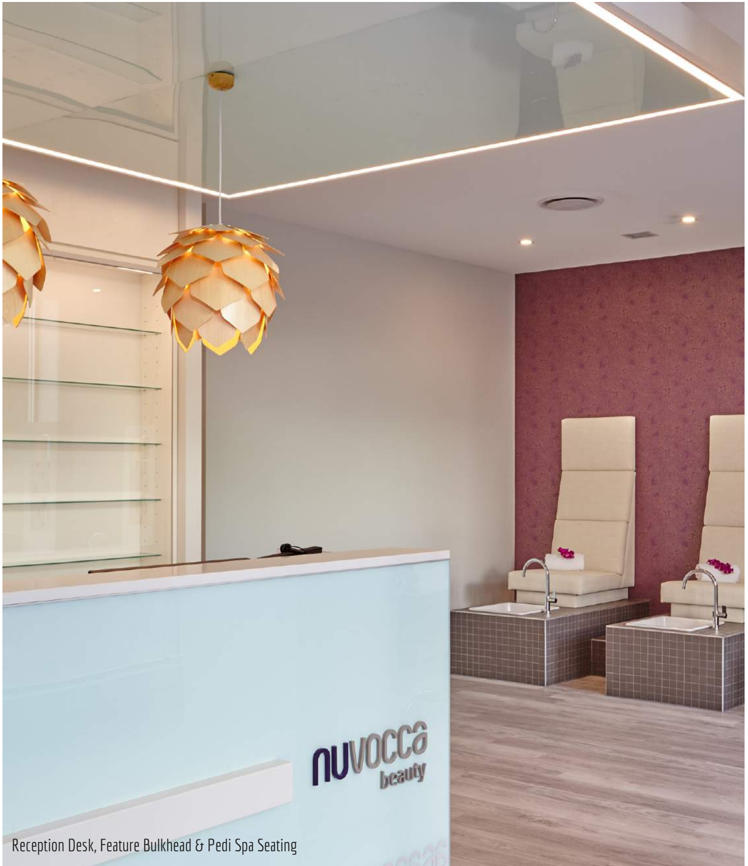
Reception Desk, Feature Bulkhead & Pedi Spa Seating