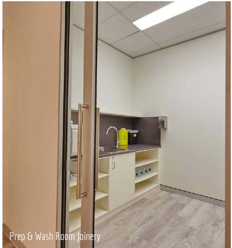
Prep & Wash Room Joinery