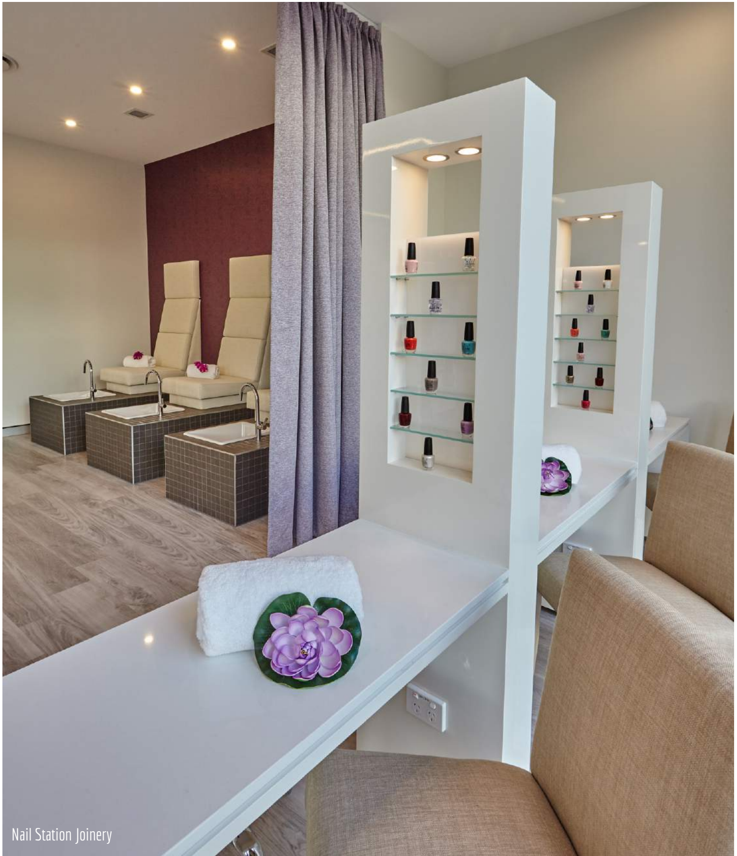
Nail Station Joinery