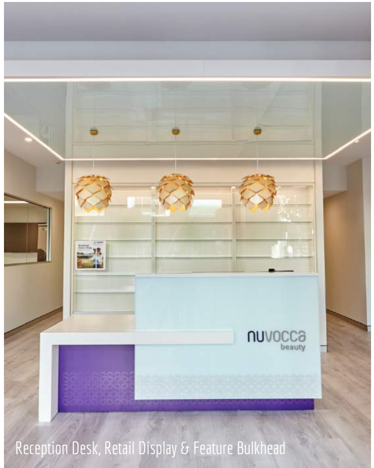
Reception Desk, Retail Display & Feature Bulkhead