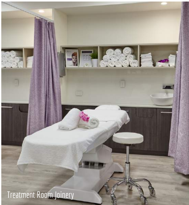
Treatment Room Joinery