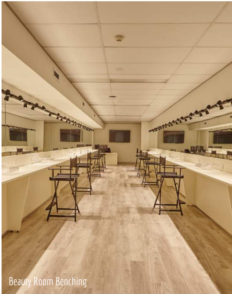
Beauty Room Benching