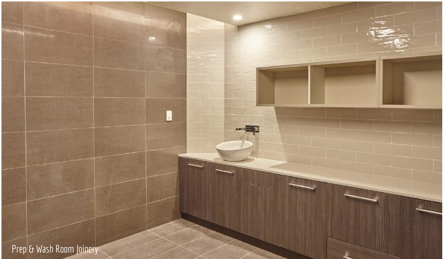
Prep & Wash Room Joinery