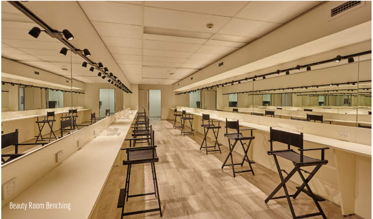
Beauty Room Benching