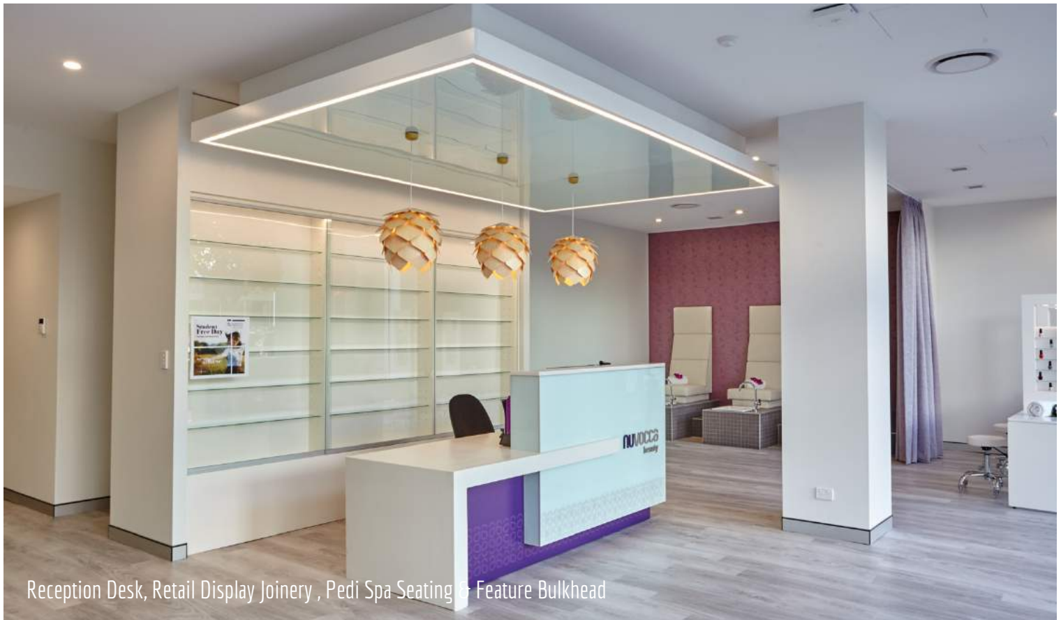
Reception Desk, Retail Display Joinery , Pedi Spa Seating & Feature Bulkhead