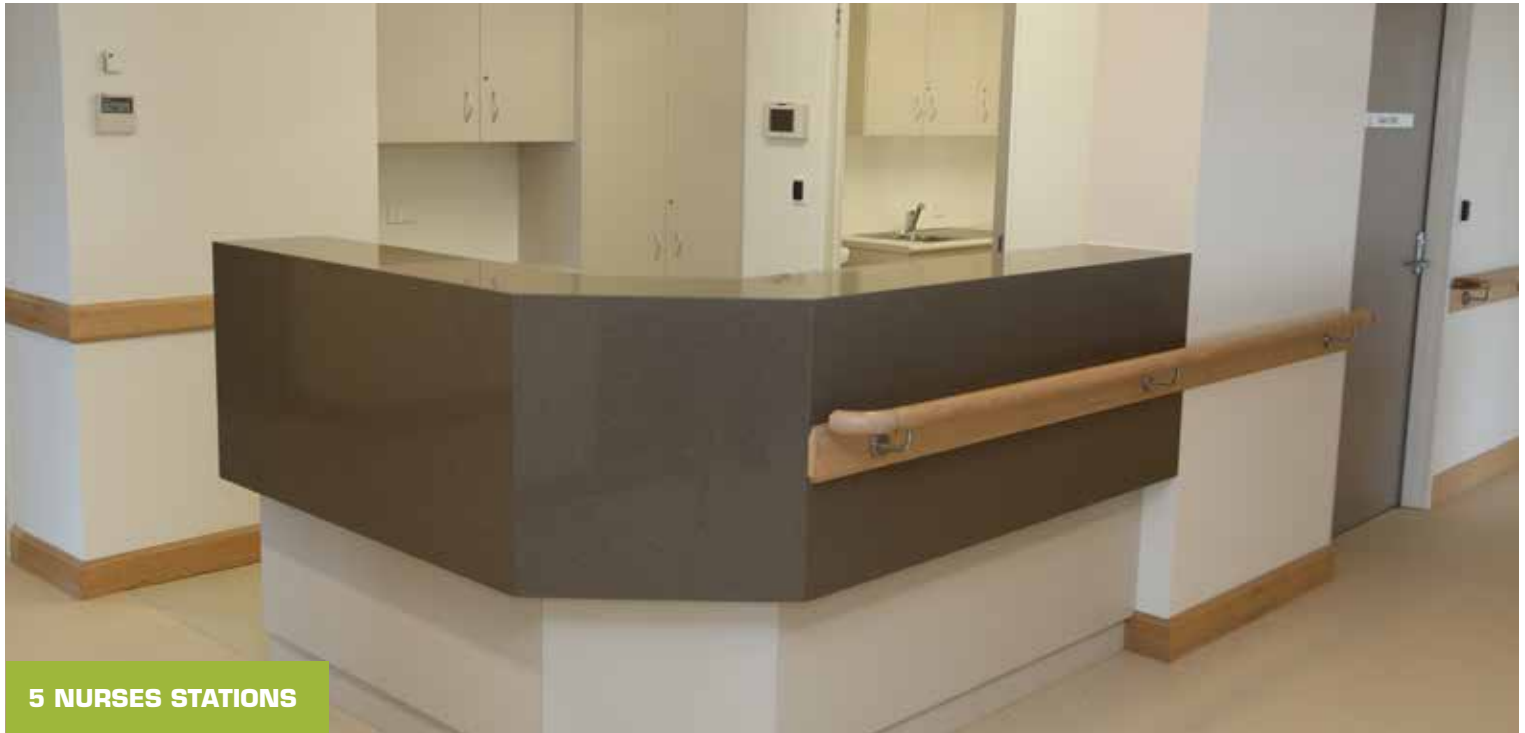
5 NURSES STATIONS