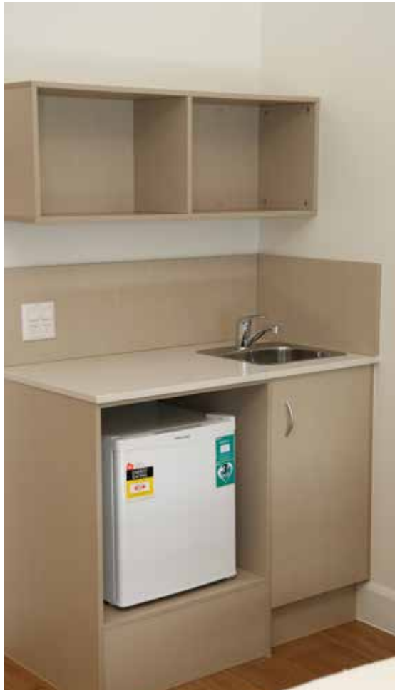
83 SELF CARE KITCHENETTES