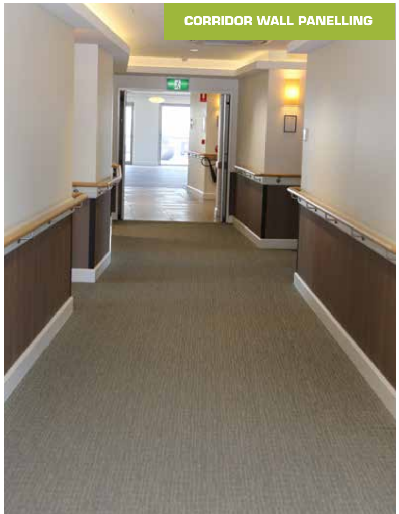
CORRIDOR WALL PANNELLING