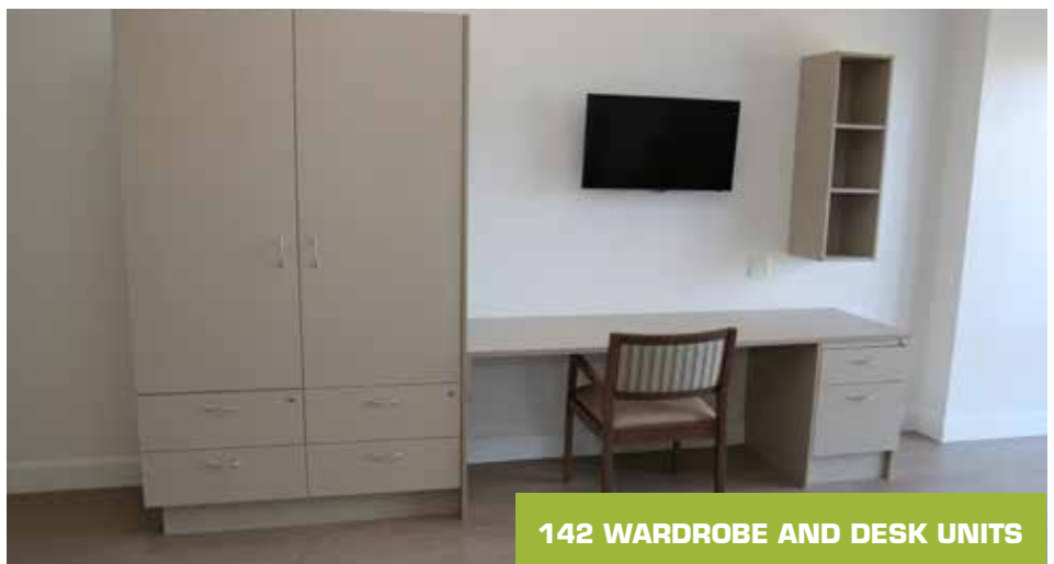
142 WARDROBE AND DESK UNITS