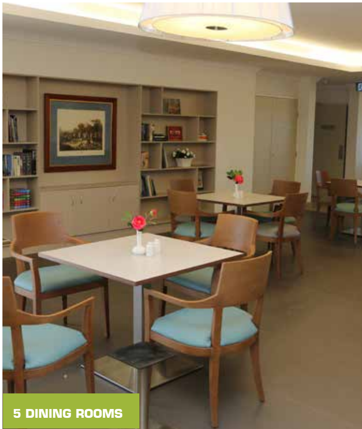
5 DINING ROOMS