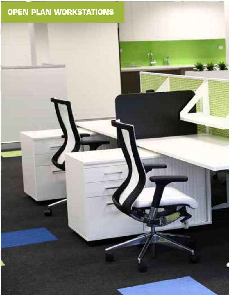
OPEN PLAN WORKSTATIONS