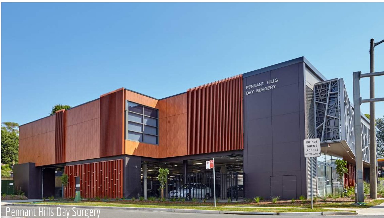
Pennant Hills Day Surgery