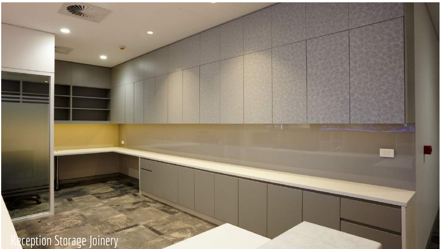
Reception Storage Joinery