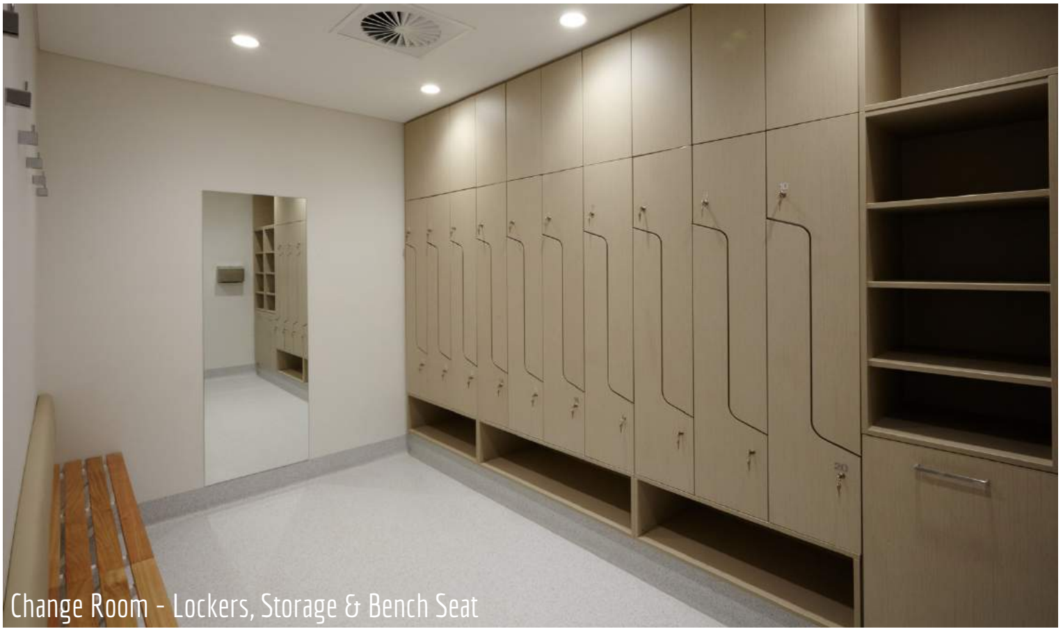
Change Room - Lockers, Storage & Bench Seat