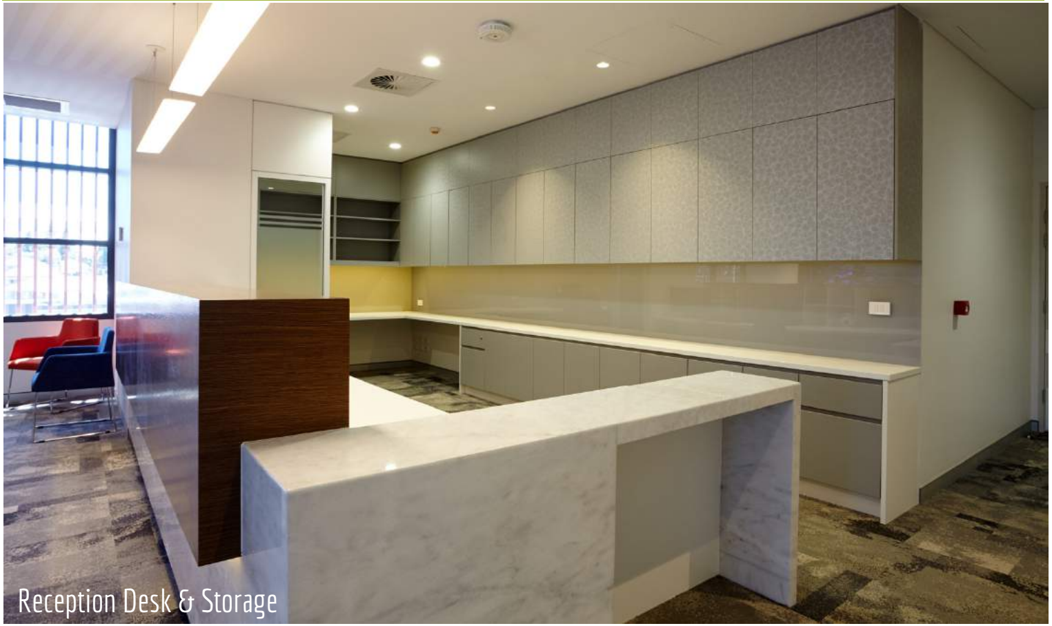
Reception Desk & Storage