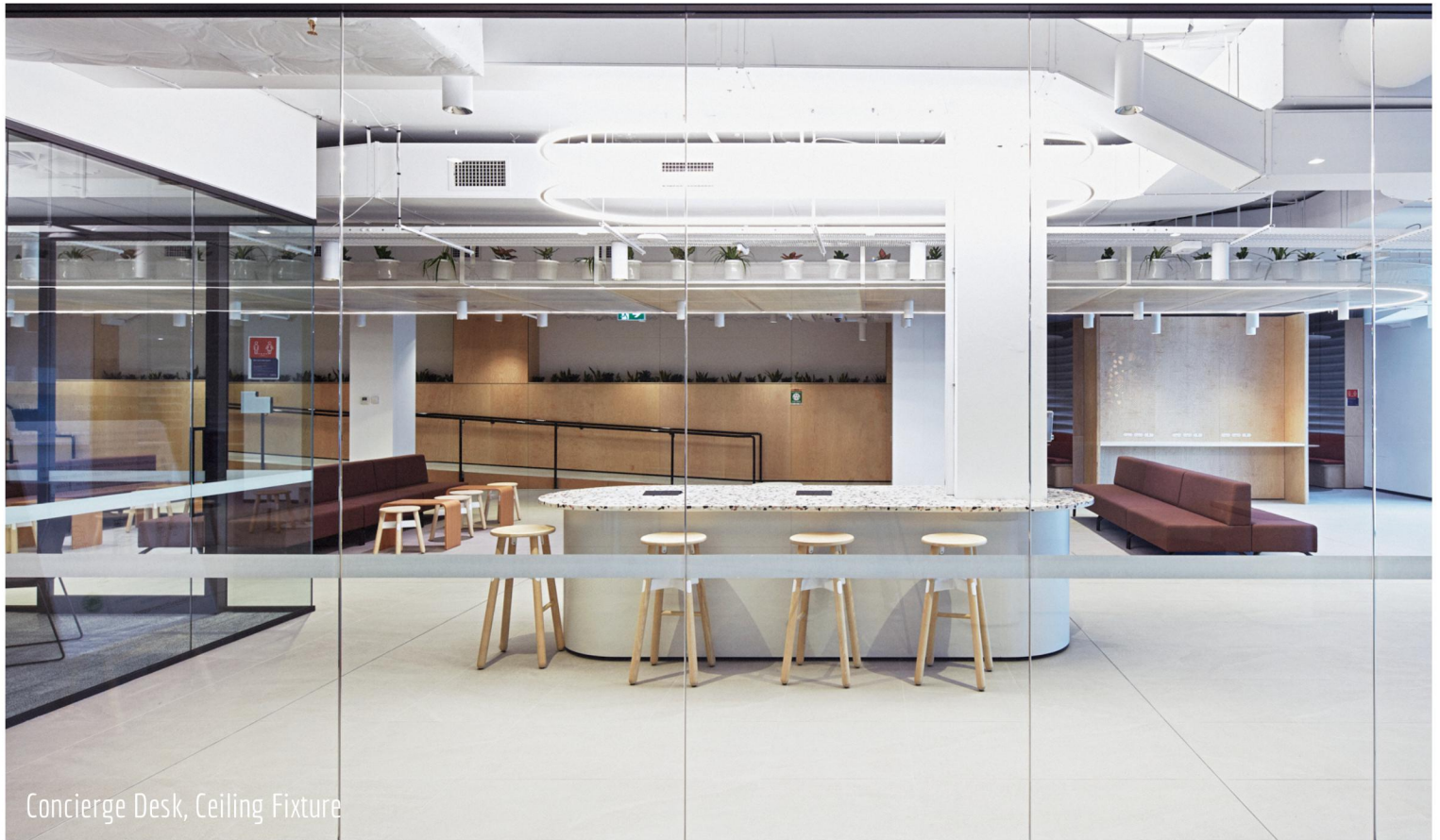
Concierge Desk, Ceiling Fixture