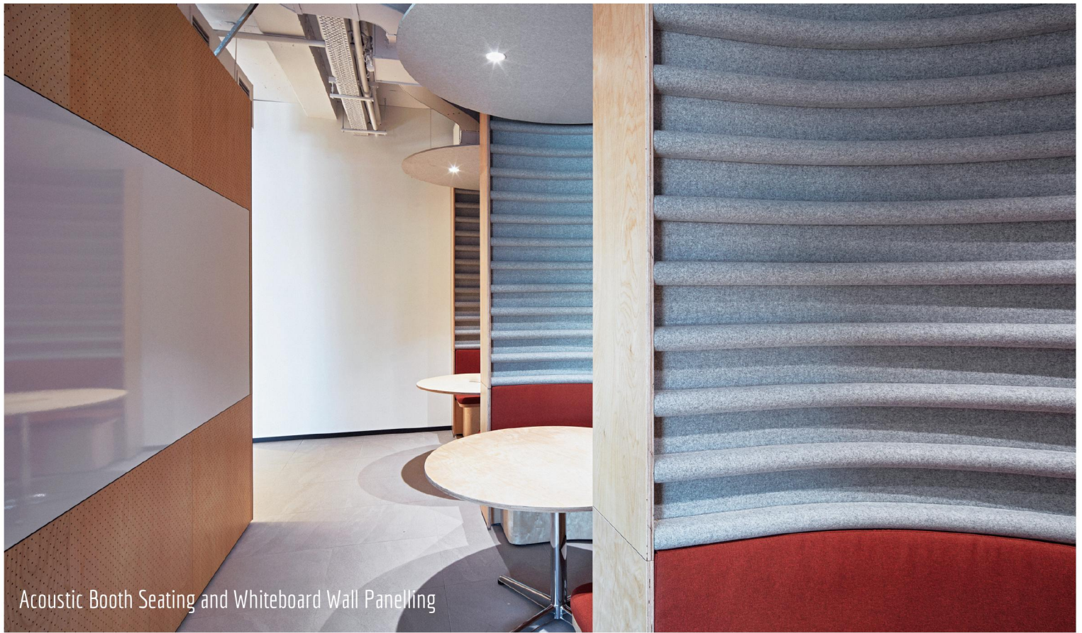
Acoustic Booth Seating and Whiteboard Wall Panelling