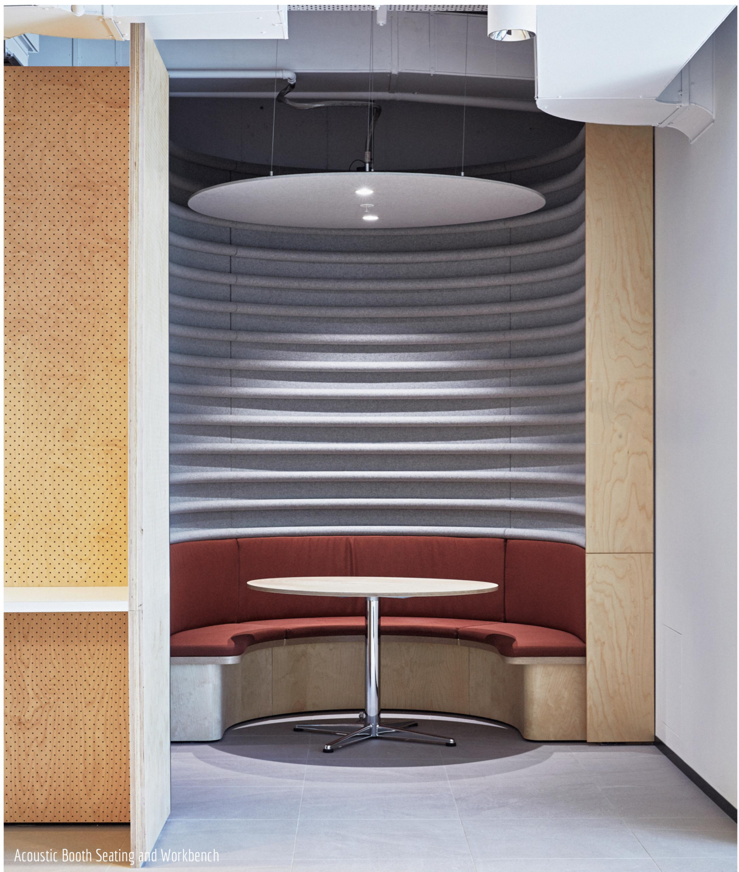
Acoustic Booth Seating and Workbench