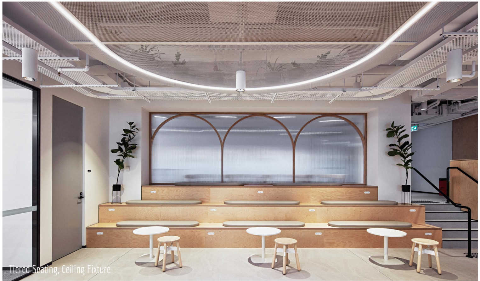
Tiered Seating, Ceiling Fixture