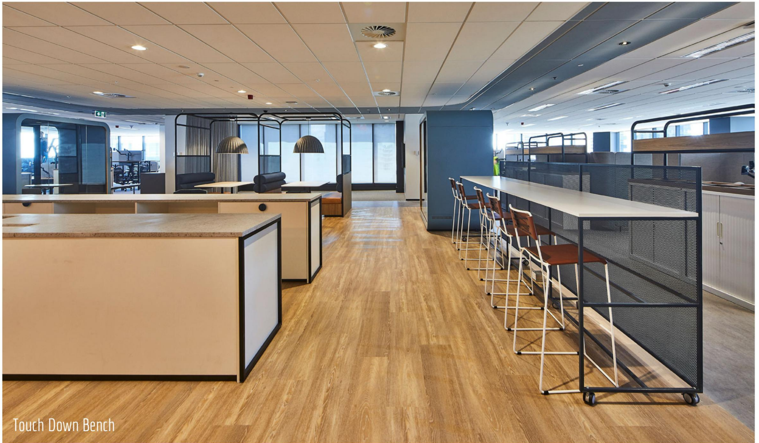
Touch Down Bench