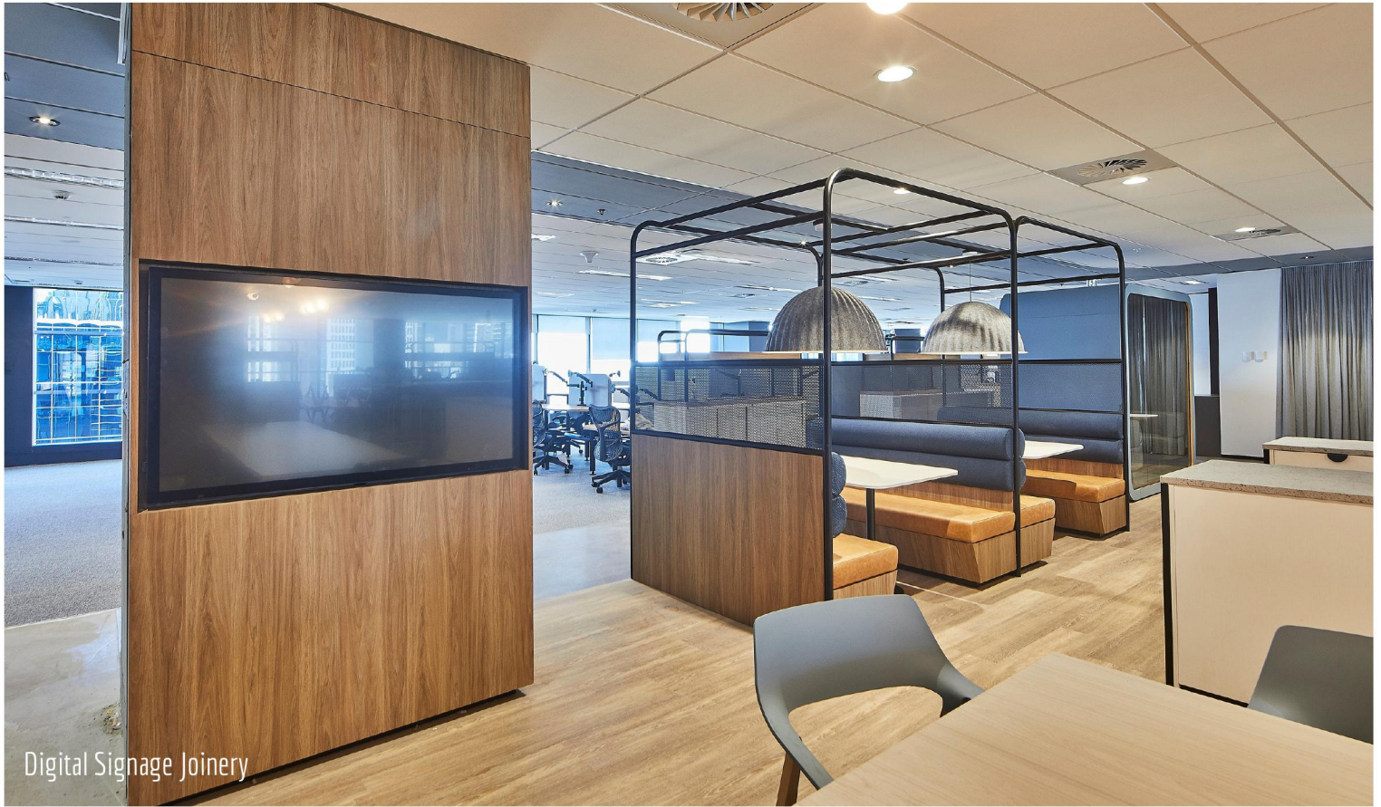
Digital Signage Joinery