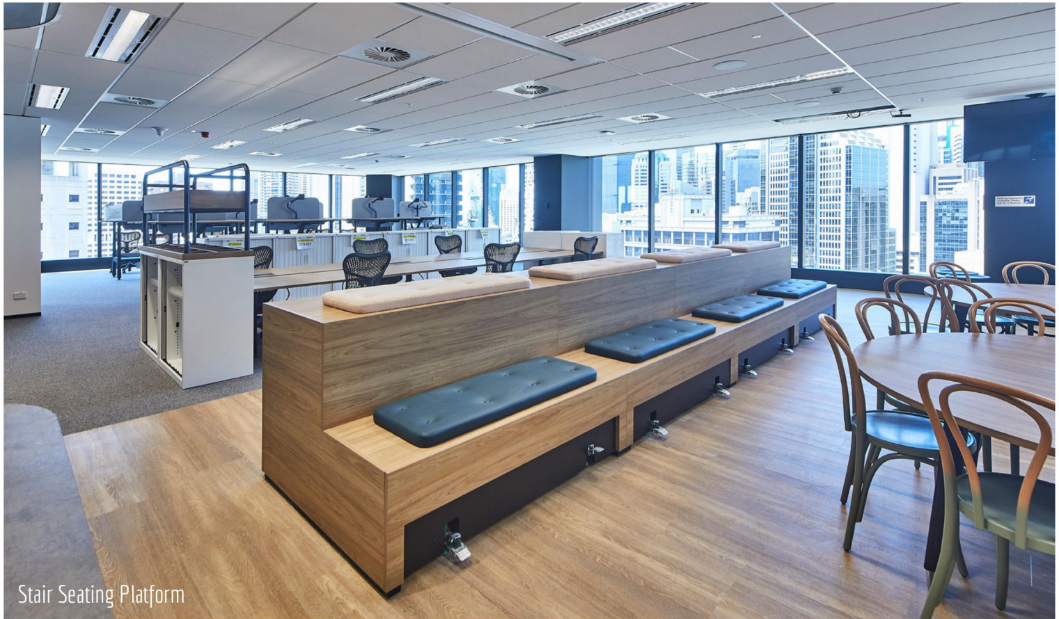
Stair Seating Platform