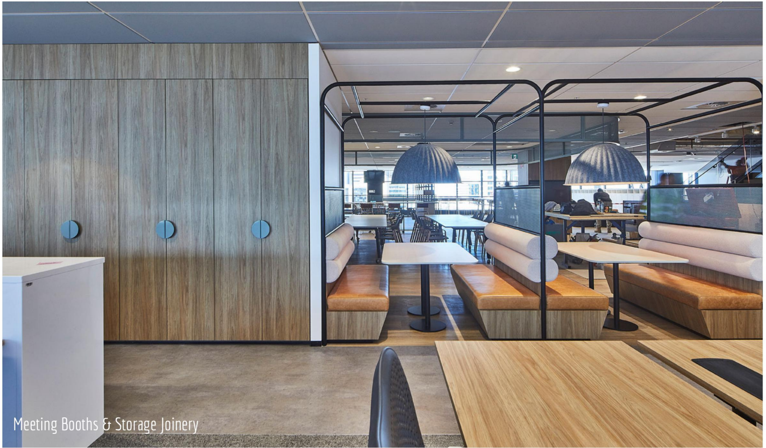
Meeting Booths & Storage Joinery