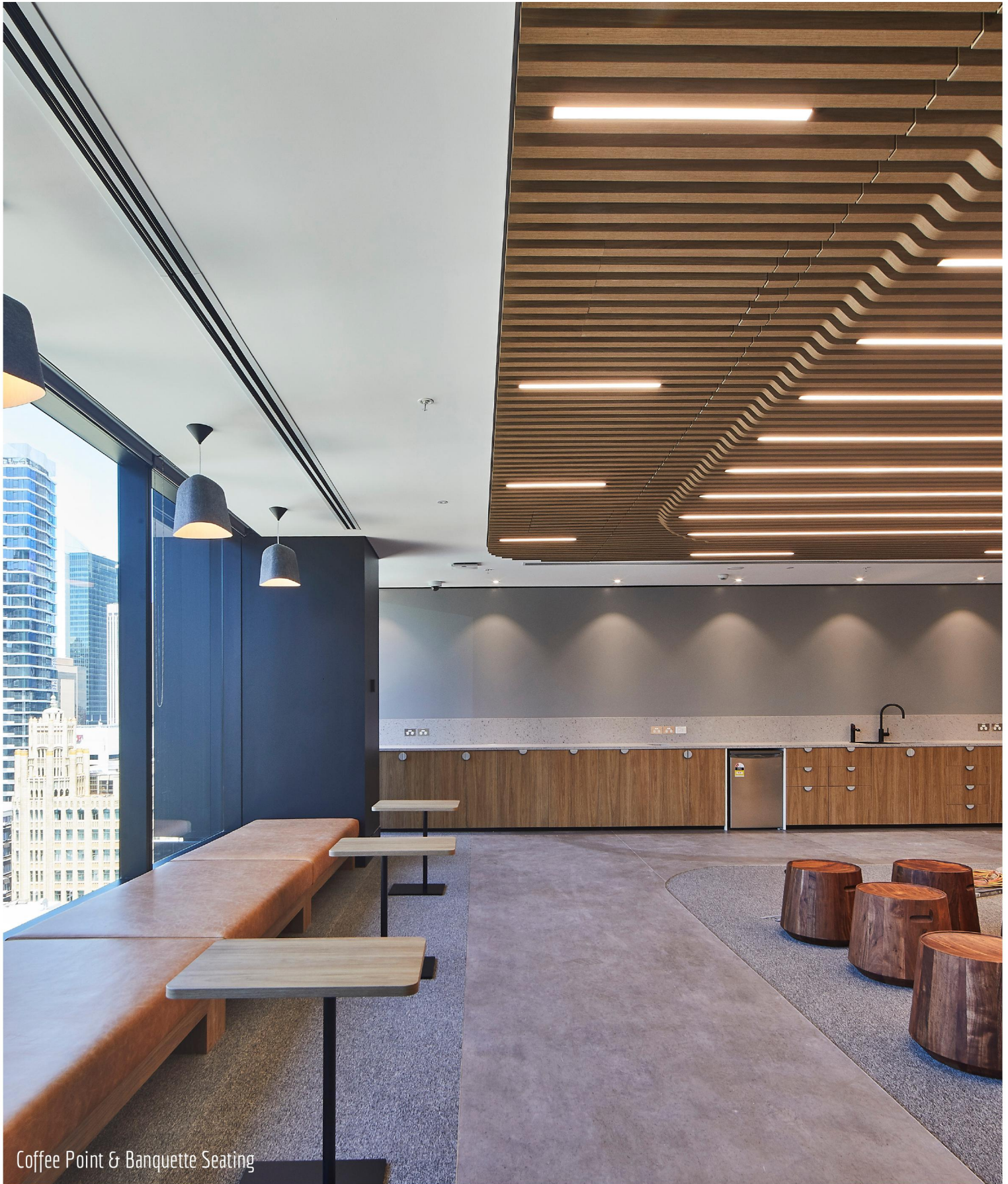
Coffee Point & Banquette Seating