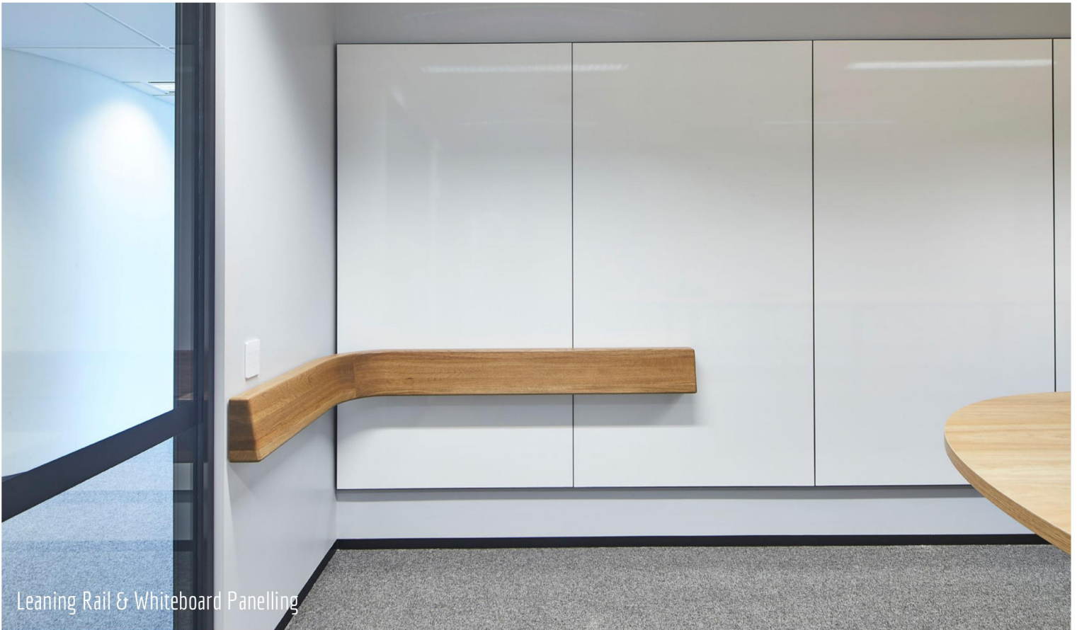
Leaning Rail & Whiteboard Panelling