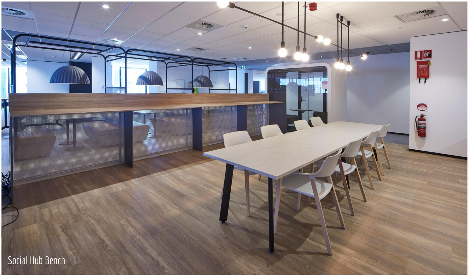
Social Hub Bench