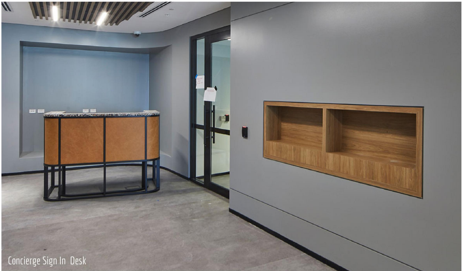
Concierge Sign In Desk